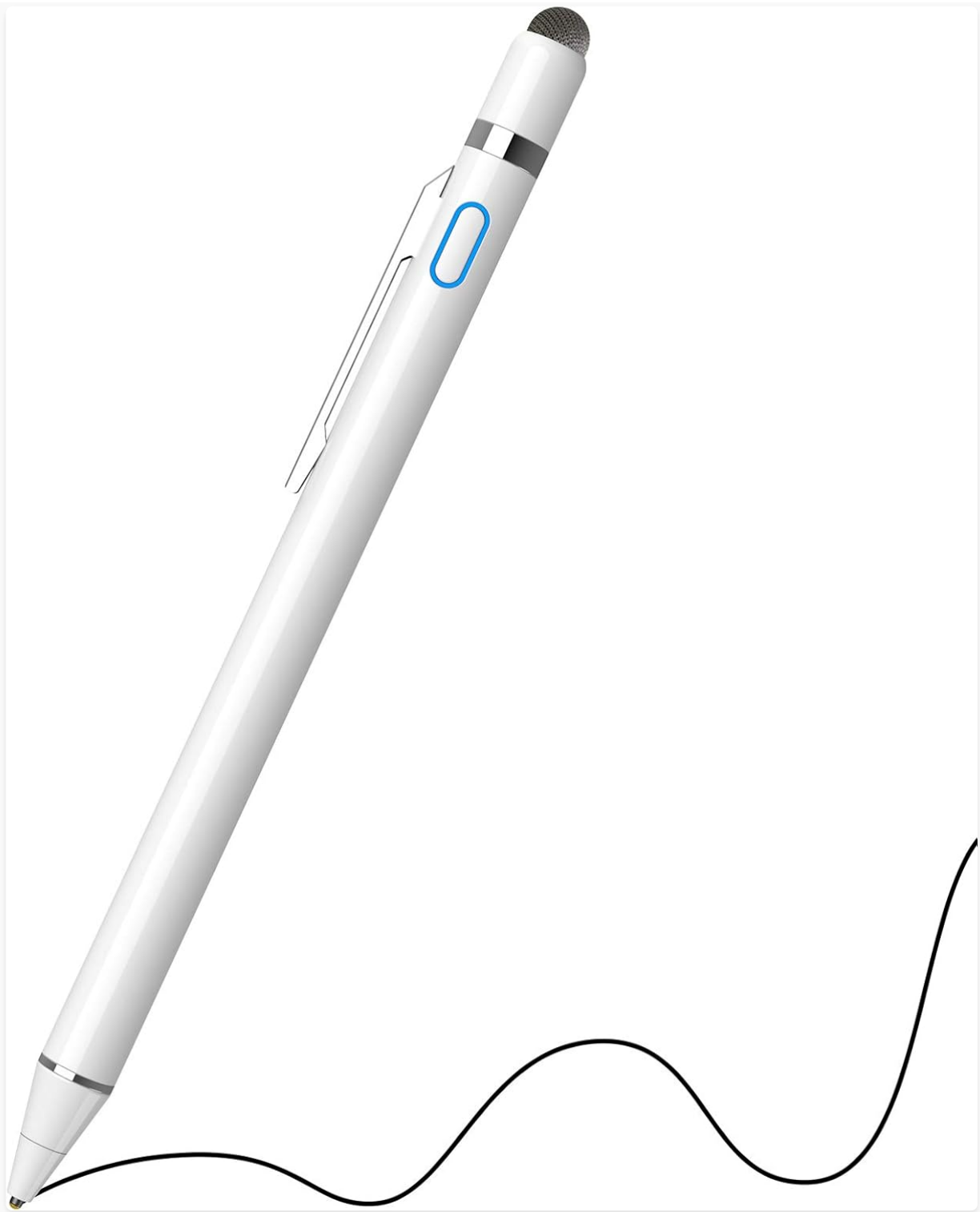
Figure 1: NTHJOYS Digital Stylus Pen Overview