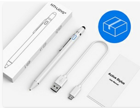
Figure 2: Included Package Contents