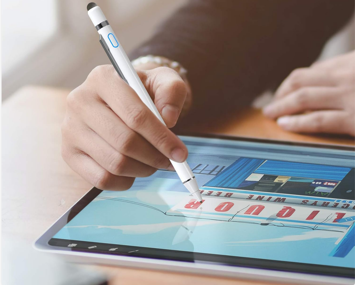
Figure 6: Ergonomic Design in Use