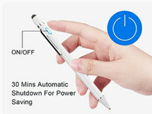
Figure 5: Power Button Location