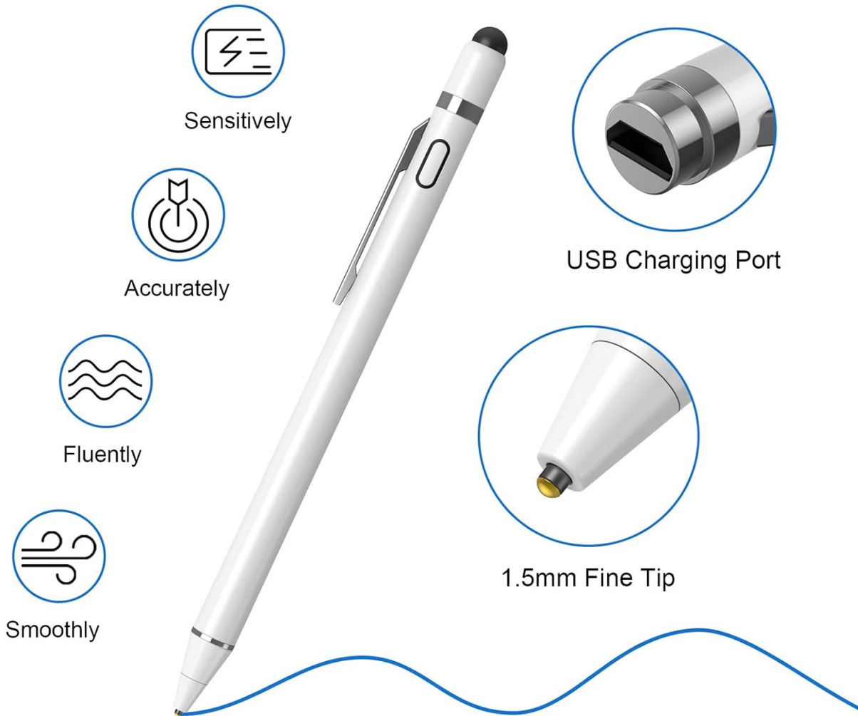
Figure 3: Stylus Features and Fine Tip Detail

2 in 1 Mesh Tip & Fine Tip, Perfect for Writing, Drawing, Taking Notes and Signature