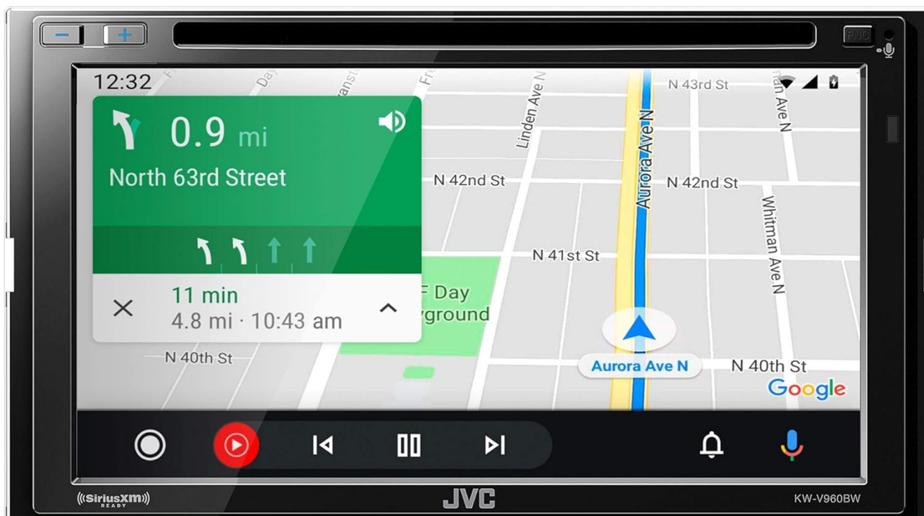
Image 3.2: Android Auto interface showing navigation on the JVC KW-V960BW.

Connect your Android smartphone wirelessly to utilize Android Auto. Enable Bluetooth and Wi-Fi on your Android device and follow the pairing instructions on the receiver. Android Auto provides access to Google Maps, voice commands, messaging, and media playback.