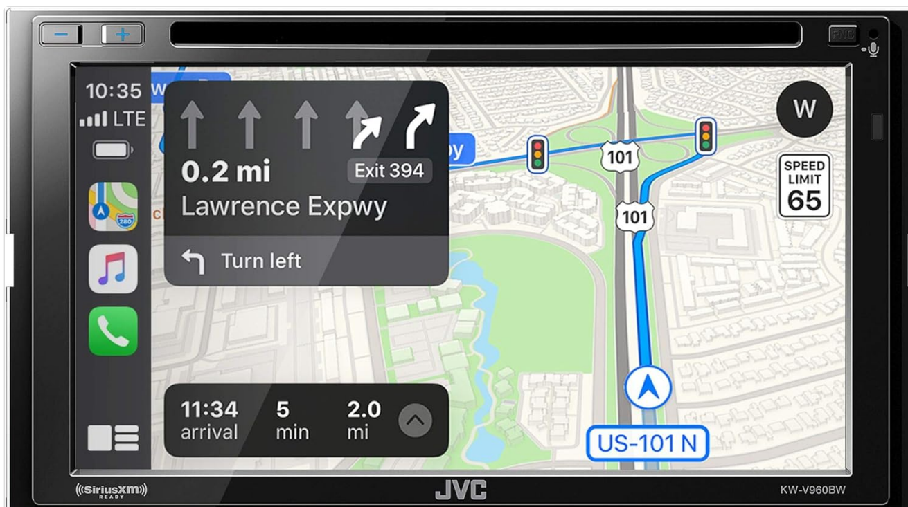
Image 3.1: Apple CarPlay interface showing navigation on the JVC KW-V960BW.