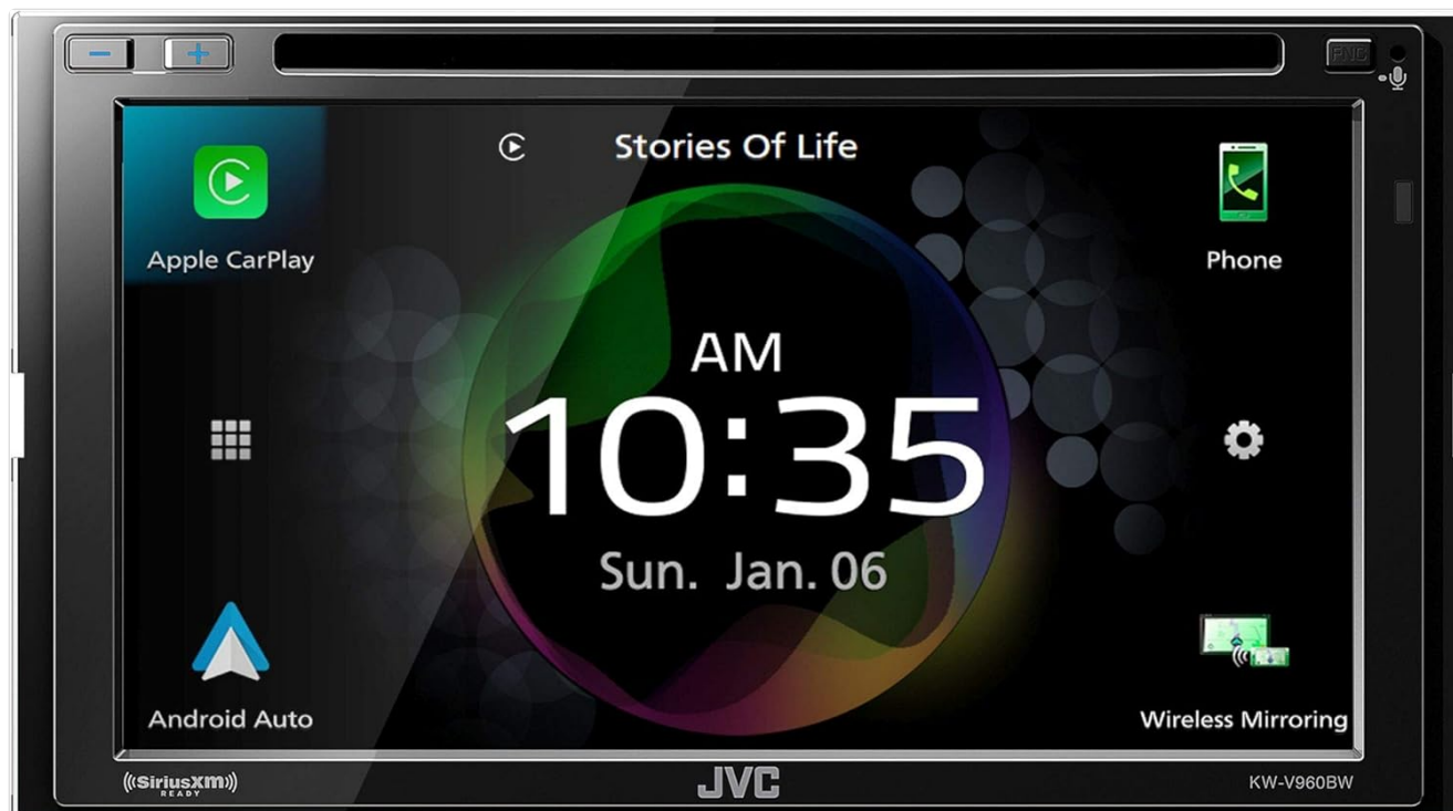
Image 3.3: JVC KW-V960BW home screen displaying time and application icons.

two fingers can split the screen or change the information window layout.