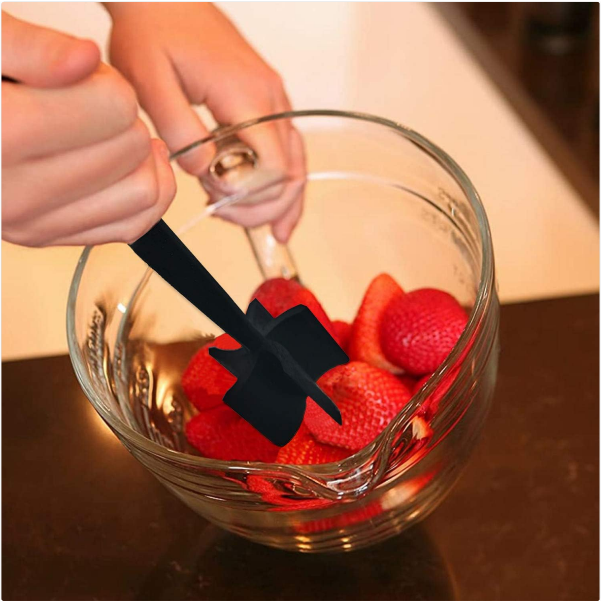
Image: The meat chopper is also effective for mashing soft fruits like strawberries.