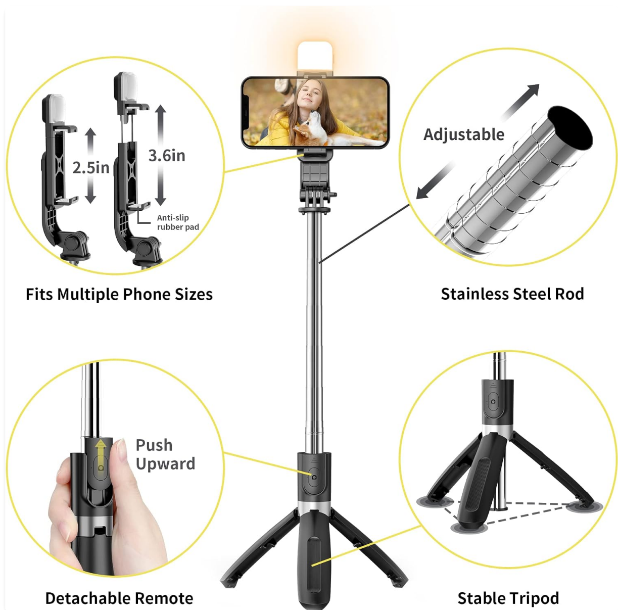
Detailed diagram illustrating the components and setup steps of the SelfieShow L02S Selfie Stick.