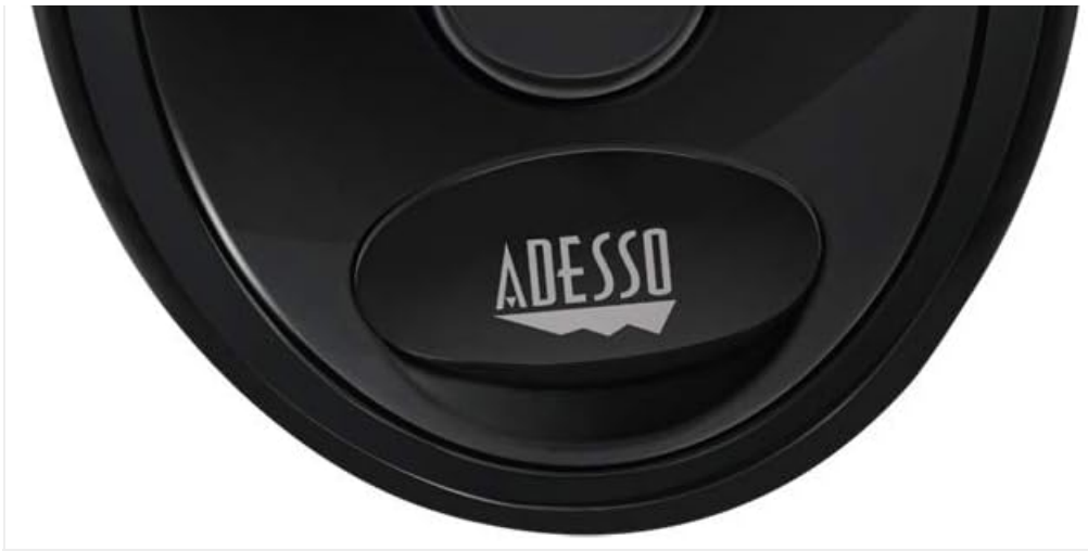
Top view of the Adesso Xstream H5U Headset, highlighting the adjustable headband for a comfortable fit.