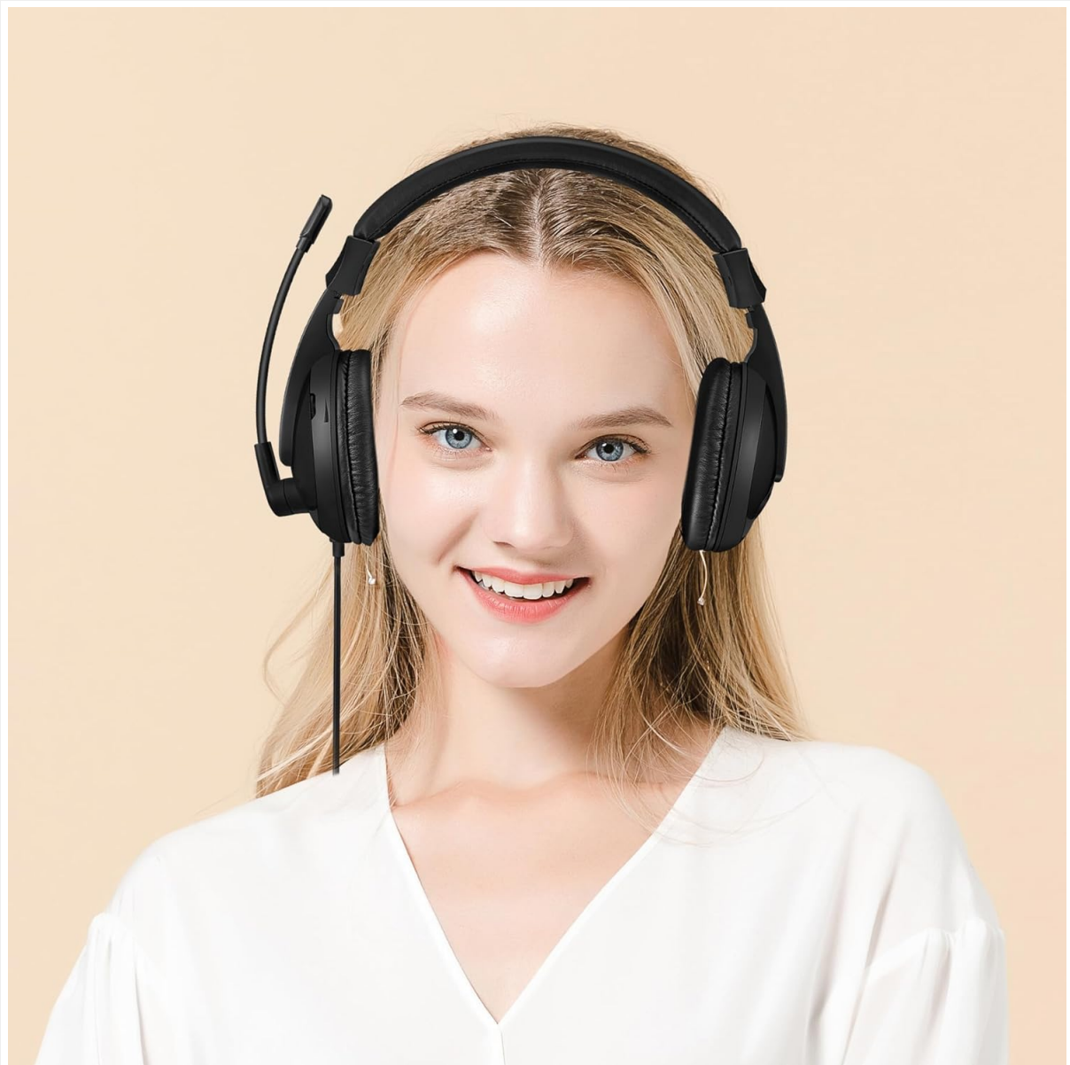
A user wearing the Adesso Xstream H5U Headset, demonstrating its comfortable over-ear design during use.