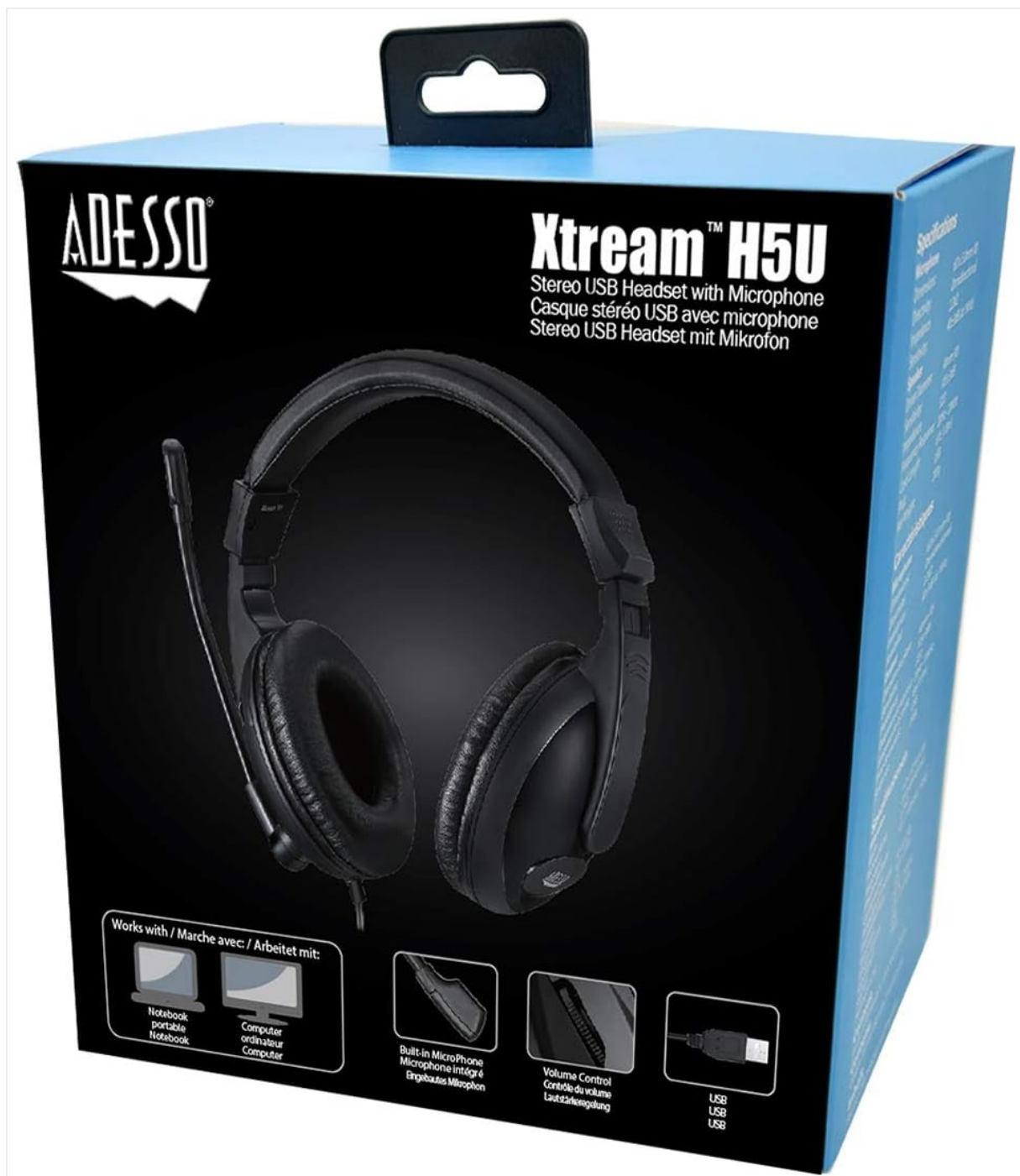
The retail packaging for the Adesso Xtream H5U Stereo USB Multimedia Headset, indicating its contents and features.