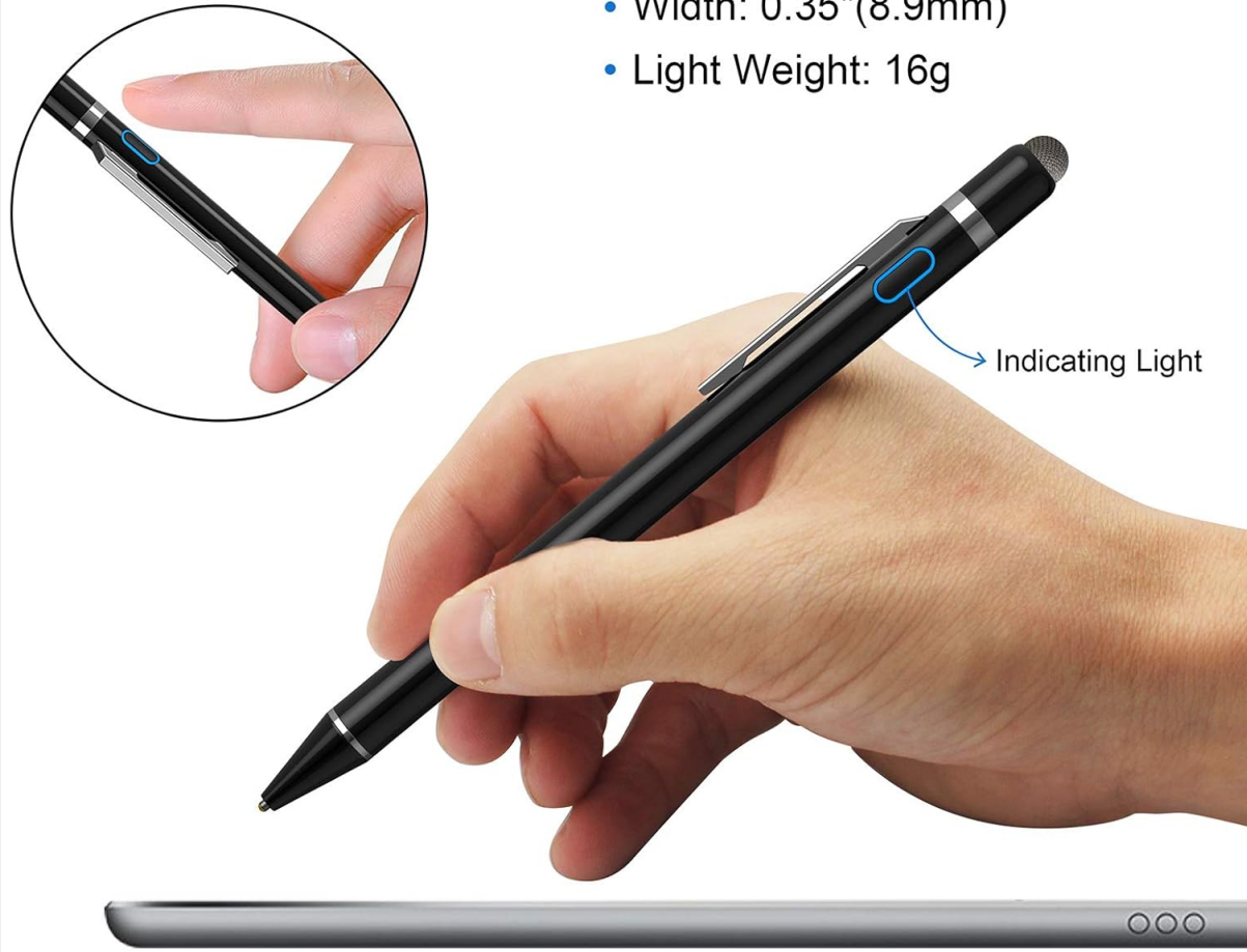
Image 4.1: A hand holding the NTHJOYS stylus, illustrating its comfortable grip and the visible indicating light.