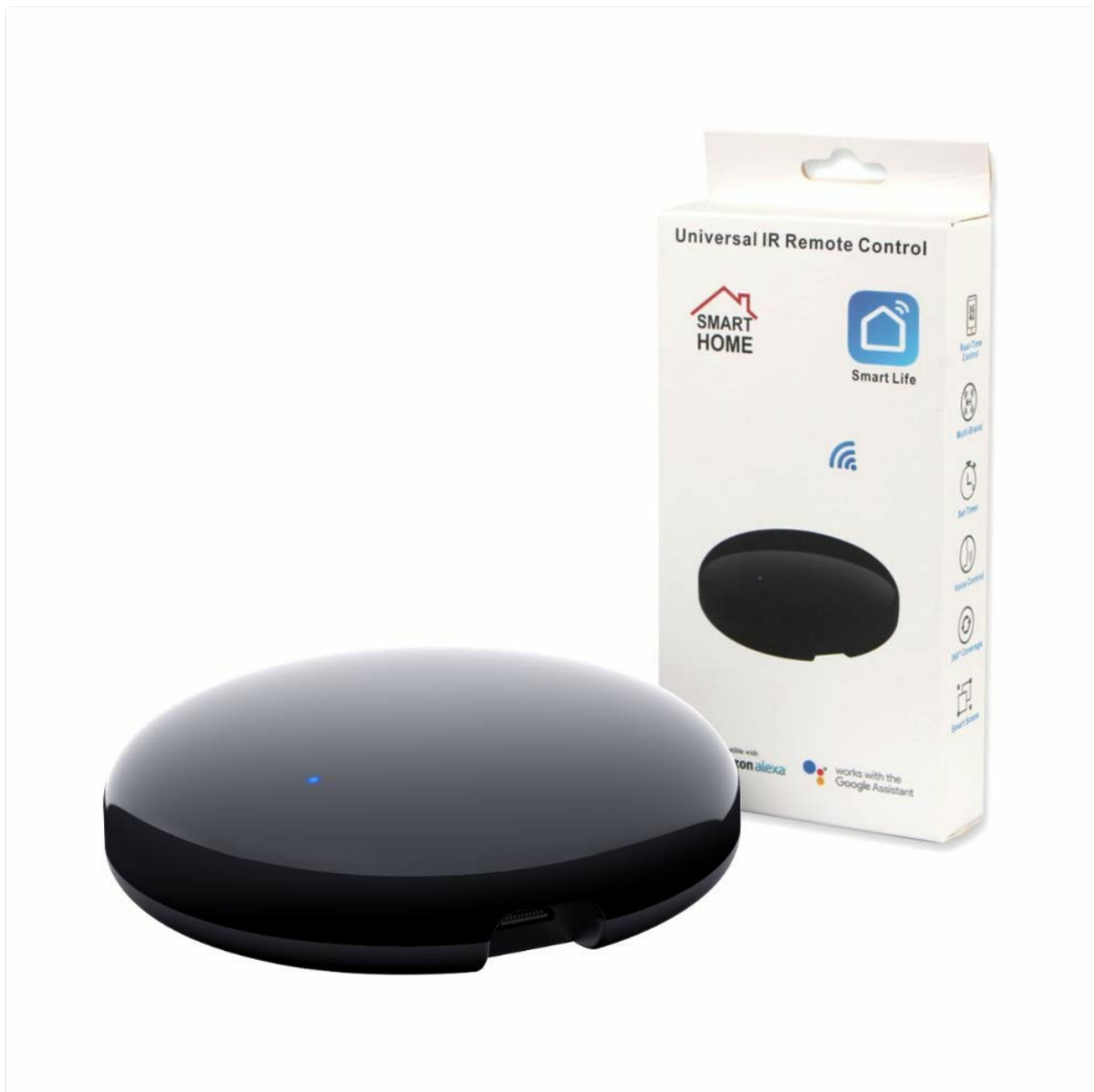
Image: A close-up view of the Avatto S08 Tuya Smart IR Universal Remote Control, a compact black disc-shaped device with a status indicator light.