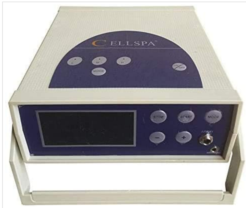
Detail of the control panel, indicating connection points for the array and wrist wrap, and the main operational buttons.