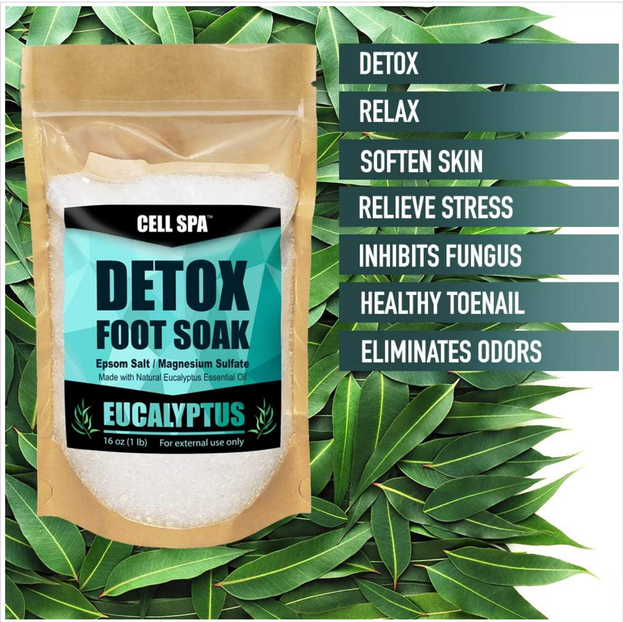
The Eucalyptus Detox Foot Soak product packaging.