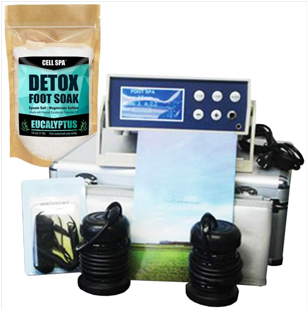
The main Cell Spa unit, featuring the digital LCD display and control panel.