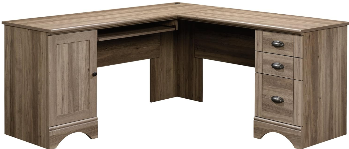
Image 1.1: The Sauder Harbor View Corner Computer Desk, showcasing its L-shaped design and Salt Oak finish.

The desk features a slide-out keyboard/mouse shelf with metal runners and safety stops. Ensure all components are securely fastened during assembly to prevent injury. Always follow recommended assembly procedures. This product is designed for adult use.