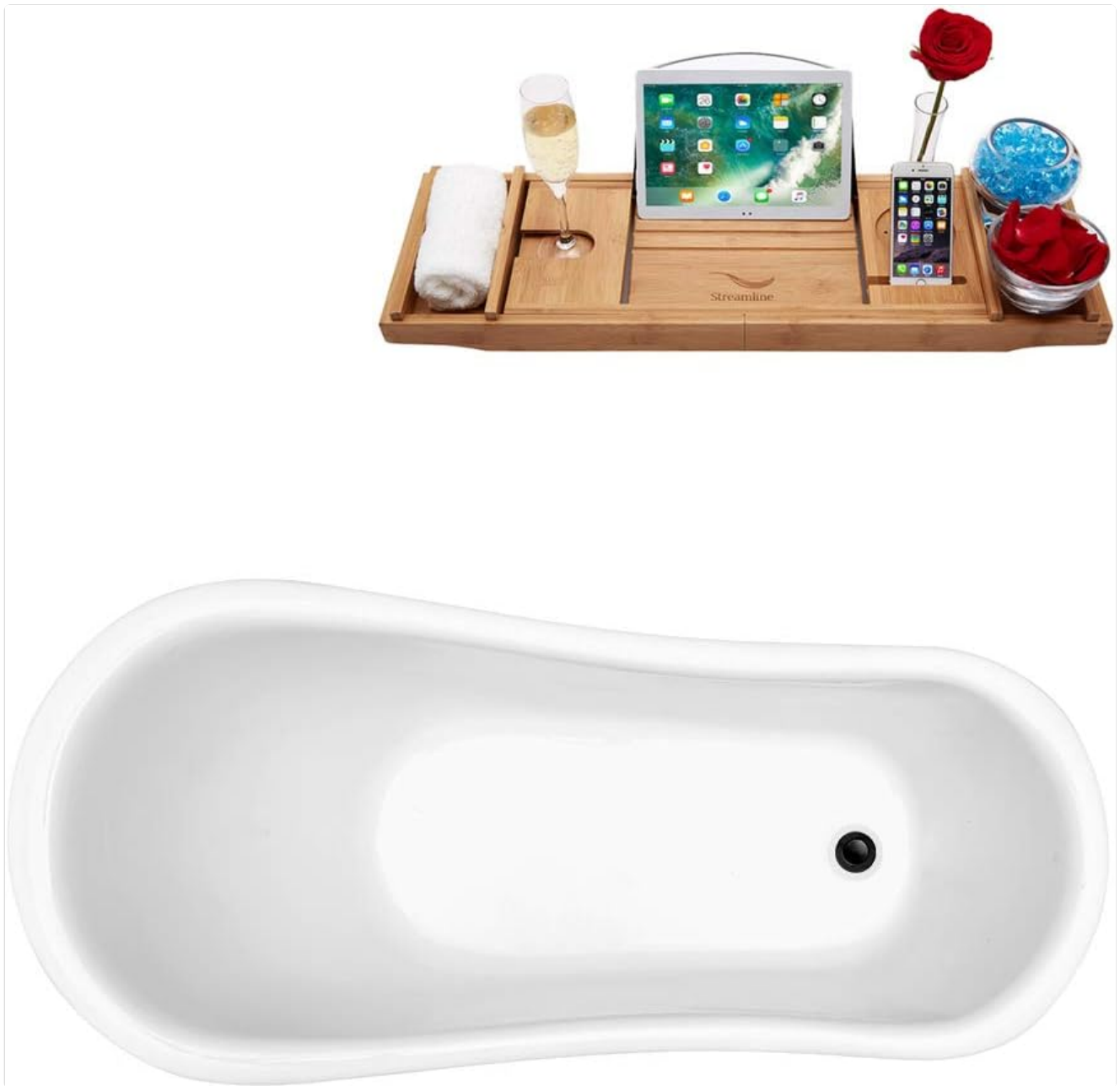
Figure 3: Bathtub Drain Location.