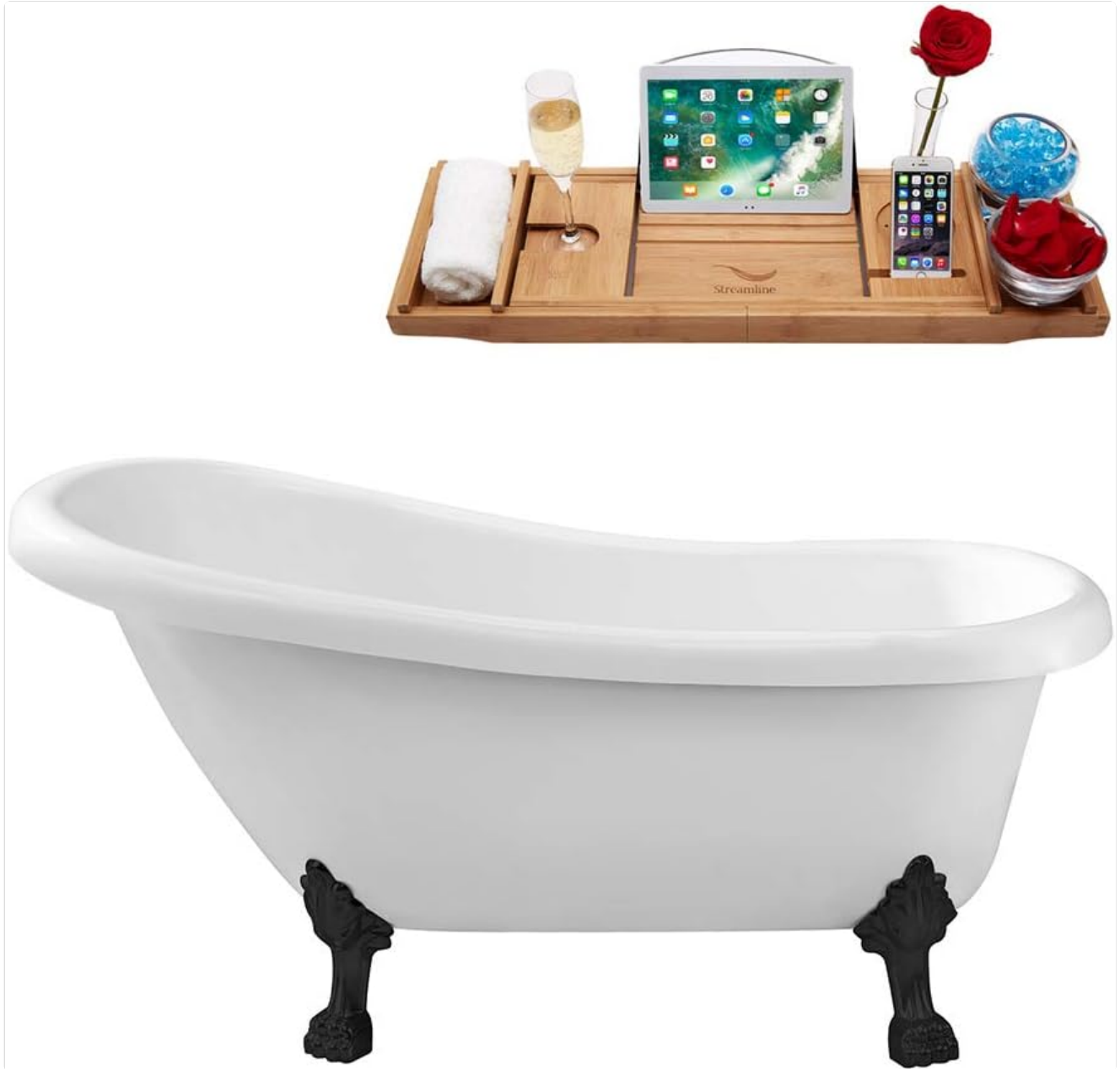
Figure 1: The Streamline 61-inch Clawfoot Soaking Bathtub.

Carefully remove the bathtub from its box. It is recommended that the bathtub is carried by a minimum of two people. Ensure to carry and set down the bathtub only in the upside-down position to prevent damage. Gently place the bathtub in the upside-down position on a tarp or cardboard sheet in order to avoid contact with any rough surface.