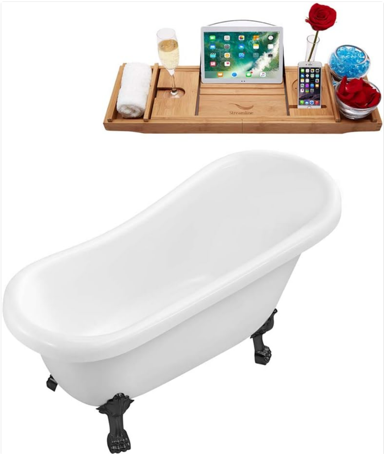
Figure 6: Bathtub with included Bamboo Tray.