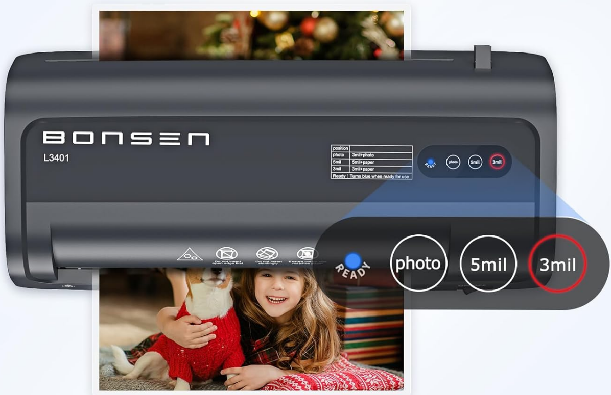
Photo Photo Mode Lighter Items

Suitable for 3-5 mil thick thermal pouches