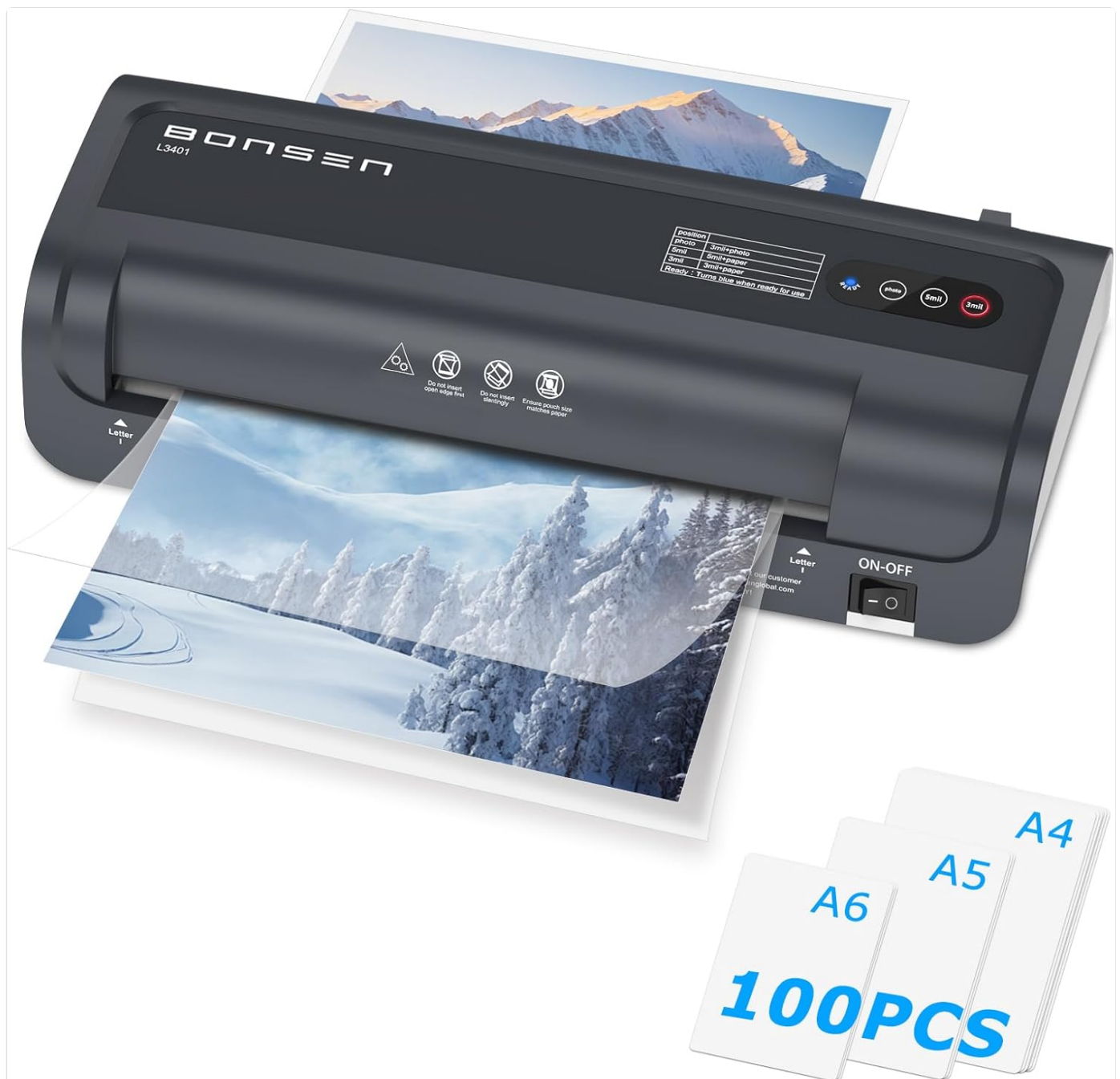
A top-down view of the BONSEN A4 Laminator Machine, showing the power switch, mode selection buttons (Photo, 5mil, 3mil), and indicator lights.