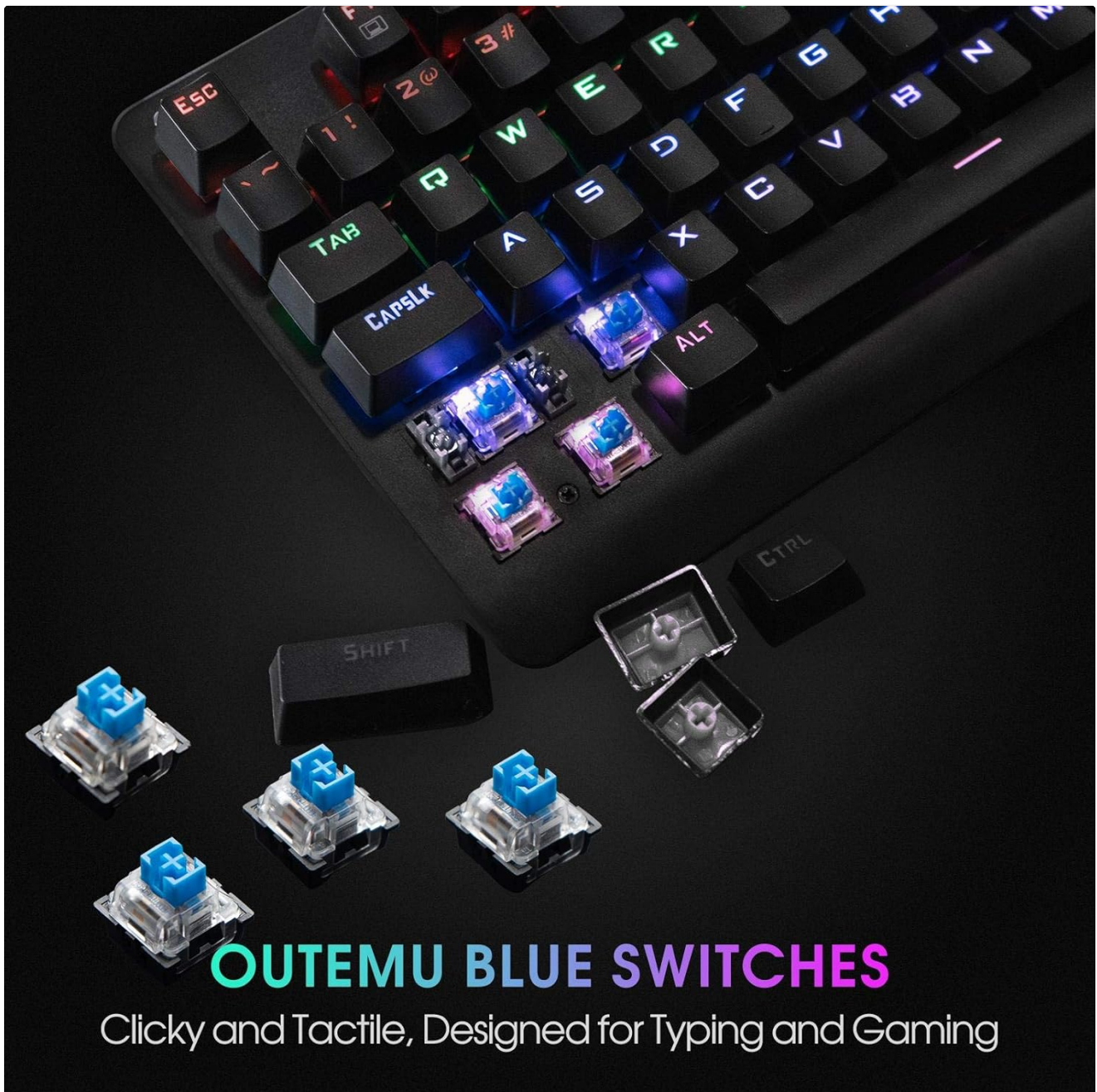
Image: Detailed view of the Outemu Blue Switches.

This provides a satisfying typing experience with a clear actuation point.