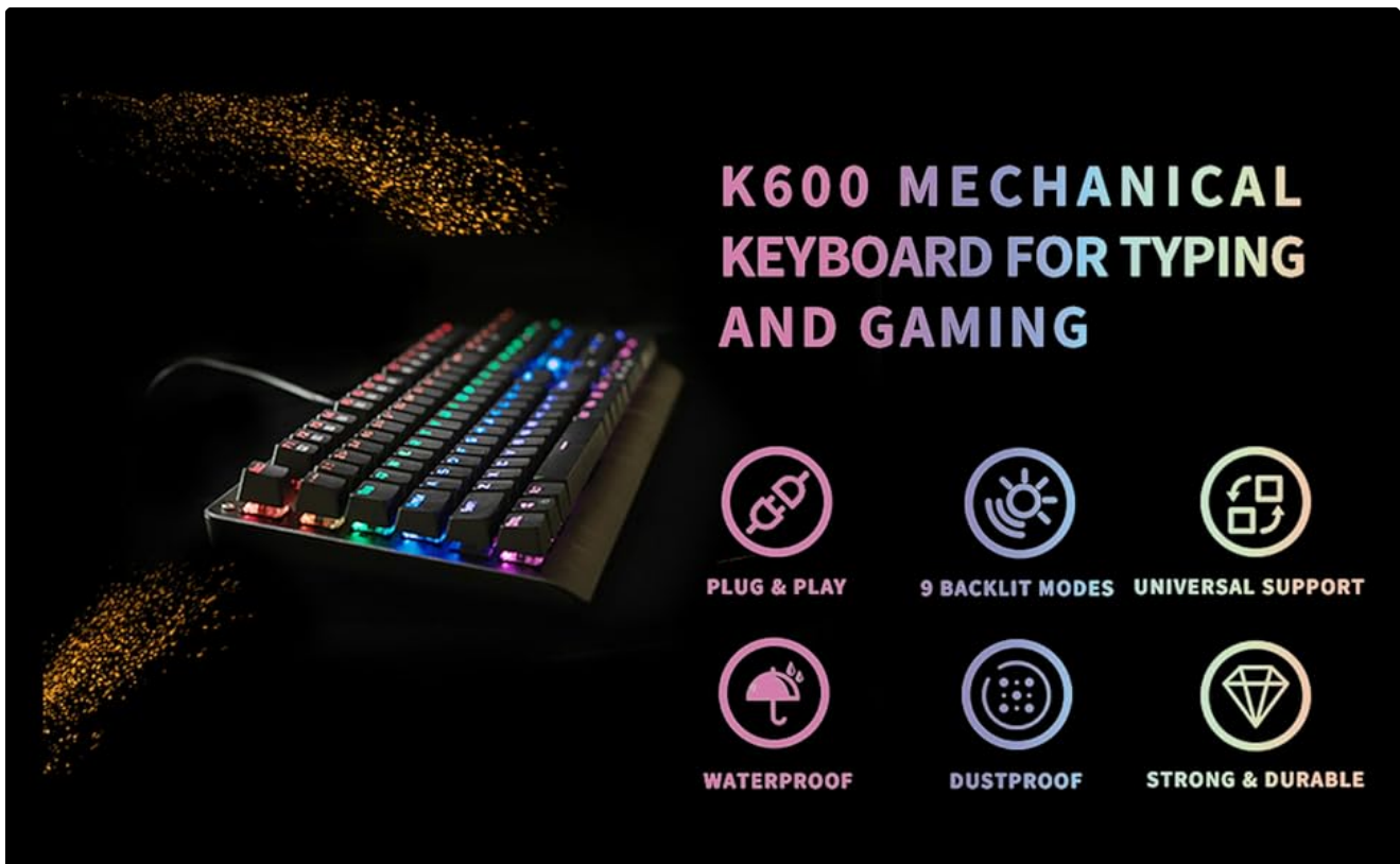
Image: E-YOOSO K600 Mechanical Keyboard highlighting its key features.

This manual provides detailed instructions for the E-YOOSO K600 Mechanical Keyboard. The K600 is a full-size 104-key USB wired mechanical keyboard featuring Outemu Blue Switches, designed for both typing and gaming. It includes customizable rainbow LED backlighting and is built for durability and responsive performance.