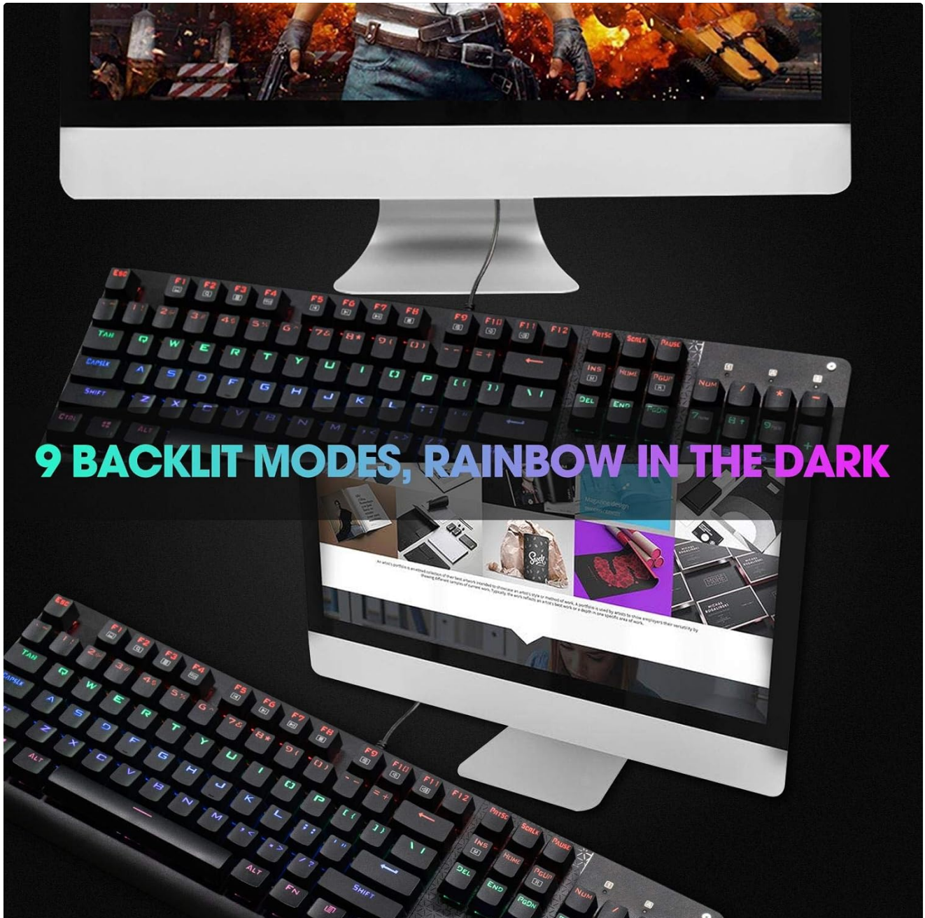
Image: Keyboard showcasing its 9 distinct backlight modes.