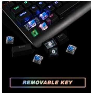
Image: Removable keycaps and switches for easy maintenance.