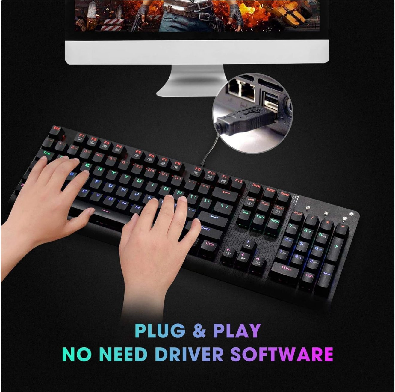
Image: Connecting the USB cable for plug-and-play setup.