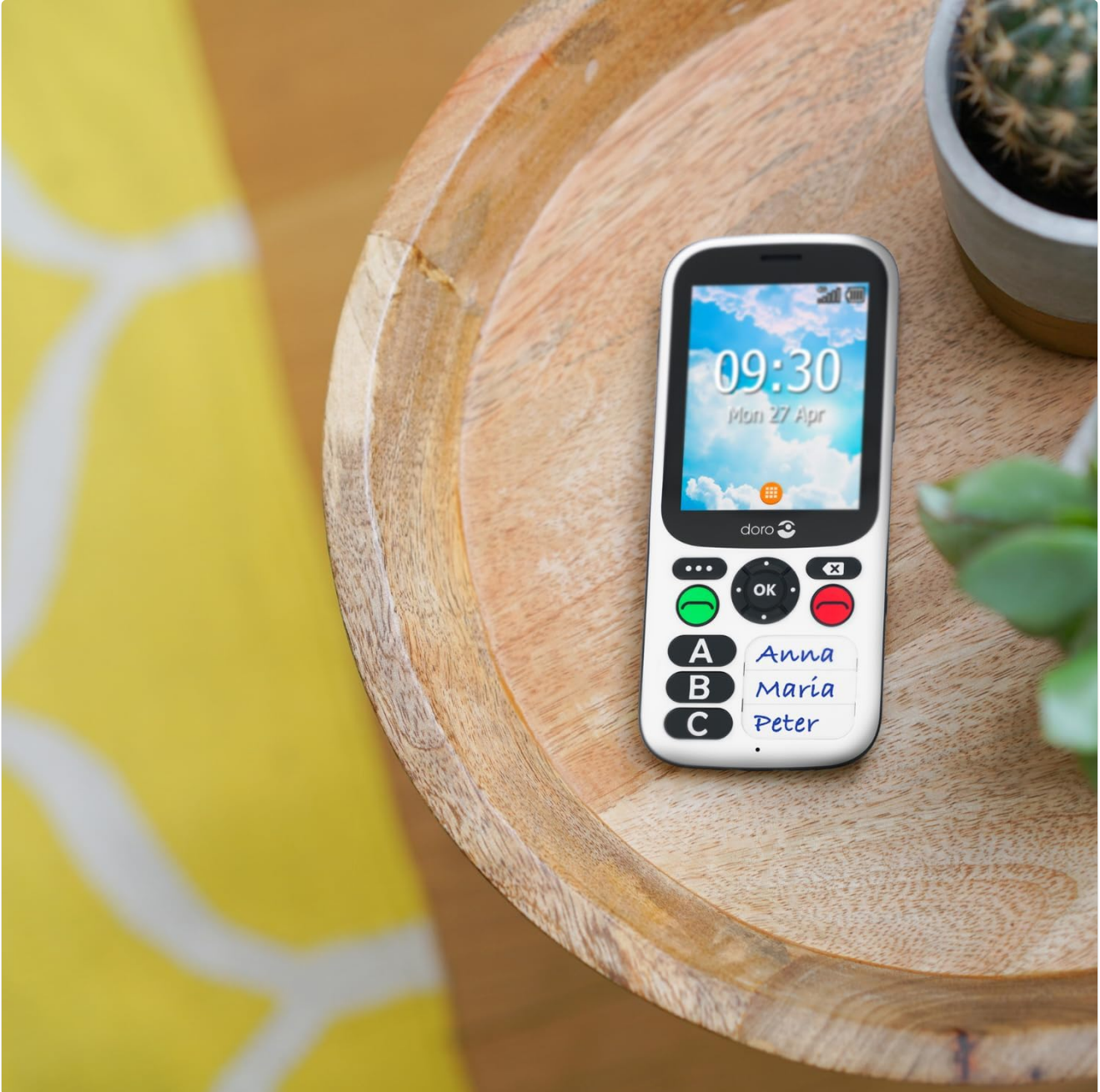
Image: The Doro 780X phone placed in its charging cradle for convenient charging.

Before first use, fully charge the phone. Place the phone in the charging cradle or connect the wall charger directly to the phone.