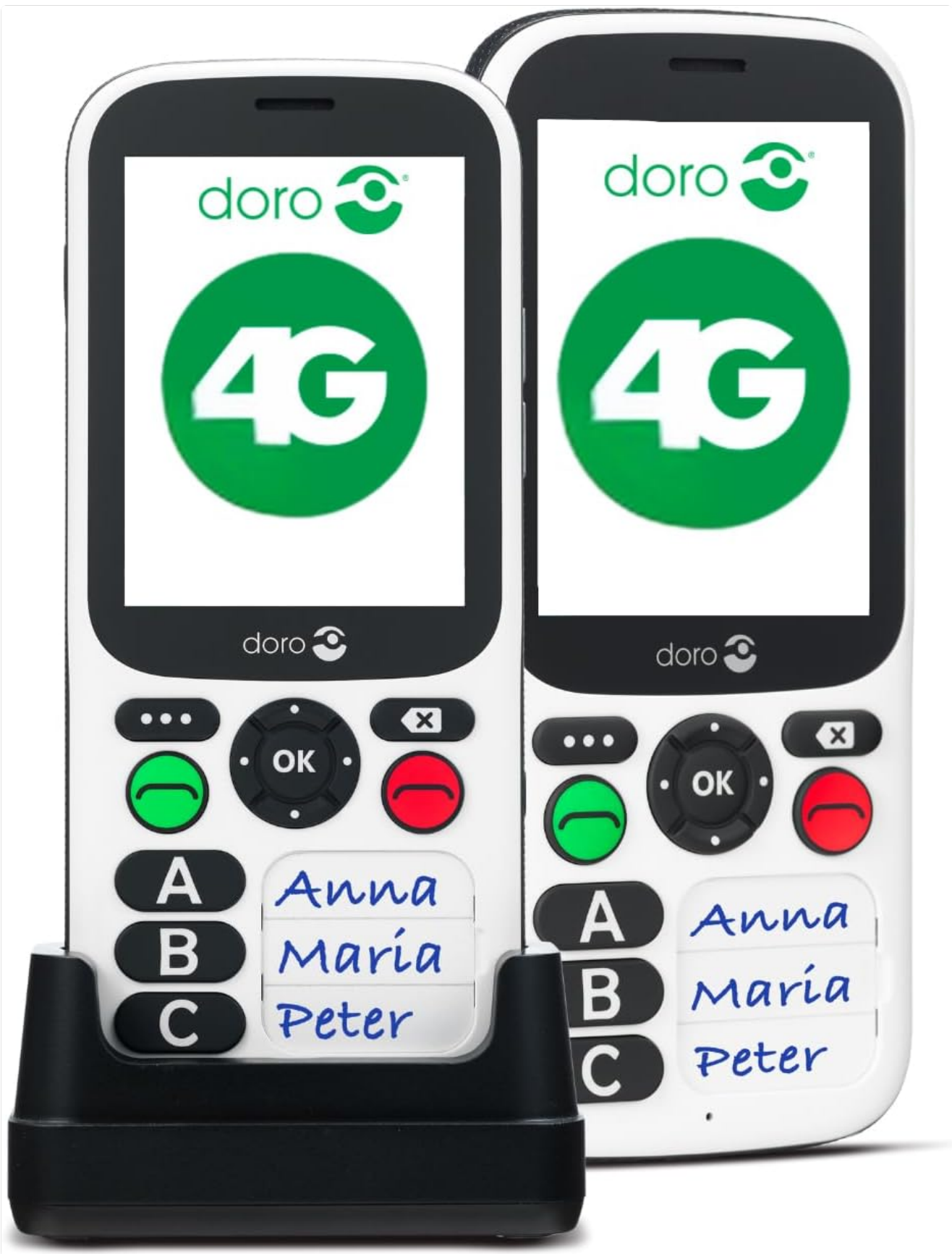
Image: The Doro 780X mobile phone shown with its included charging cradle.