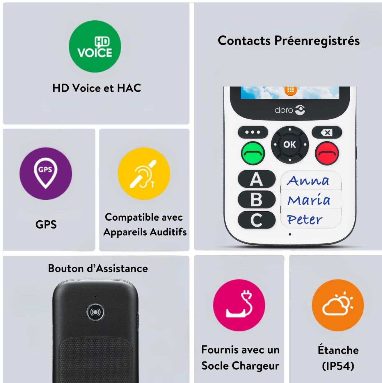
Image: The Doro 780X phone screen showing a clear display, suitable for reading text messages.

Text messages are displayed on the large screen for easy readability. You can reply to messages using the simplified keyboard.