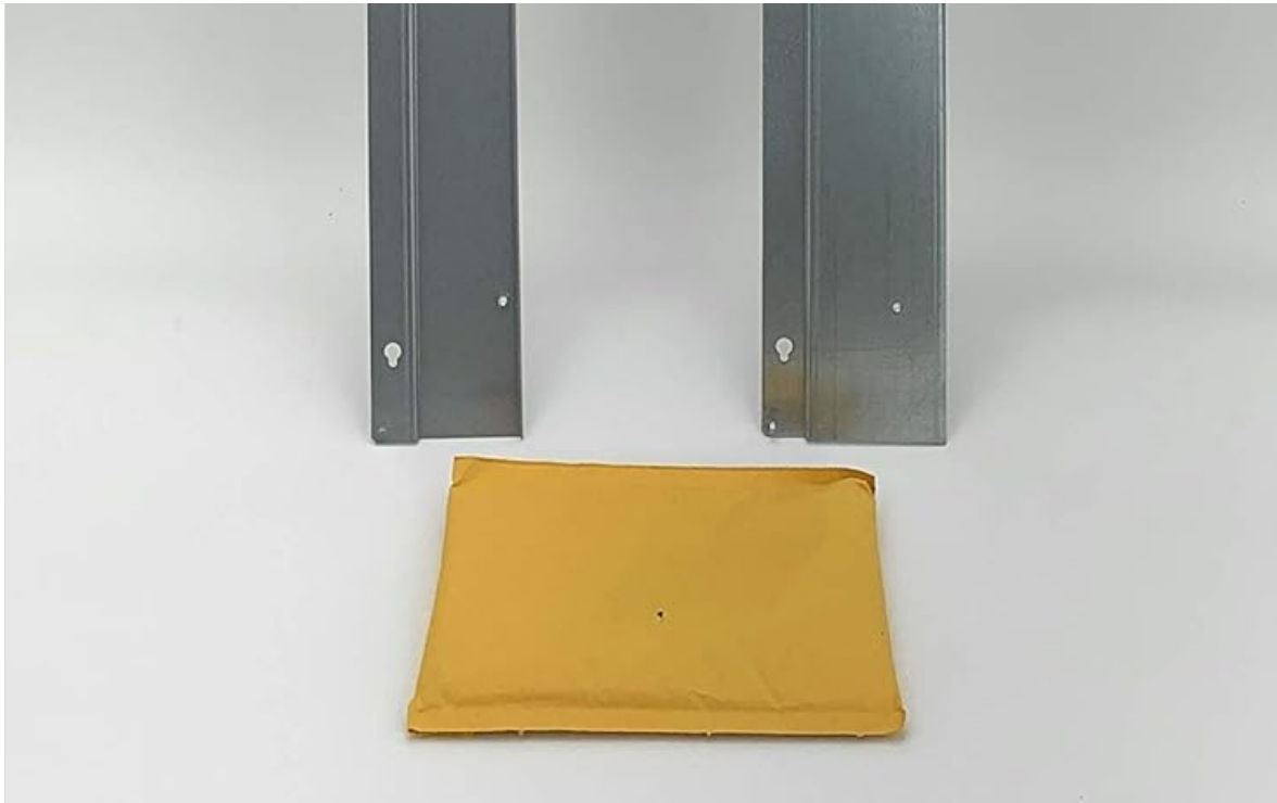
Figure 3: Mounting rails provided for securing the enclosure to a wall.