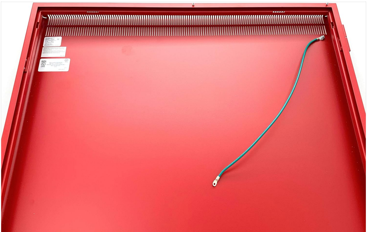
Figure 2: Close-up internal view highlighting the green grounding wire, which must be properly connected during installation for electrical safety.