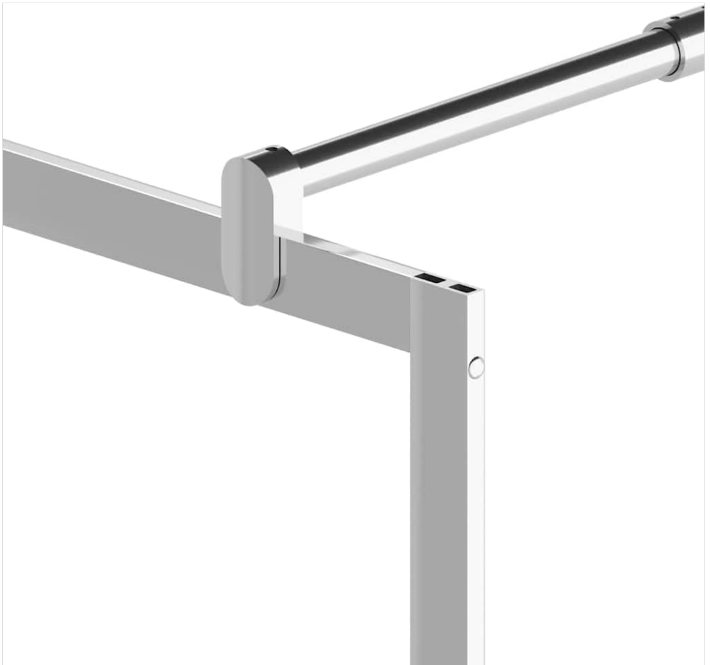
Image: Detail of the top corner showing the connection point for the flexible supporting bar to the glass panel frame.