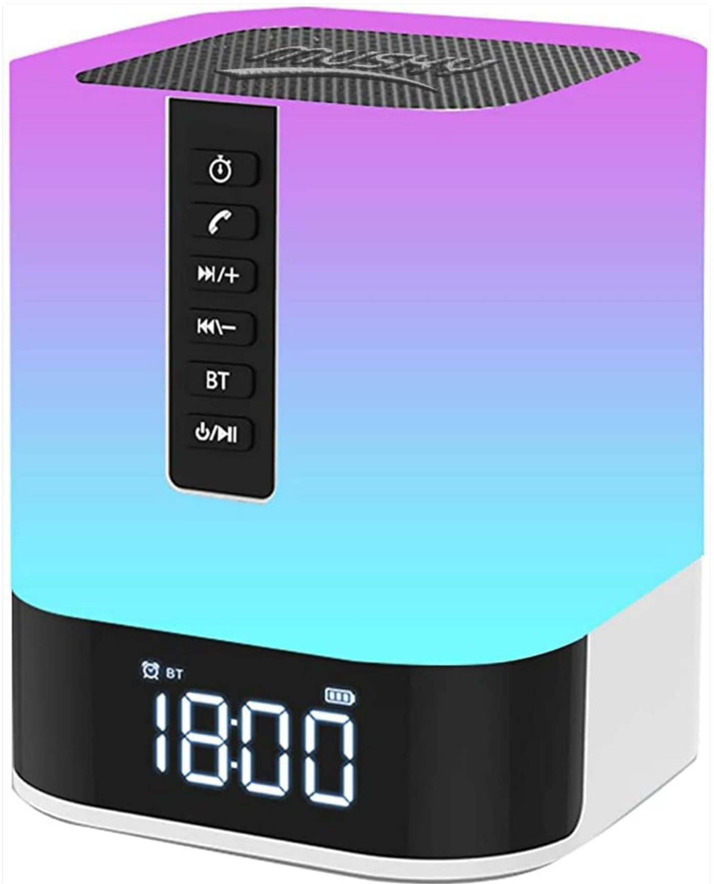
Figure 1: Front view of the Aisuo 5-in-1 LED Desk Lamp, showcasing the digital time display and the side control panel with buttons for alarm, call, track control, Bluetooth, and power/mode.