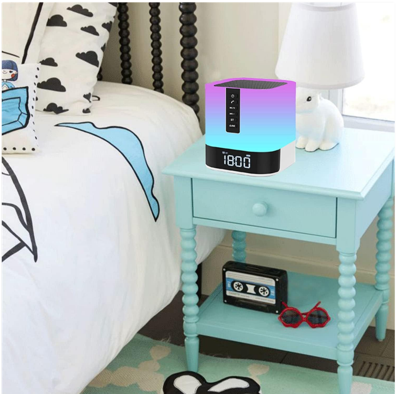
Figure 3: The Aisuo lamp showcasing its ability to display a wide range of colors, illustrating the customizable lighting feature.