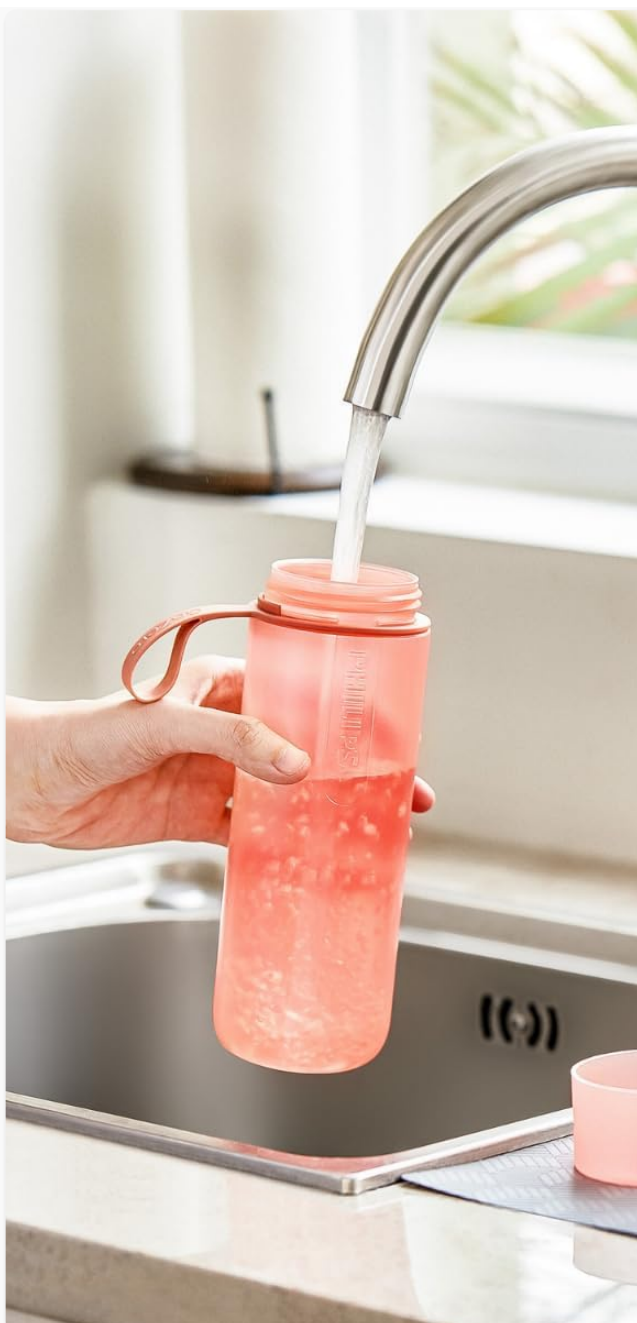
Image: A person filling the PHILIPS GoZero Active Water Bottle directly from a kitchen tap, demonstrating ease of use.

Enjoy clean drinking water wherever you go