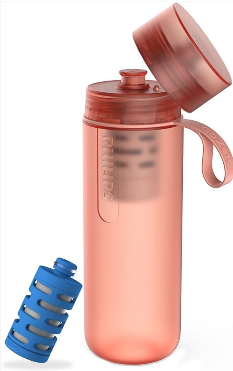
Image: PHILIPS GoZero Active Water Bottle in red with a separate blue Fitness filter cartridge.

The bottle is lightweight and designed for active use, making it suitable for outdoor sports and daily hydration. It features a dust-proof cap and a leak-proof design.