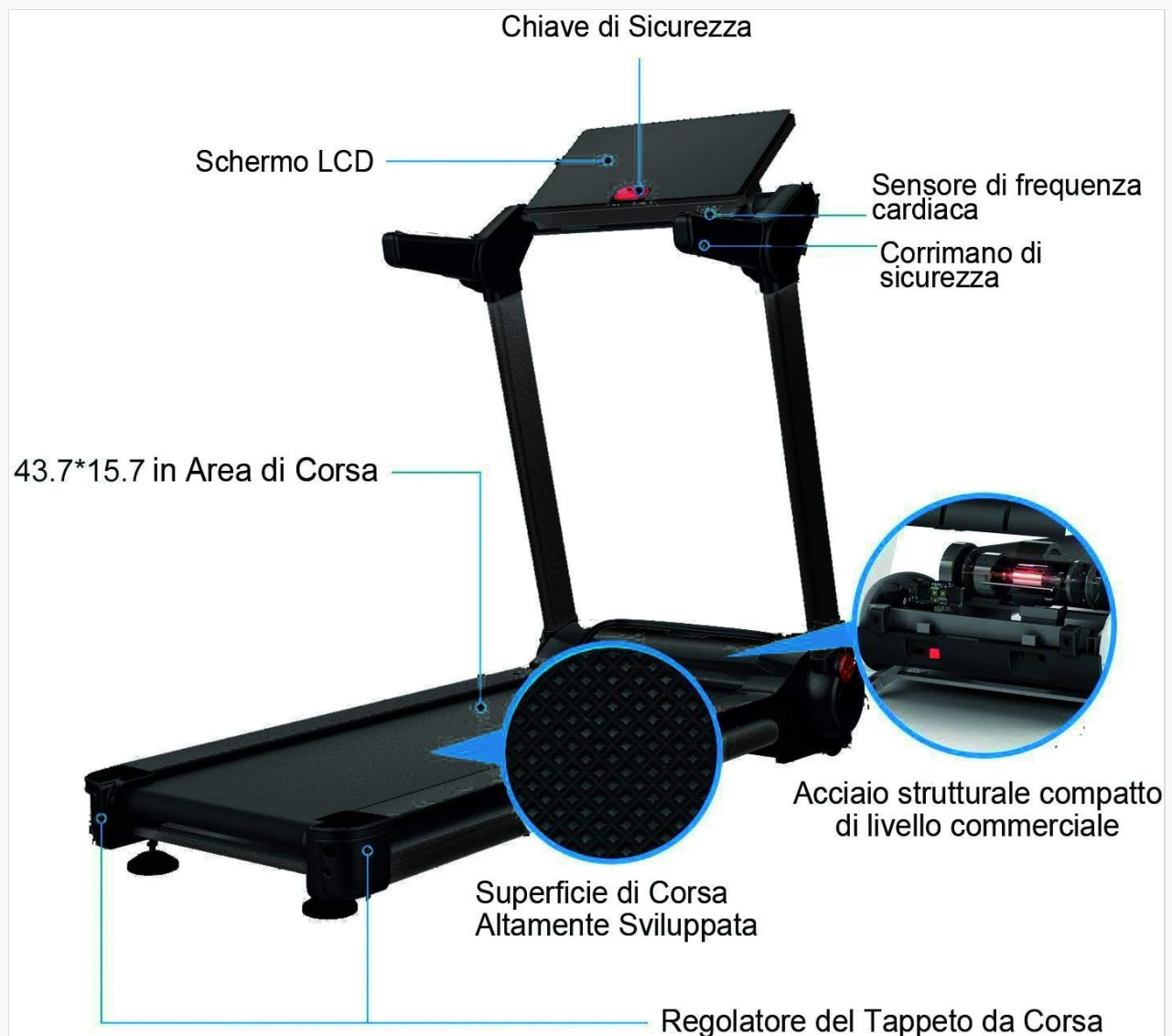
Image: Close-up of the treadmill's control panel, featuring a 6-window LED display showing speed, incline, time, distance, calories, and heart rate. Hand pulse sensors are visible on the handlebars.