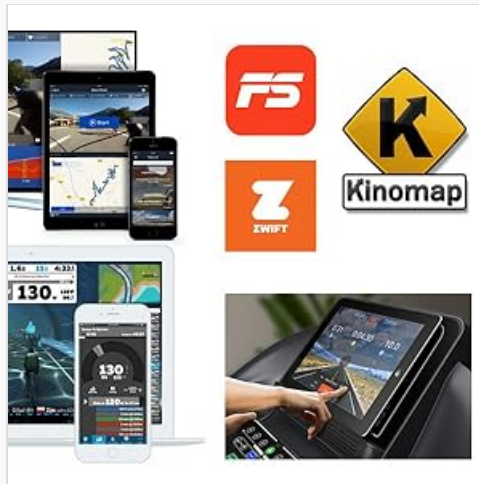
Image: A collage of various fitness applications (e.g., Kinomap, Zwift) displayed on different mobile devices, illustrating the treadmill's compatibility with external fitness apps via Bluetooth.