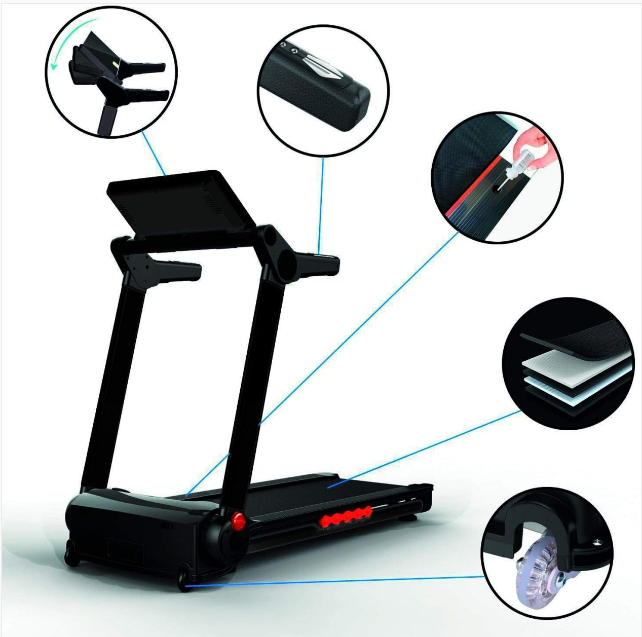
Image: Illustration demonstrating the treadmill's automatic incline feature, adjustable from 0 to 15 degrees, allowing for varied