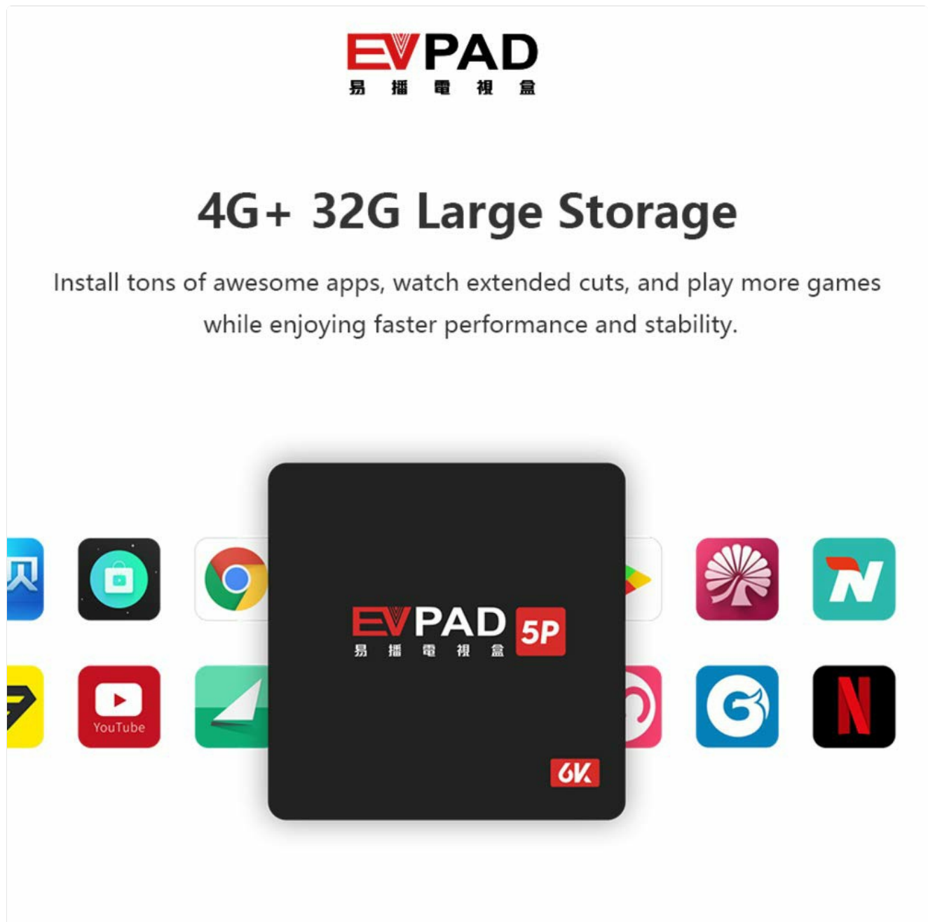
Image 4.2: The EVPAD EVBOX 5P displaying a selection of available applications.

With 4GB RAM and 32GB ROM, the EVBOX 5P provides ample storage for applications and media. You can install various apps from the integrated app store or other compatible sources to customize your entertainment experience.