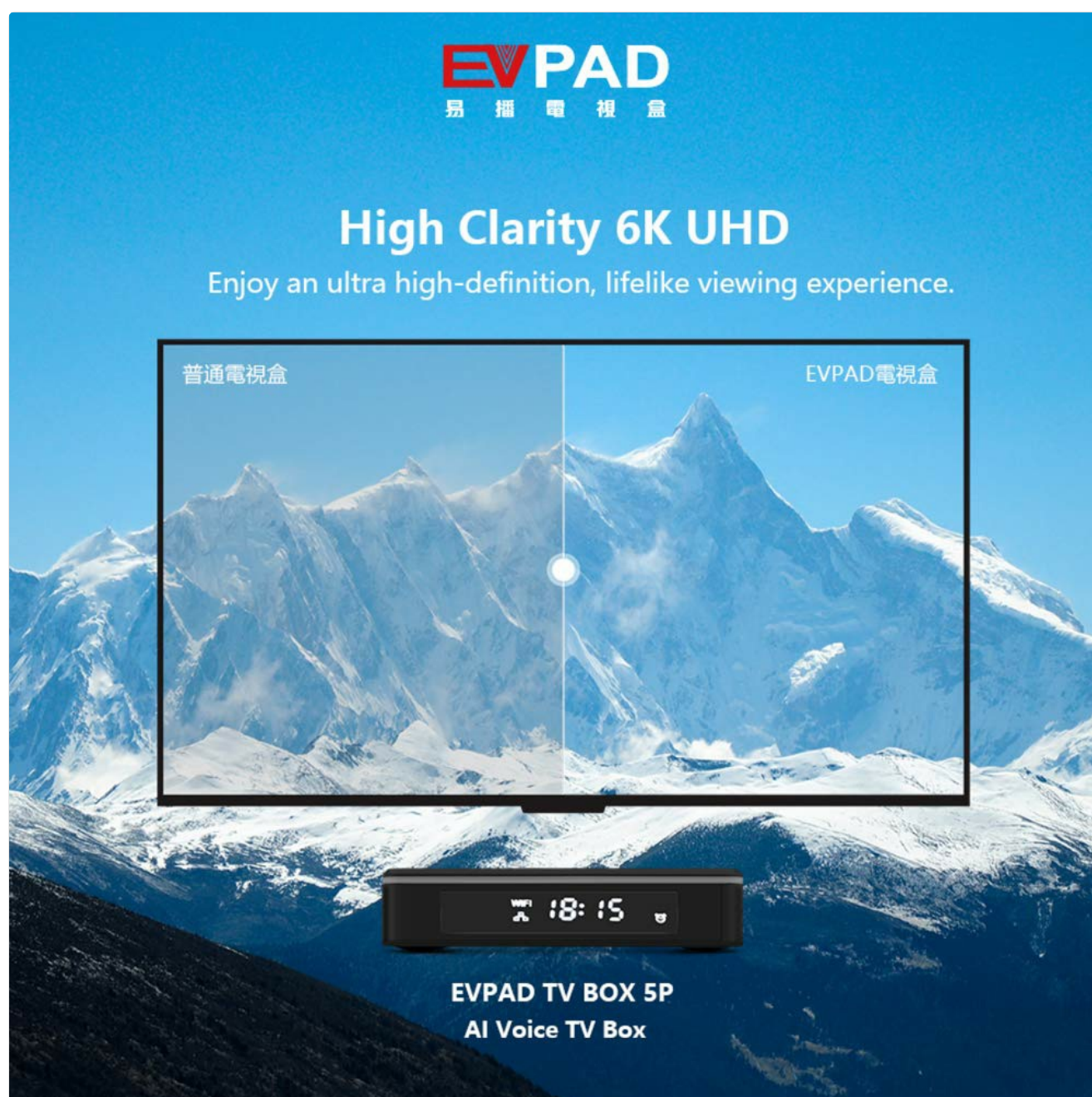
Image 4.1: Visual representation of 6K UHD clarity compared to standard definition.

Experience high-clarity visuals with 6K UHD video decoding capabilities. The powerful Cortex A53 64-bit processor ensures smooth playback of ultra-high-definition content.