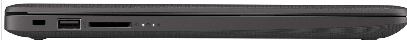
Image: Right side of the laptop, illustrating the USB port and media card reader.