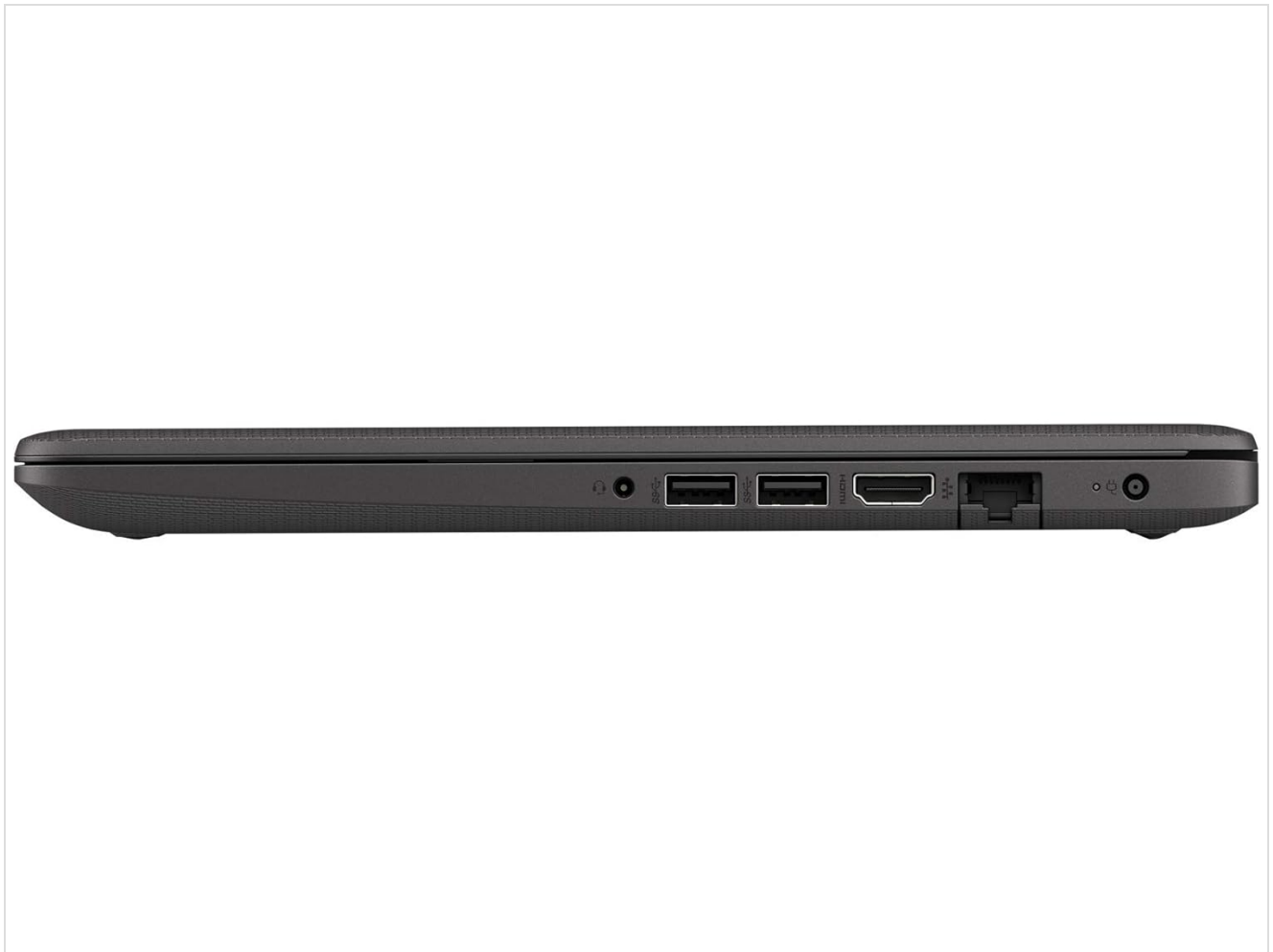
Image: Left side of the laptop, illustrating the various ports and connectors.