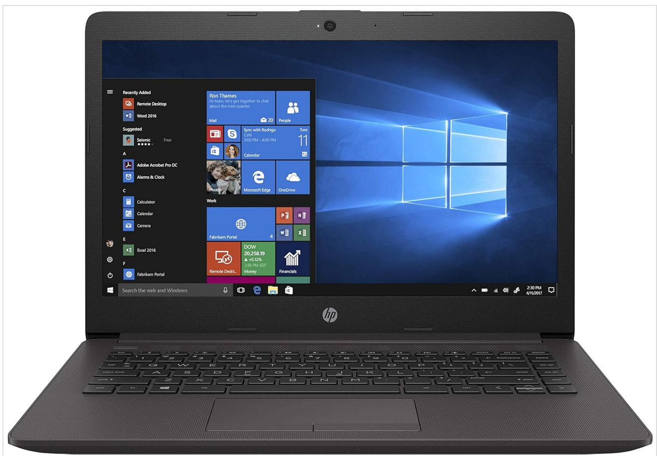
Image: Front view of the HP 240 G7 Laptop with the screen displaying the Windows operating system desktop.

This manual provides essential information for setting up, operating, maintaining, and troubleshooting your HP 240 G7 Laptop, Model 1S5F1PA#ACJ. Please read this guide thoroughly to ensure proper use and to maximize the lifespan of your device.