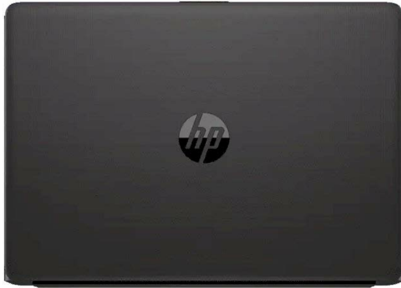
Image: Top-down view of the laptop with the lid closed, showing the HP logo.