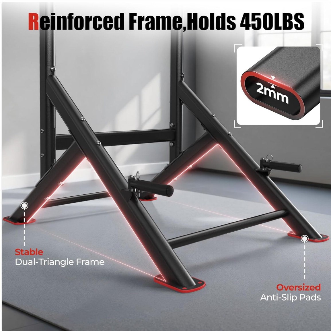
Image 2: Reinforced Frame and Anti-Slip Pads. This image highlights the 2mm thick steel tubing, stable dual-triangle frame, and oversized anti-slip pads at the base, contributing to the power tower's stability.