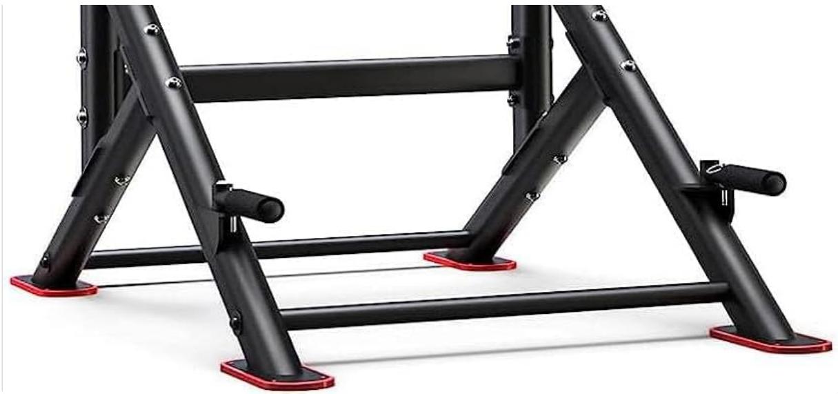
Image 1: Sportsroyals Power Tower FB-20YTXS01. This image shows the fully assembled power tower, including the pull-up bar, dip handles, and backrest.