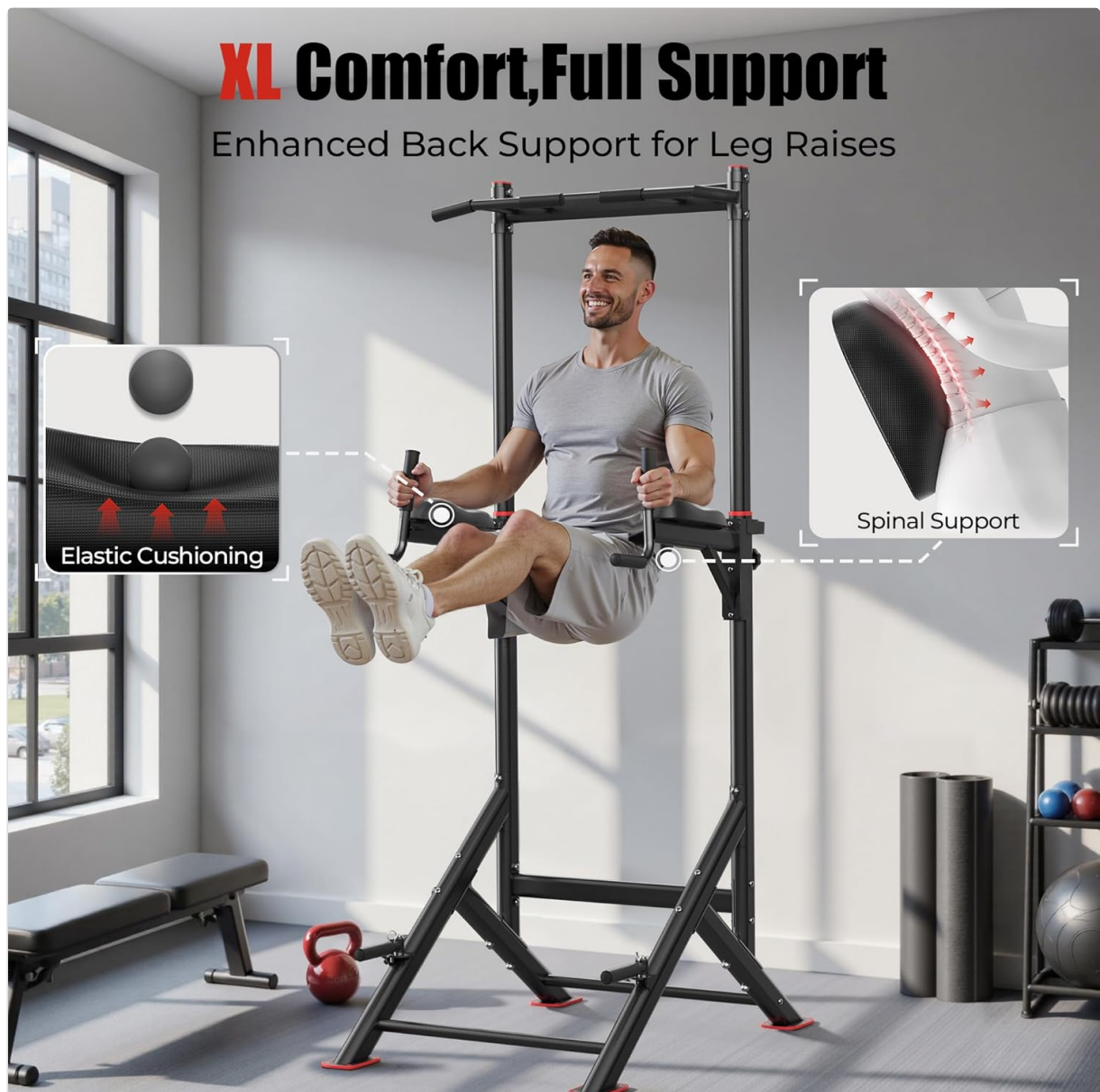
Image 6: Exercise Demonstrations. This image displays various exercises that can be performed on the power tower,