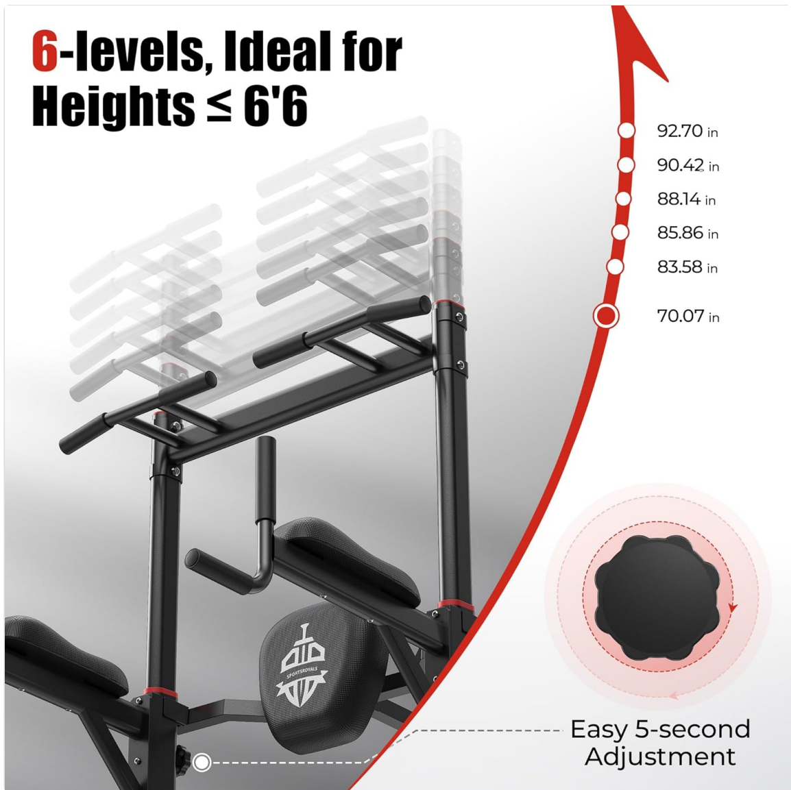
Image 5: 6-Level Height Adjustment. This image demonstrates the power tower's height adjustment feature, showing how the pull-up bar can be set to six different levels, ideal for various user heights.