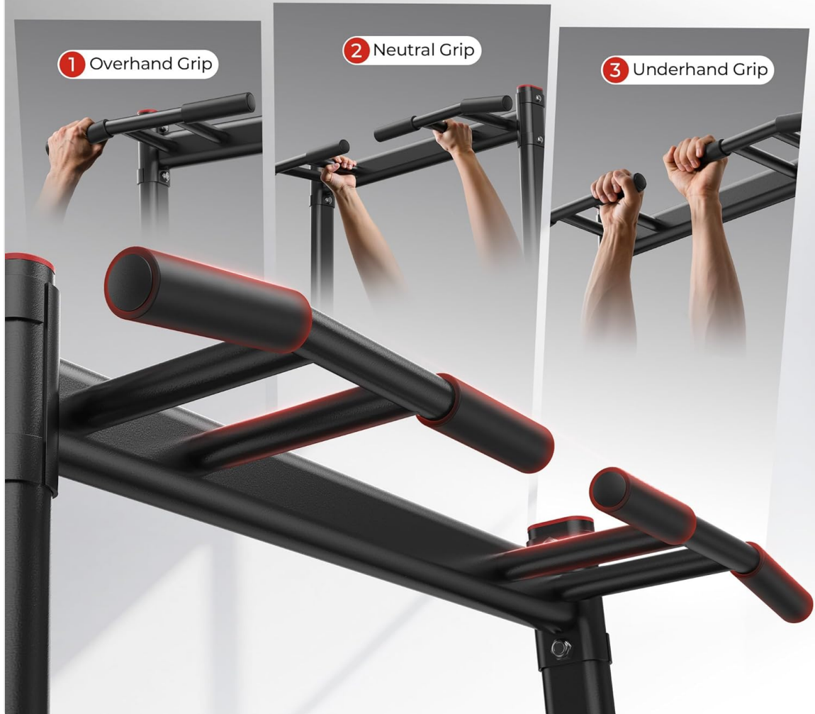
Image 4: Multiple Grip Options. This image illustrates the three primary grip positions available on the pull-up bar: overhand, neutral, and underhand, allowing for varied muscle activation.