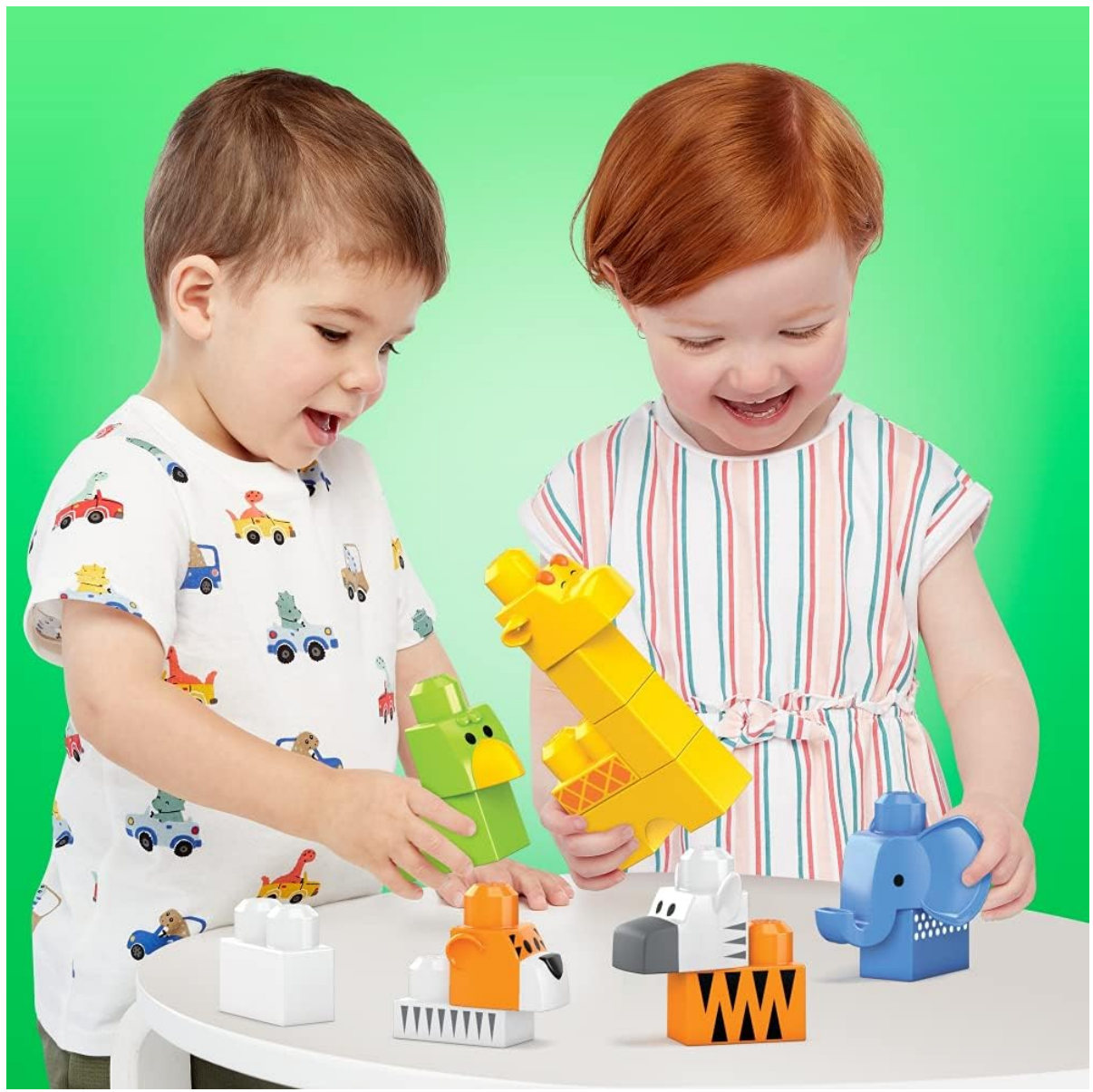
Image: Children engaging in play with the assembled Mega Bloks Safari Animals.