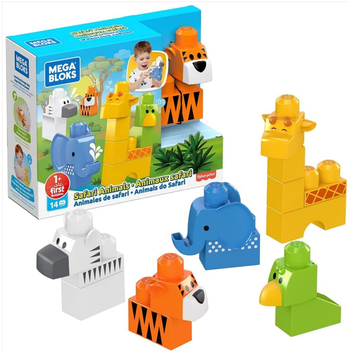
Image: The Mega Bloks Safari Animals set, showing the packaging and the five completed animal figures.