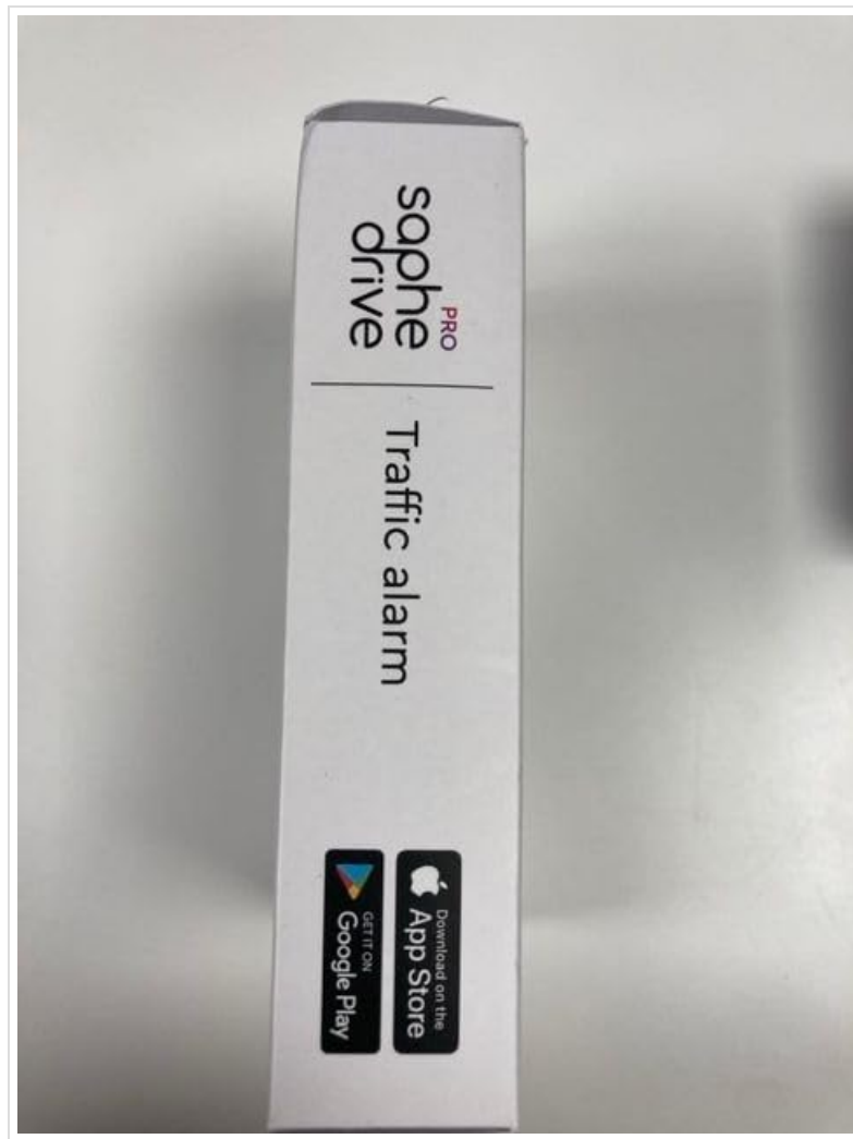
The side of the Saphe Drive Pro packaging, indicating it functions as a 'Traffic alarm' and shows icons for Google Play and App Store.