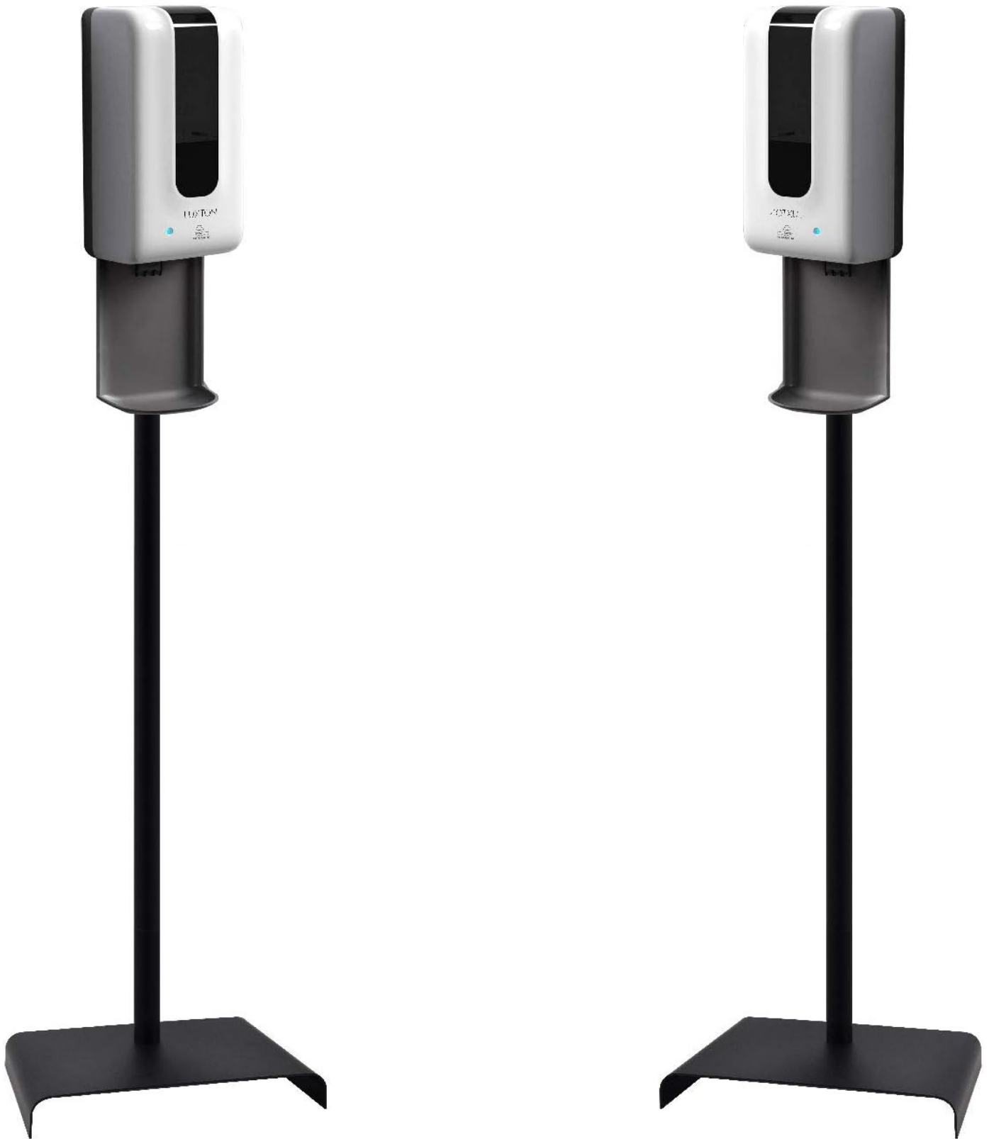
Image: The Luxton Home Automatic Hand Sanitizer Dispenser with Stand, showcasing its sleek design and freestanding capability.