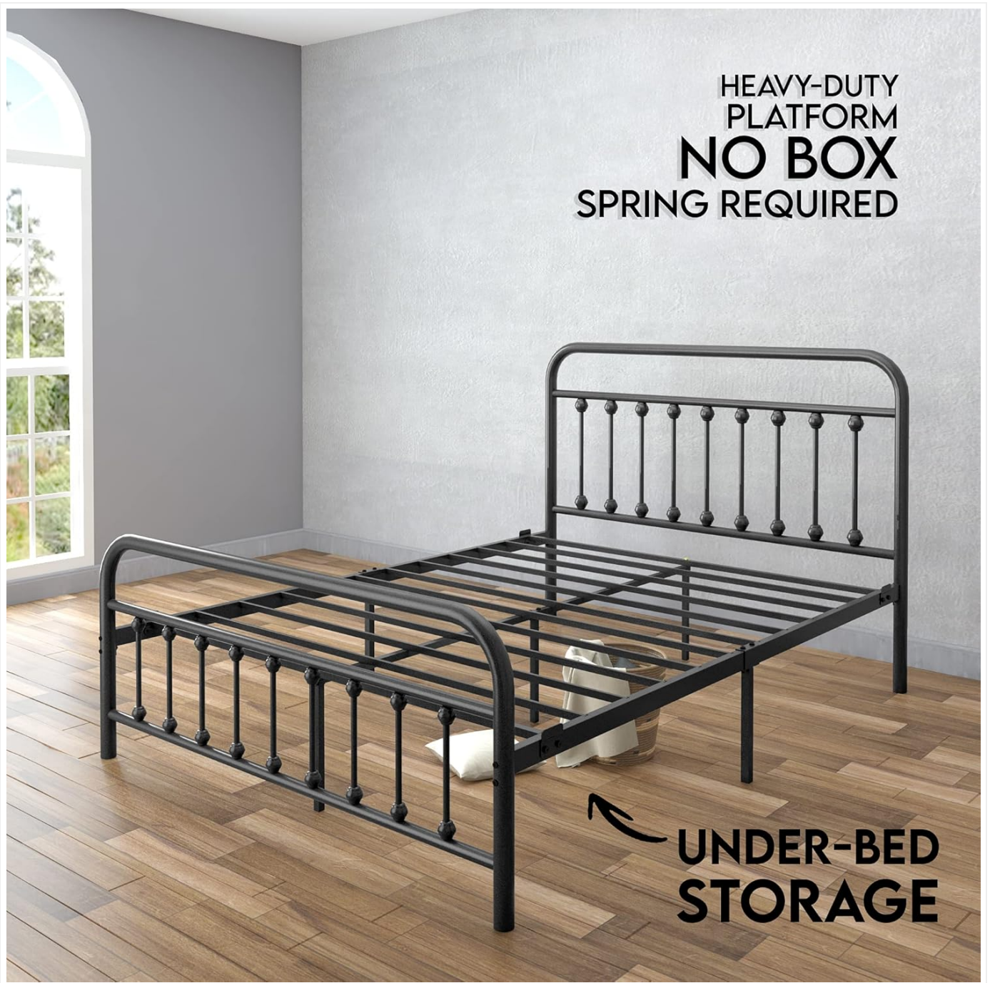
Figure 3: Under-bed storage area

HEAVY-DUTY PLATFORM NO BOX SPRING REQUIRED