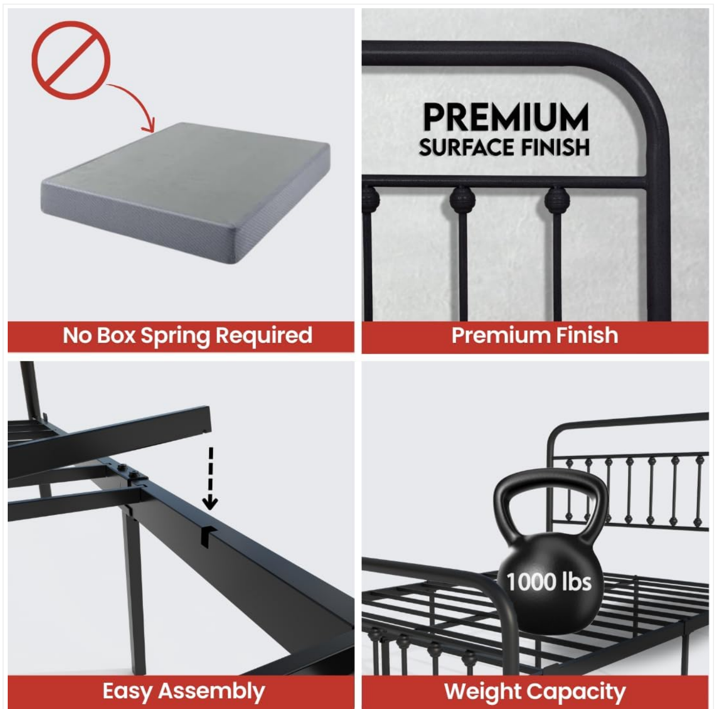
Figure 2: Key features including Easy Assembly and Weight Capacity