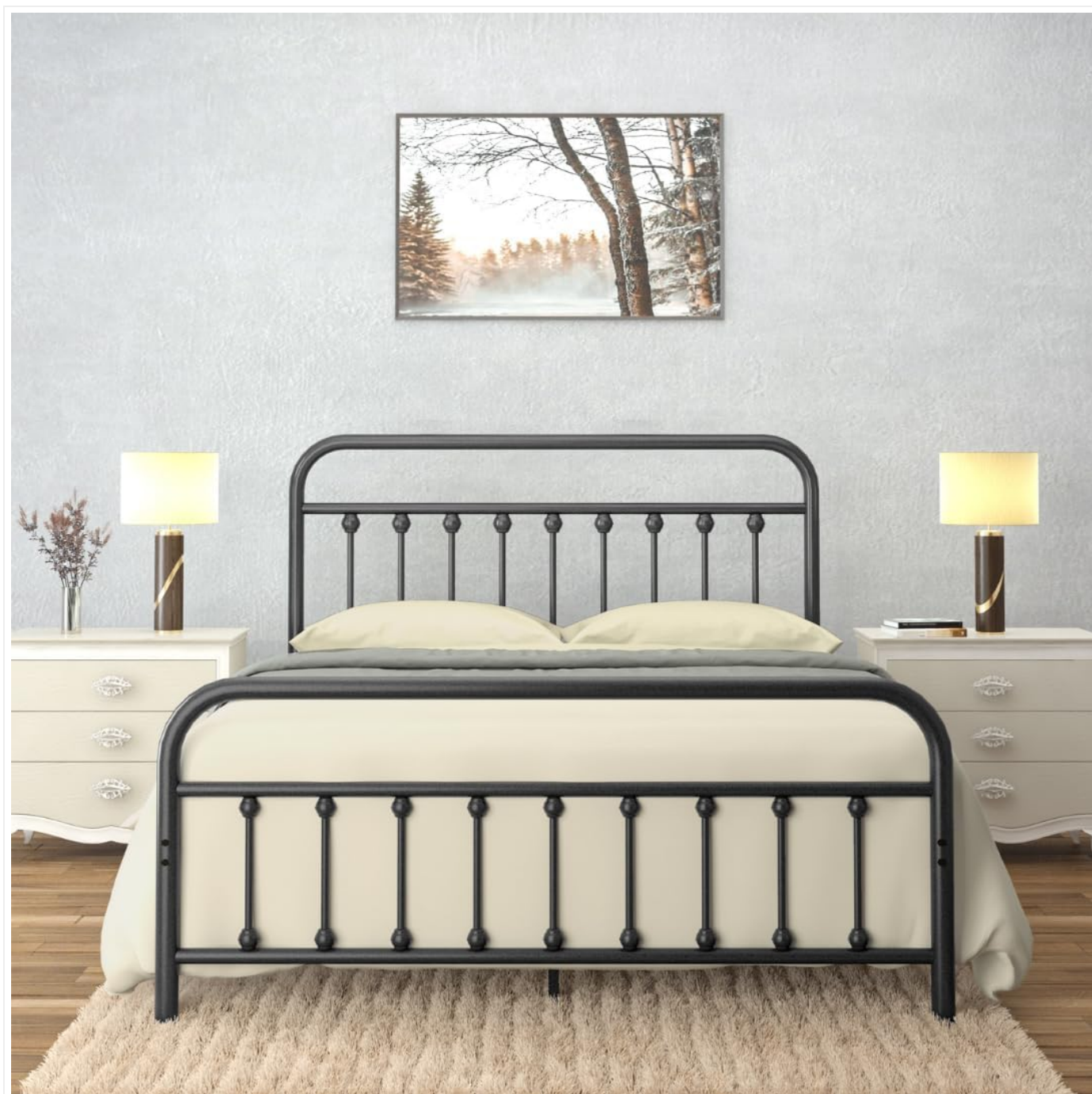
Figure 1: Assembled Queen Metal Bed Frame

The Golden Gate Beds Queen Metal Bed Frame features a Victorian vintage style with a wrought iron headboard and footboard, designed for use without a box spring. It offers sturdy support for your mattress and includes under-bed storage space.