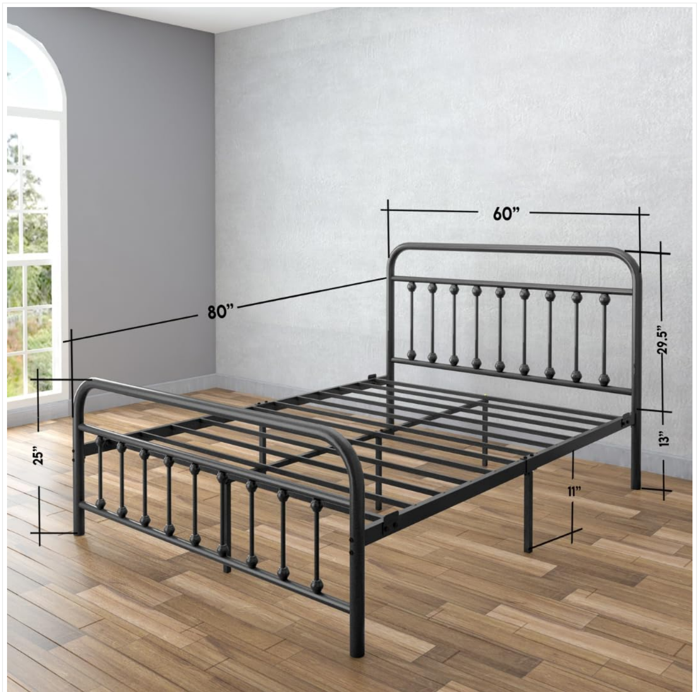
Figure 5: Product Dimensions