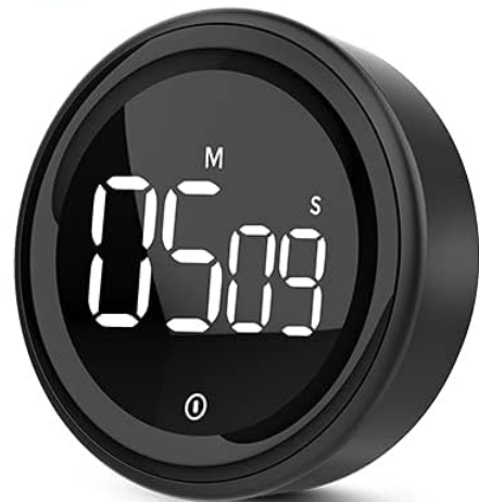
Image: The timer demonstrating its count-up function for exercise and count-down function for a facial routine.