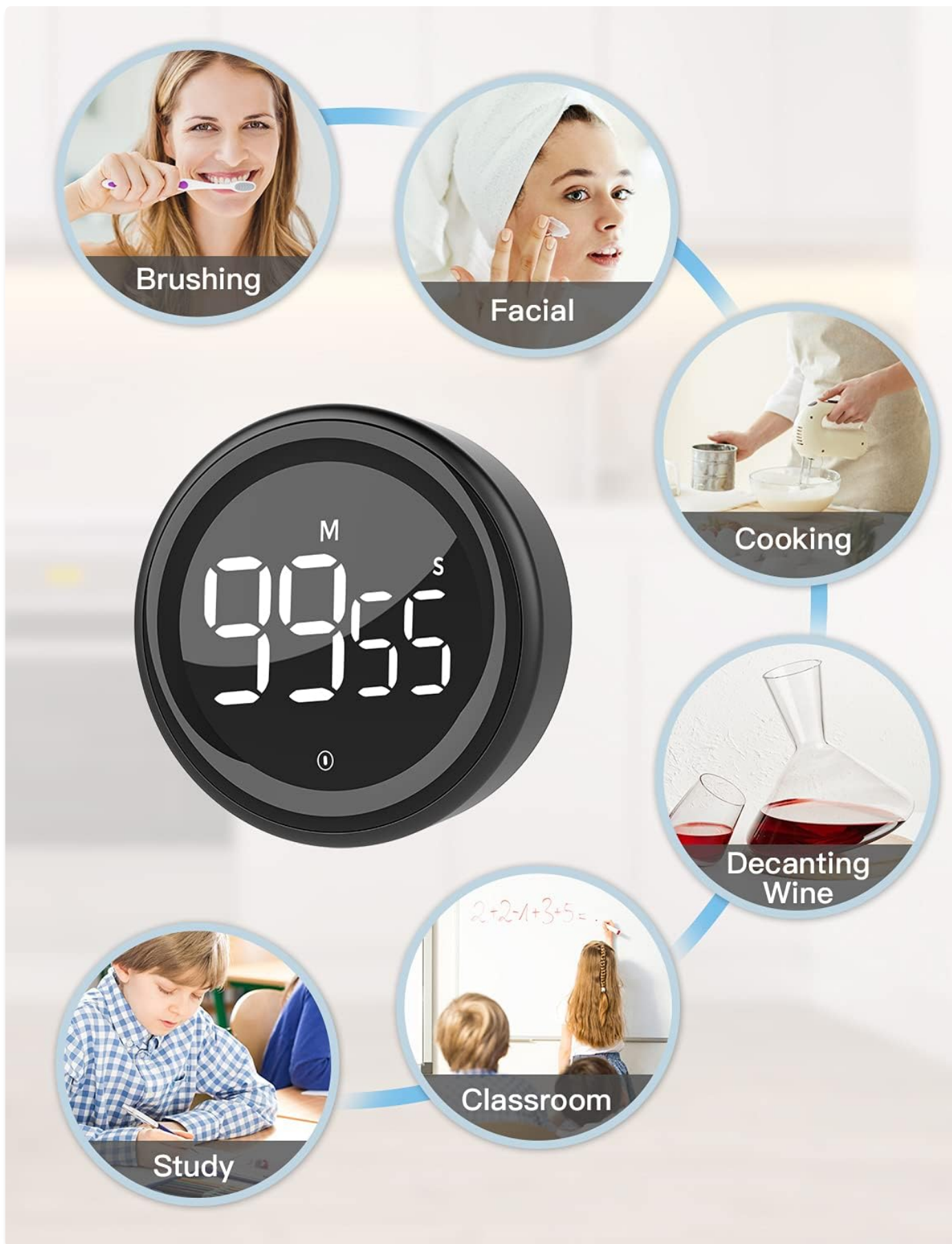
Image: The LIORQUE Digital Kitchen Timer shown in various usage scenarios, highlighting its versatility for daily tasks.