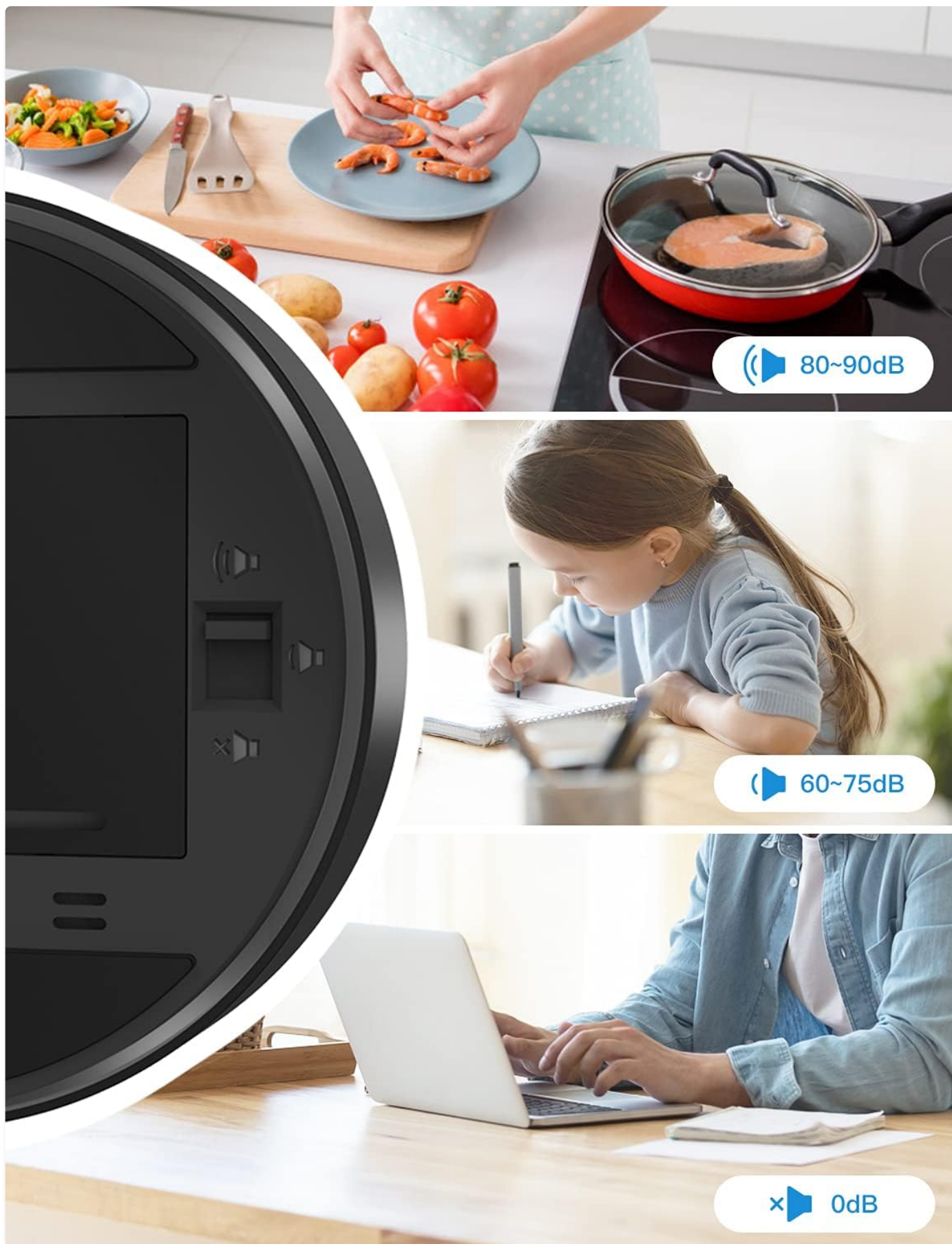
Image: Illustration of the three volume settings and their recommended uses, from loud for cooking to silent for quiet study or office work.