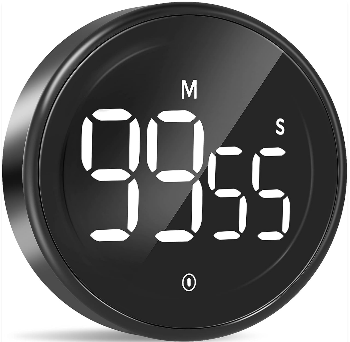
Image: Front view of the LIORQUE Digital Kitchen Timer, showcasing its large, clear LED display.

The LIORQUE Digital Kitchen Timer features a sleek, circular design with a large central LED display. The outer ring serves as the primary control for setting time. On the back, you will find the battery compartment, a volume switch, and a brightness mode switch, along with powerful magnets for convenient placement.