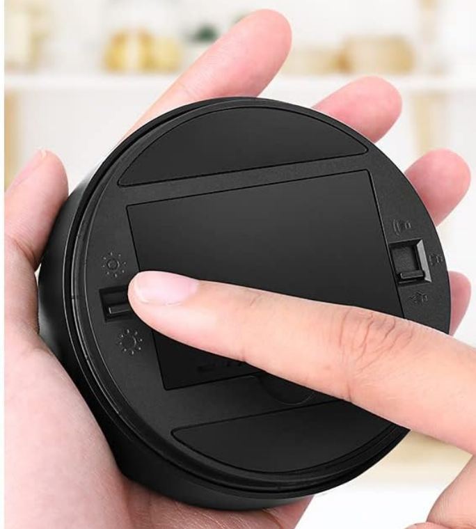
Image: Visual representation of the Constant Light mode, where the display remains bright, and the Energy Efficient mode, where the display dims and turns off to save battery.