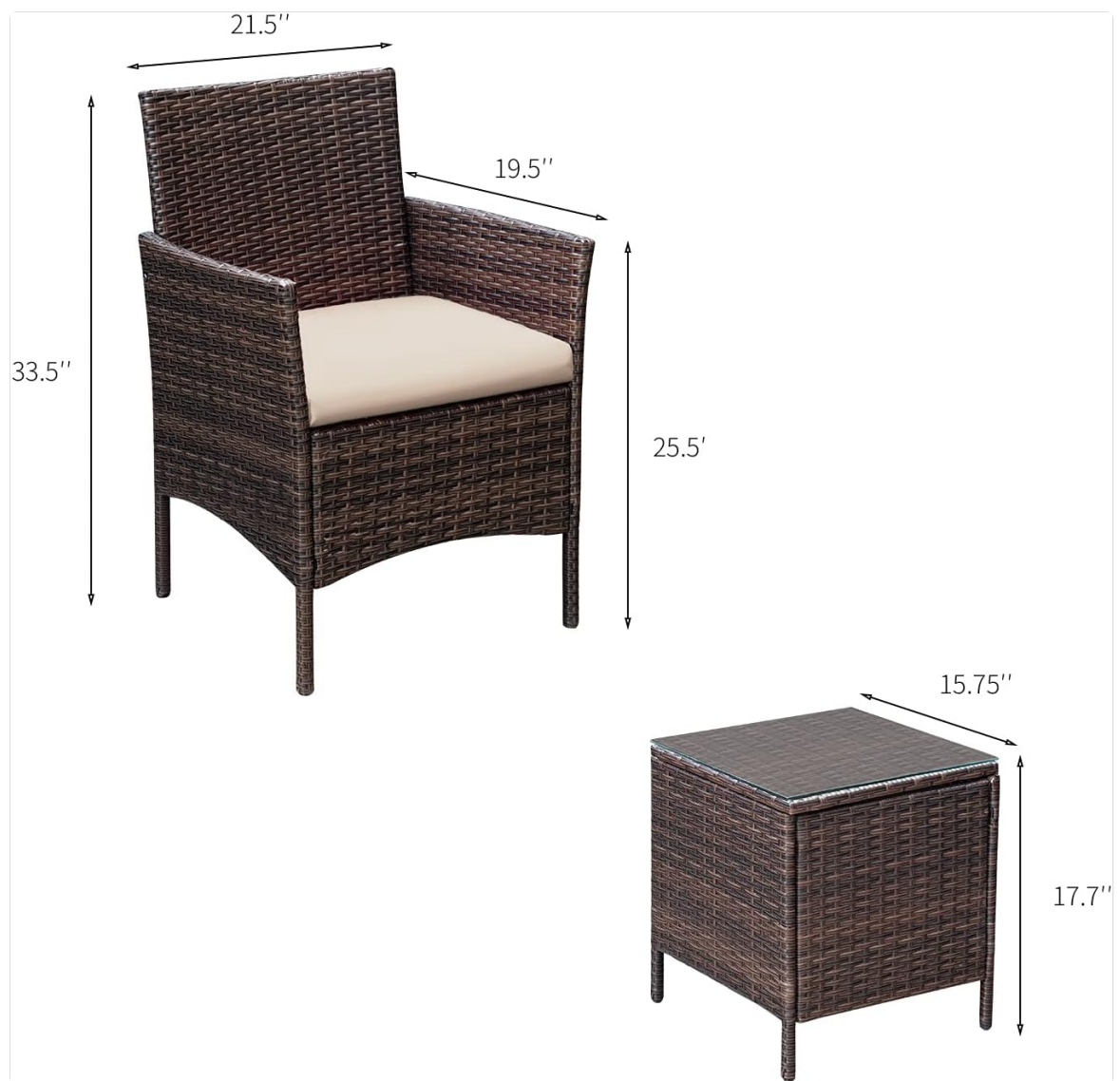
Figure 2: Dimensions of the Greesum patio chair and coffee table, useful for planning placement and assembly.