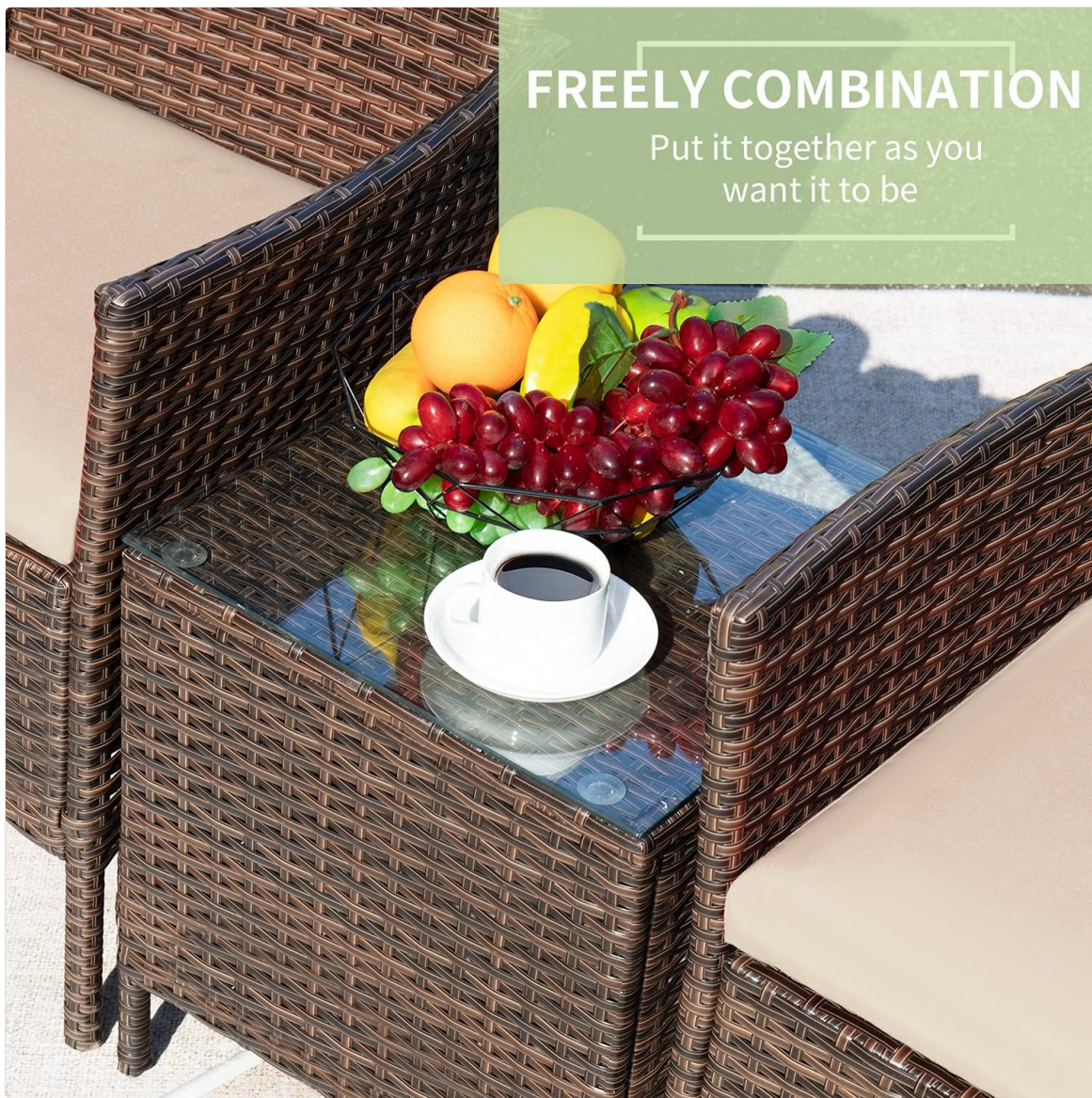
Figure 7: The patio set showcasing its flexible arrangement, allowing users to configure the chairs and table as desired for different social settings.

Your browser does not support the video tag.