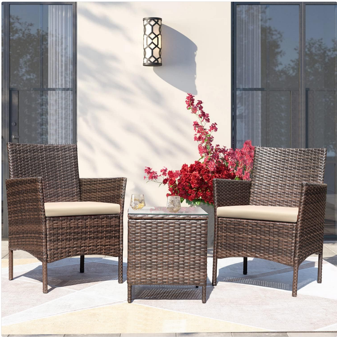
Figure 5: The patio set arranged on a modern patio, showcasing its aesthetic appeal and functional use in an outdoor environment.