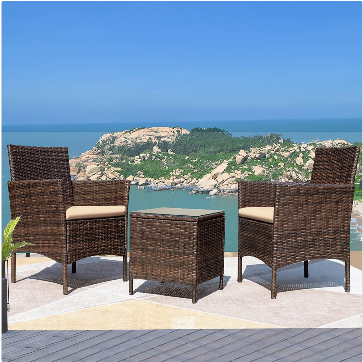
Figure 6: The furniture set positioned on a balcony with a picturesque ocean backdrop, illustrating its adaptability to various outdoor living areas.