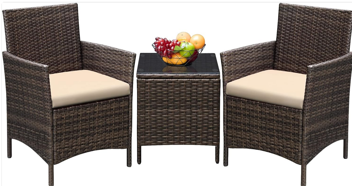
Figure 1: The Greesum 3 Pieces Patio Furniture Set, featuring two single chairs with beige cushions and a central glass-top coffee table.

The set features a modern design, is lightweight for easy relocation, and is constructed with anti-rust and anti-corrosion treated rattan wicker for extended service life. The soft cushions provide a comfortable seating experience.