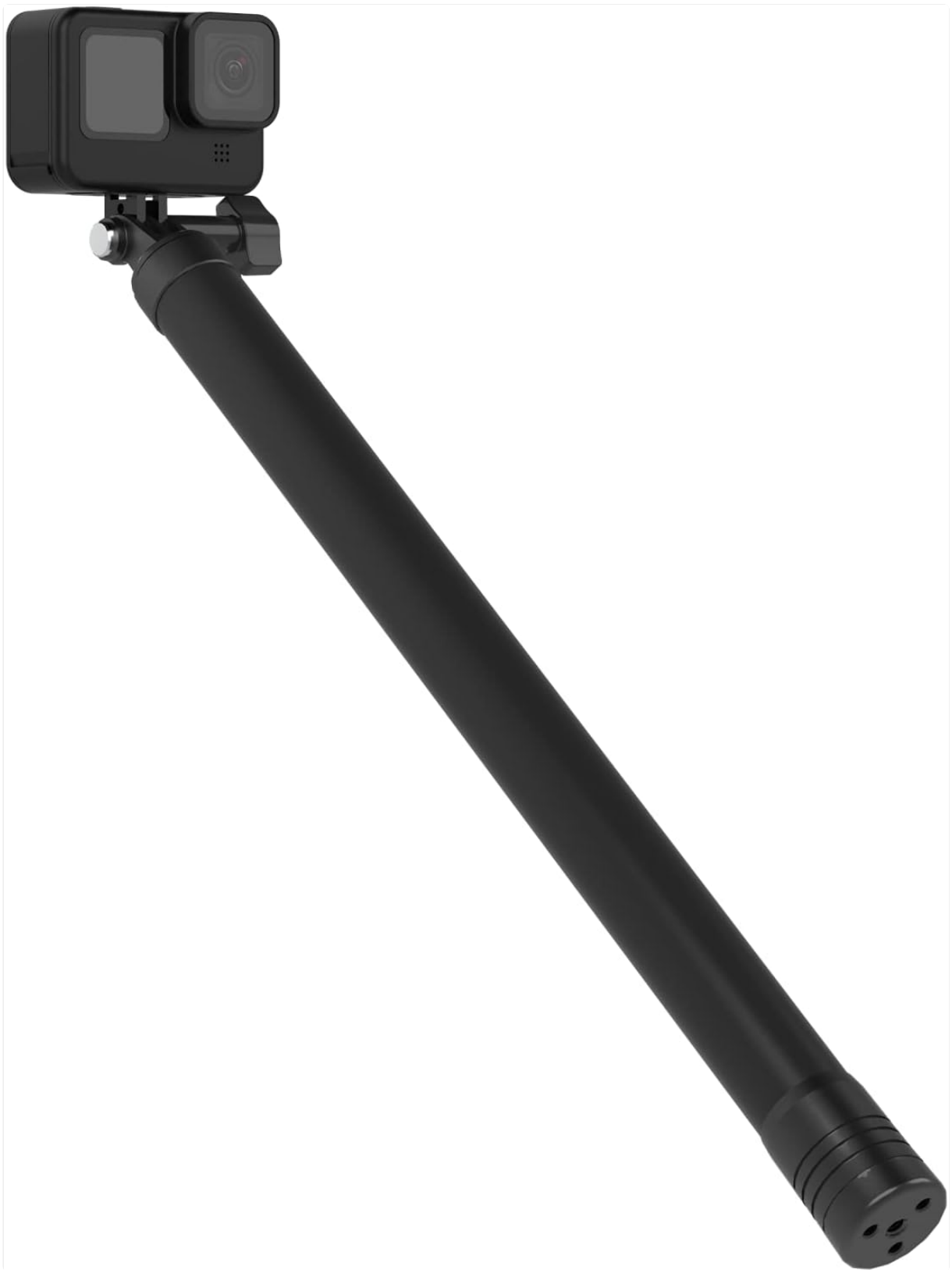
Image: A close-up showing an action camera properly mounted and secured to the selfie stick.