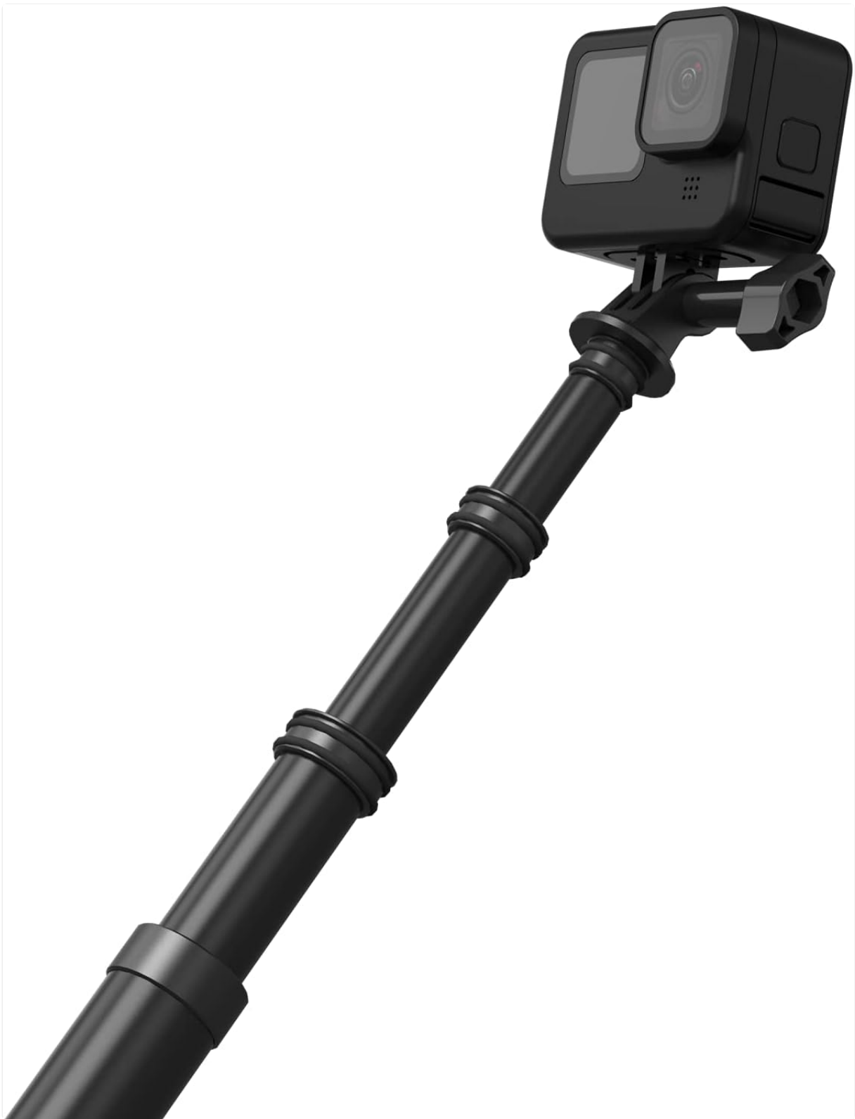
Image: The selfie stick in a partially extended configuration, demonstrating its adjustable nature.