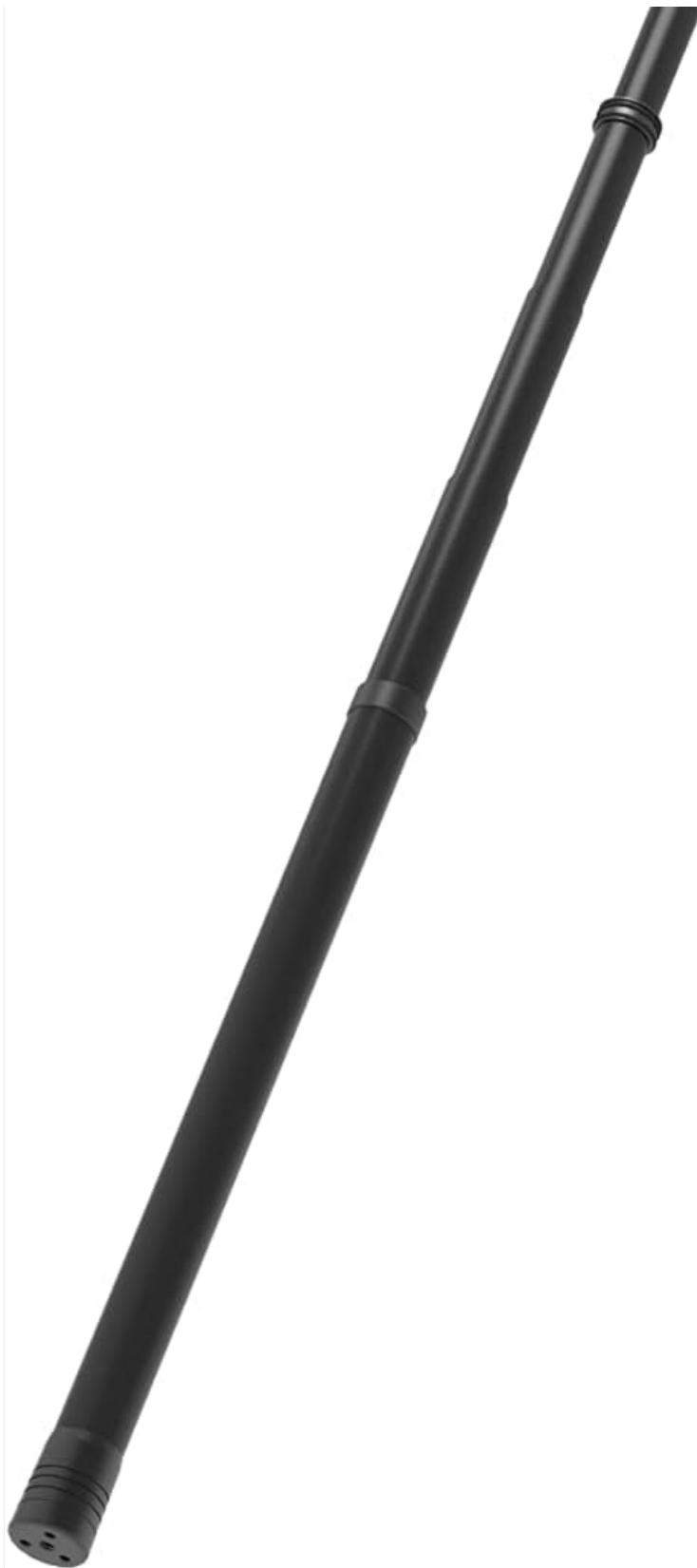
Image: The TELESIN 2.7M Ultra Long Carbon Fiber Selfie Stick shown fully extended with an action camera attached.