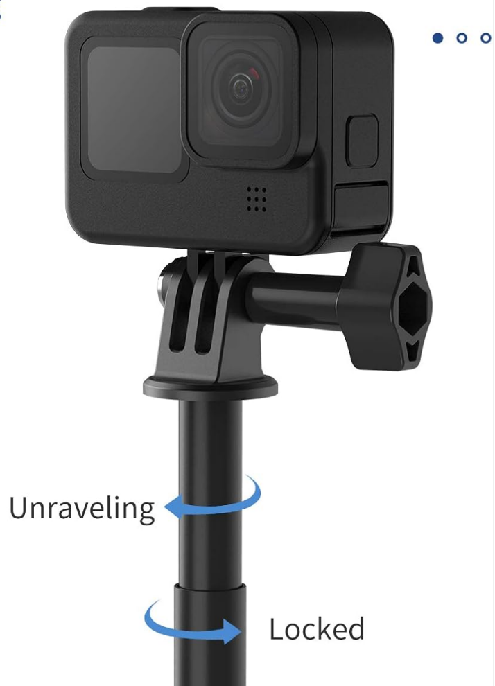
Image: A visual guide demonstrating the six adjustable lengths and the twist-to-lock/unlock mechanism of the selfie stick.

Action cameras and tabletop tripods are not included in this product.