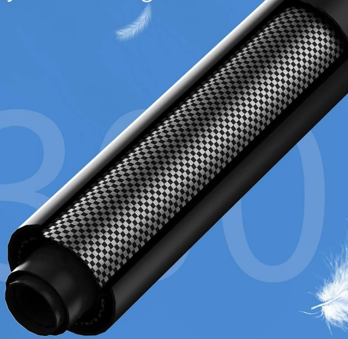
Image: A close-up view highlighting the carbon fiber construction, emphasizing its lightweight and strong properties.

– High-quality material guarantees stability and low weight