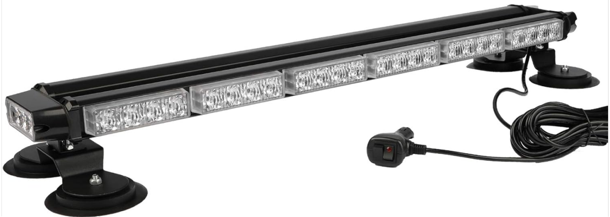
Figure 4: Super Visibility LED Arrangement