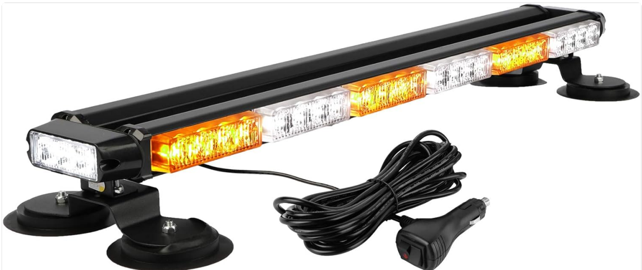
Figure 1: ASPL 29.5" 54 LED Strobe Light Bar (Amber/White)

The ASPL 29.5-inch 54 LED Strobe Light Bar is designed for enhanced visibility and safety in various vehicle applications. Featuring high-intensity amber and white LEDs, this light bar offers multiple flashing patterns and a durable, weather-resistant construction. It is suitable for emergency vehicles, construction vehicles, tow trucks, and other utility applications.