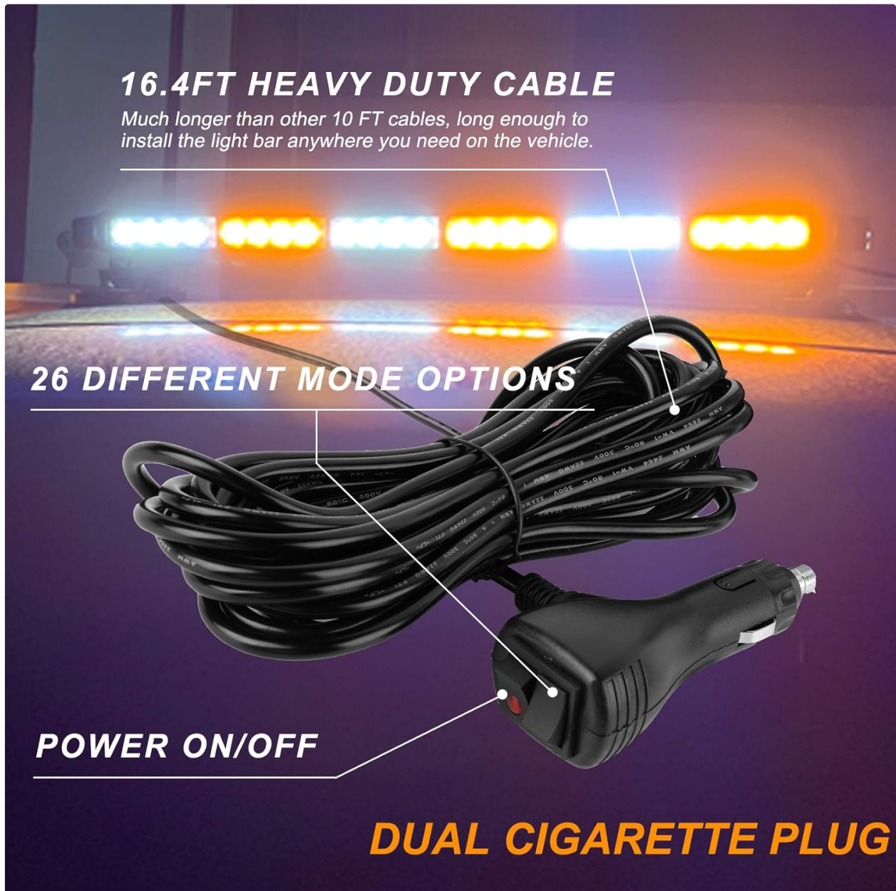
Figure 3: Power Cable and Dual Cigarette Lighter Plug