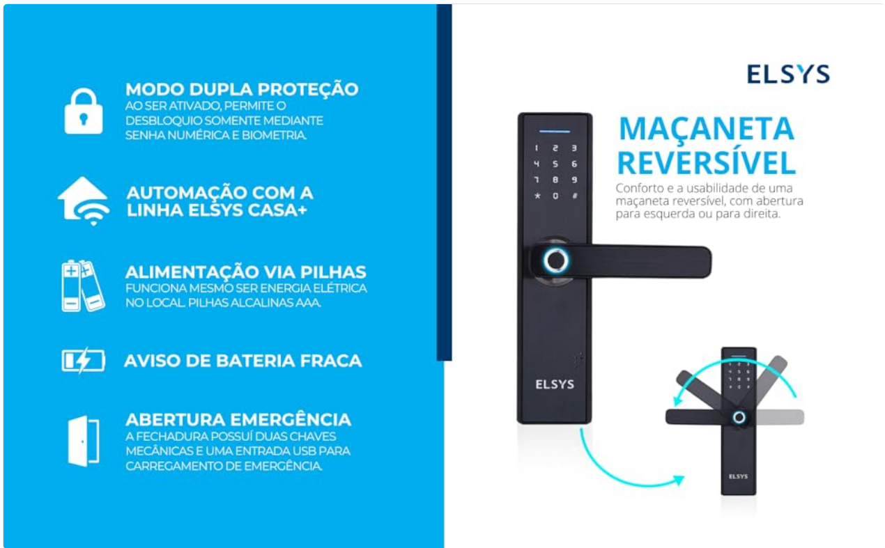
Image: Visual representation of the lock's primary features including biometric, numeric, and app access.