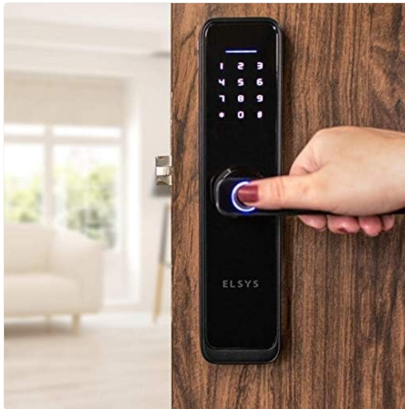
Image: Overview of the three primary methods to open the Elsys digital lock: via the Elsys Casa+ app, numeric password, or biometric fingerprint.