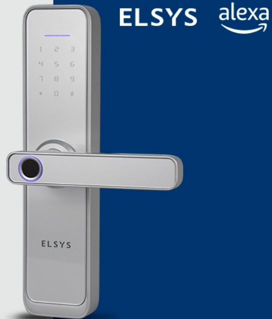
Image: The Elsys digital lock integrated with Alexa, allowing voice commands to open the door.

E ao tocar a campainha, receba suas visitas com comando de voz!