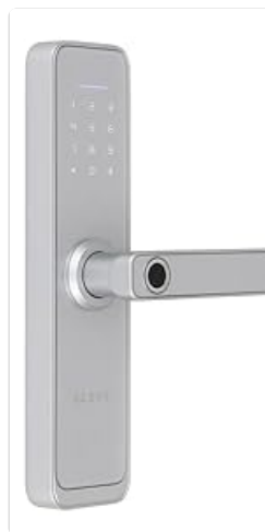
Image: Step-by-step guide for setting up voice commands with Alexa for your Elsys digital lock.