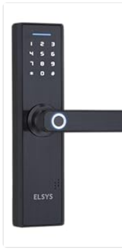
Image: Detailed dimensions of the Elsys ESF-DE4000B digital lock.