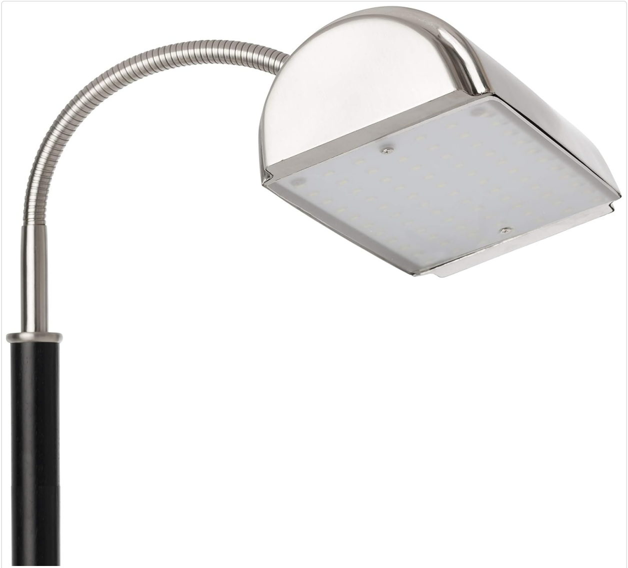
Figure 2: Lamp Head Assembly. This image displays the lamp head, featuring the flexible gooseneck and the integrated LED panel, ready for use.