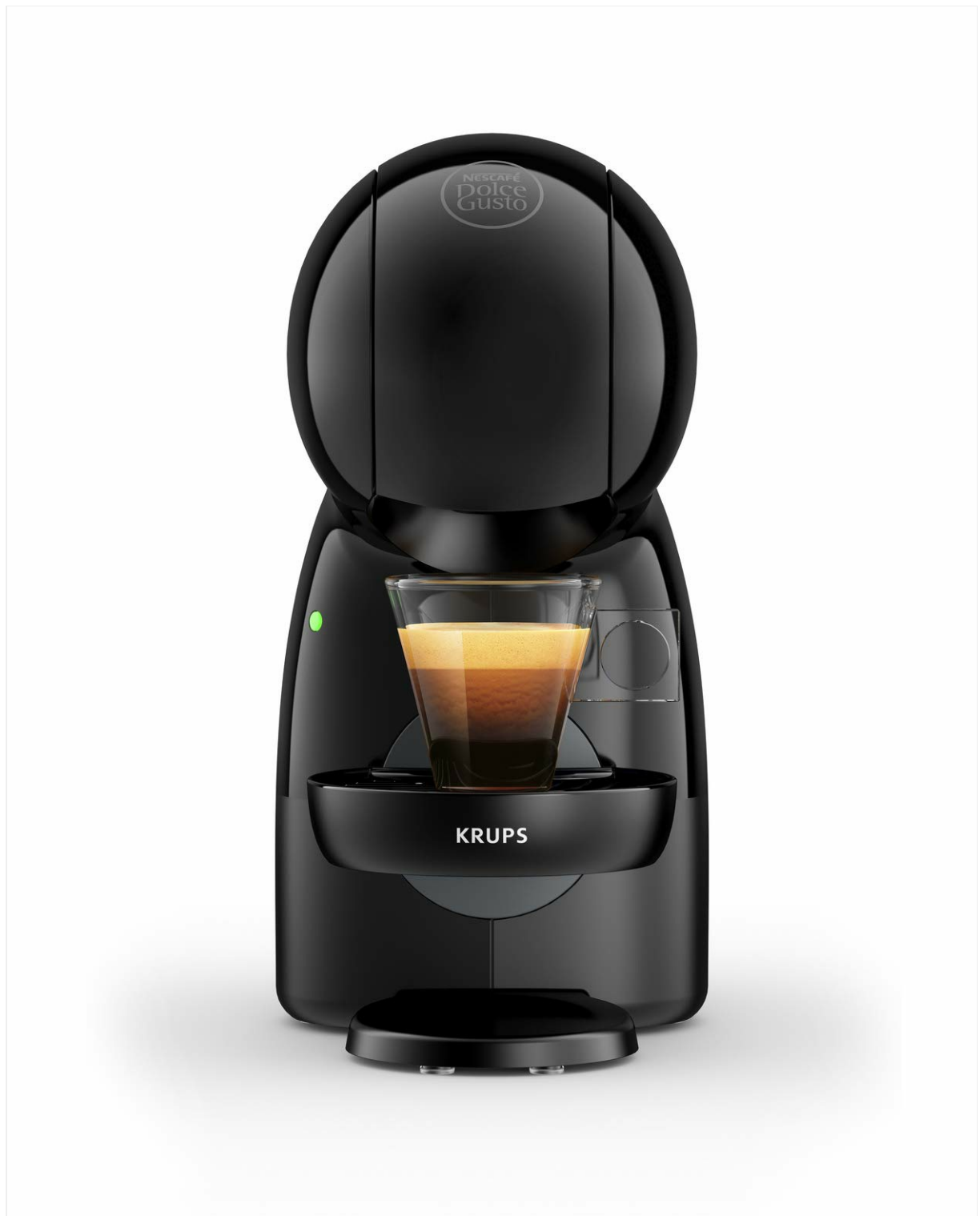
Figure 1: Overall view of the Krups Nescafé Dolce Gusto Piccolo XS coffee machine.