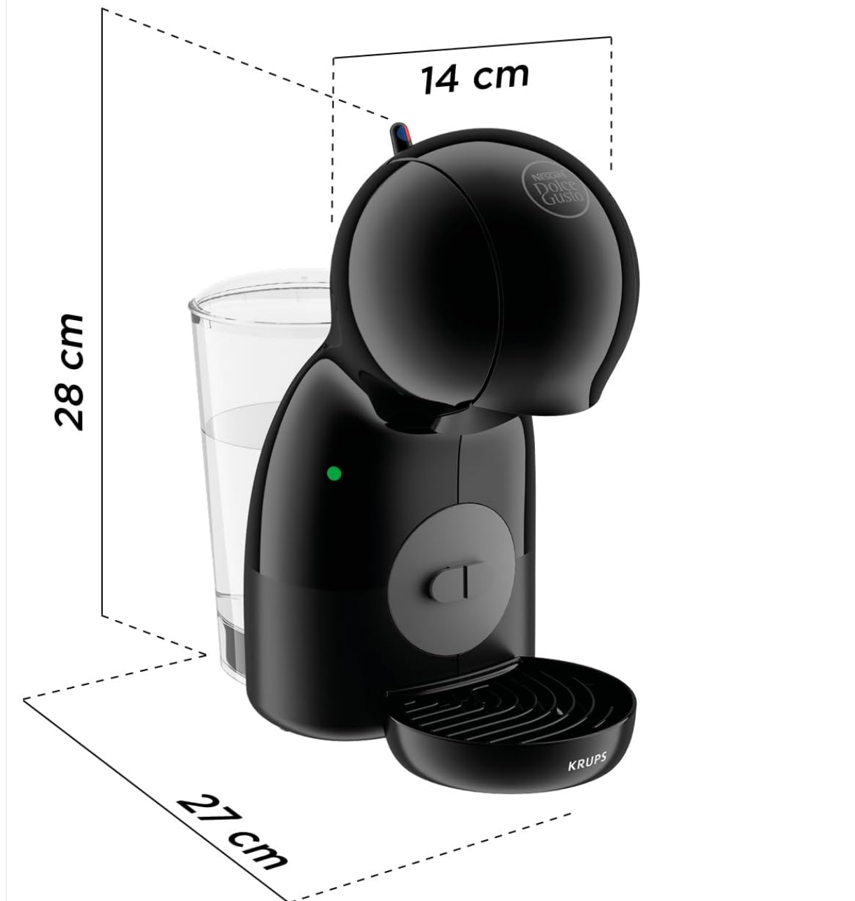
Figure 2: Compact dimensions of the Piccolo XS machine.