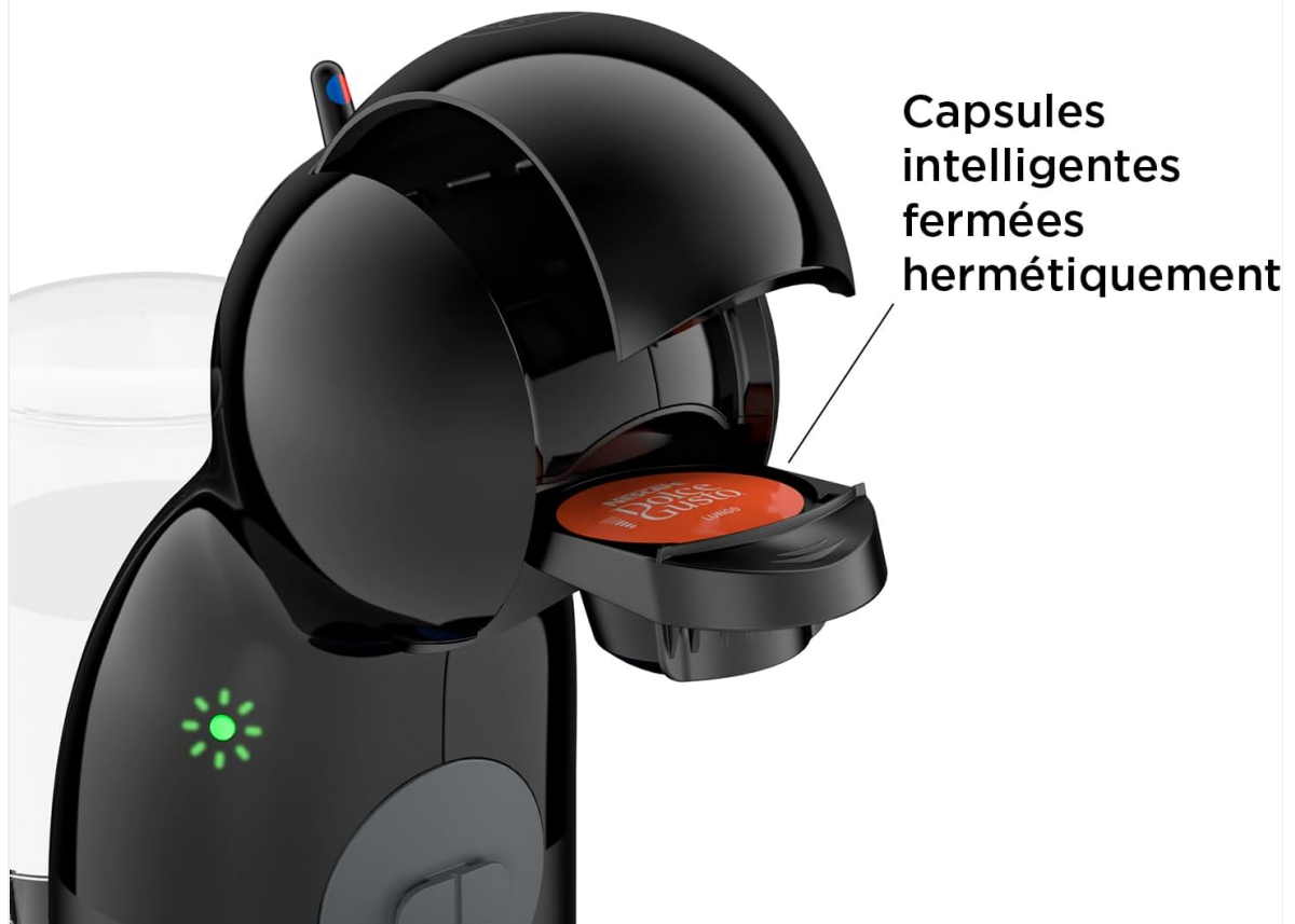
Figure 4: Inserting a Nescafé Dolce Gusto capsule.