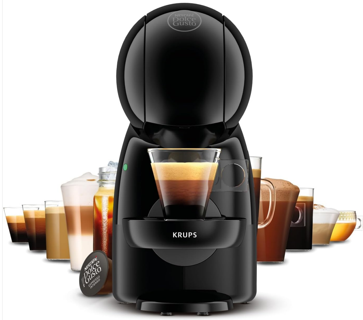
Figure 3: The machine supports a wide variety of Nescafé Dolce Gusto beverages.