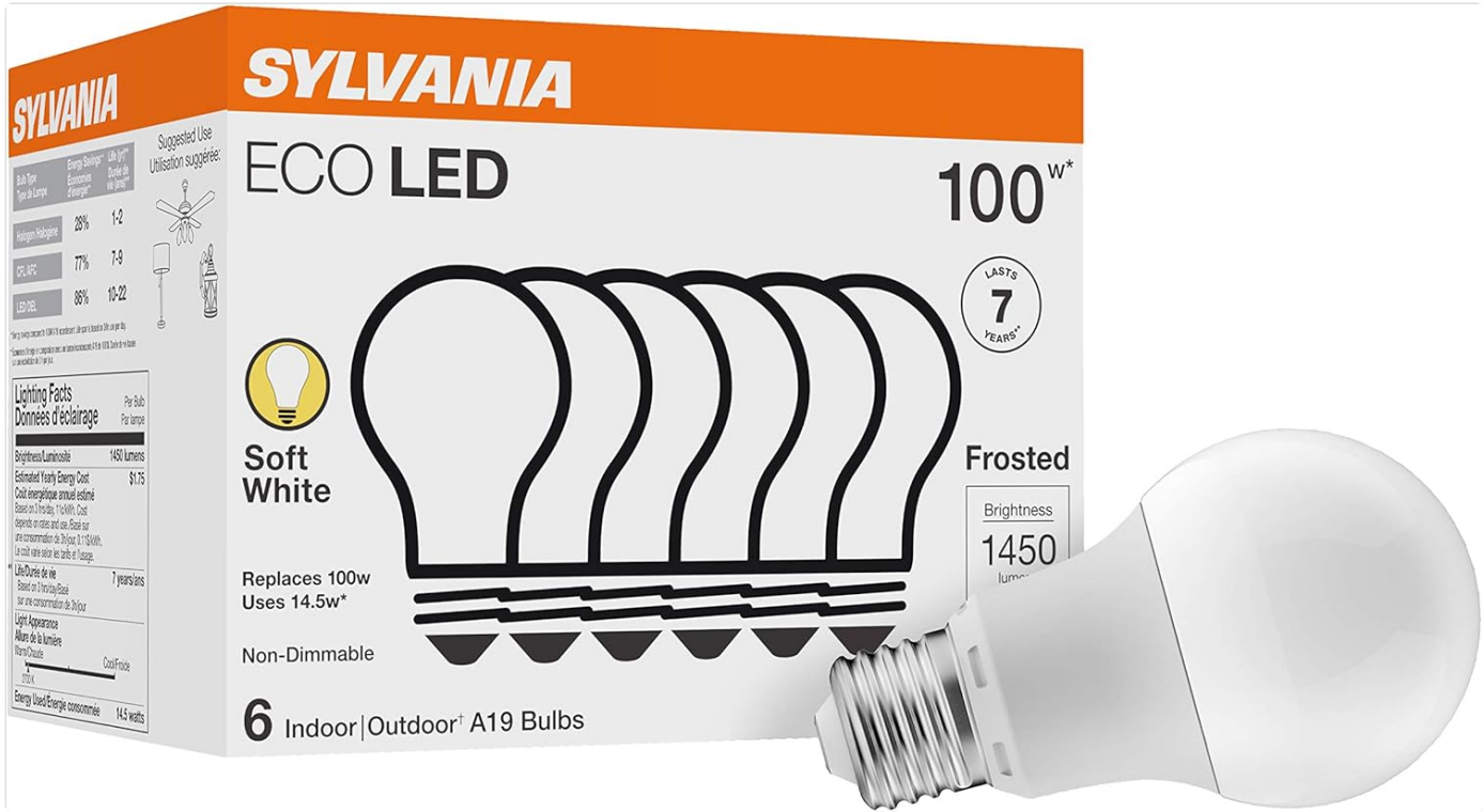
Image: The product packaging for the SYLVANIA ECO LED A19 Light Bulbs, showing a 6-pack, alongside a single bulb. The packaging highlights key features such as "Soft White," "100W Equivalent," "14.5W," "1450 Lumens," and "7 Year" lifespan.

The SYLVANIA ECO LED A19 Light Bulb is an energy-efficient lighting solution designed to replace traditional 100-watt incandescent bulbs. Operating at 14.5 watts, these LED lamps provide 1450 lumens of soft white light (2700K color temperature) and are engineered for a long lifespan, reducing the need for frequent replacements. They are non-dimmable and suitable for various indoor and outdoor applications, excluding fully enclosed fixtures. These bulbs are mercury-free and do not emit harmful UV or IR radiation.