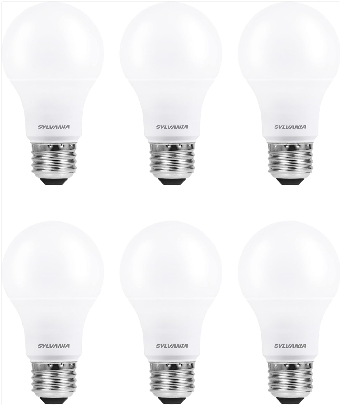
Image: A set of six SYLVANIA LED A19 light bulbs, showcasing their standard A19 shape and E26 medium base, ready for installation.