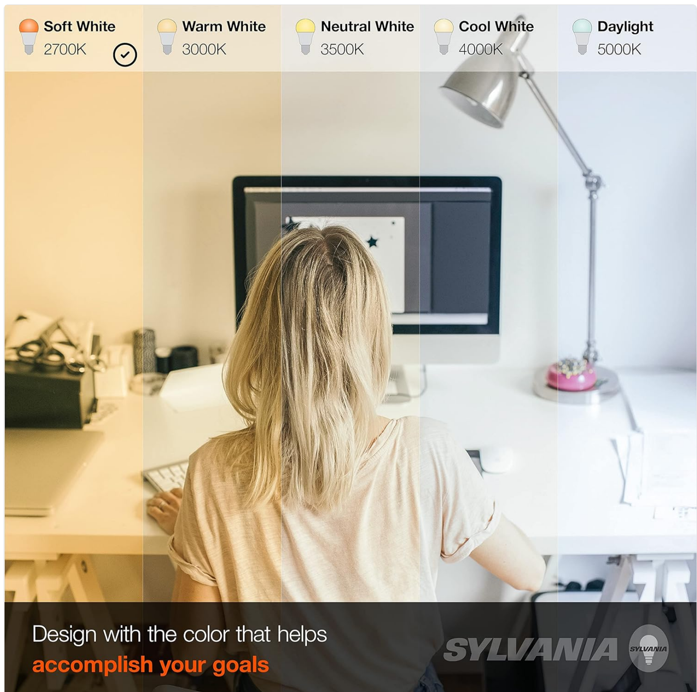
Image: A visual chart demonstrating different light color temperatures, with Soft White (2700K) highlighted, indicating the specific light quality provided by these bulbs.