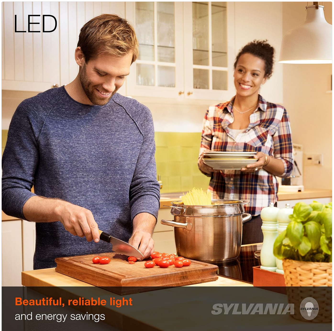
Image: A couple in a kitchen, illuminated by bright, reliable LED lighting, demonstrating the practical application of the bulbs in a home environment.