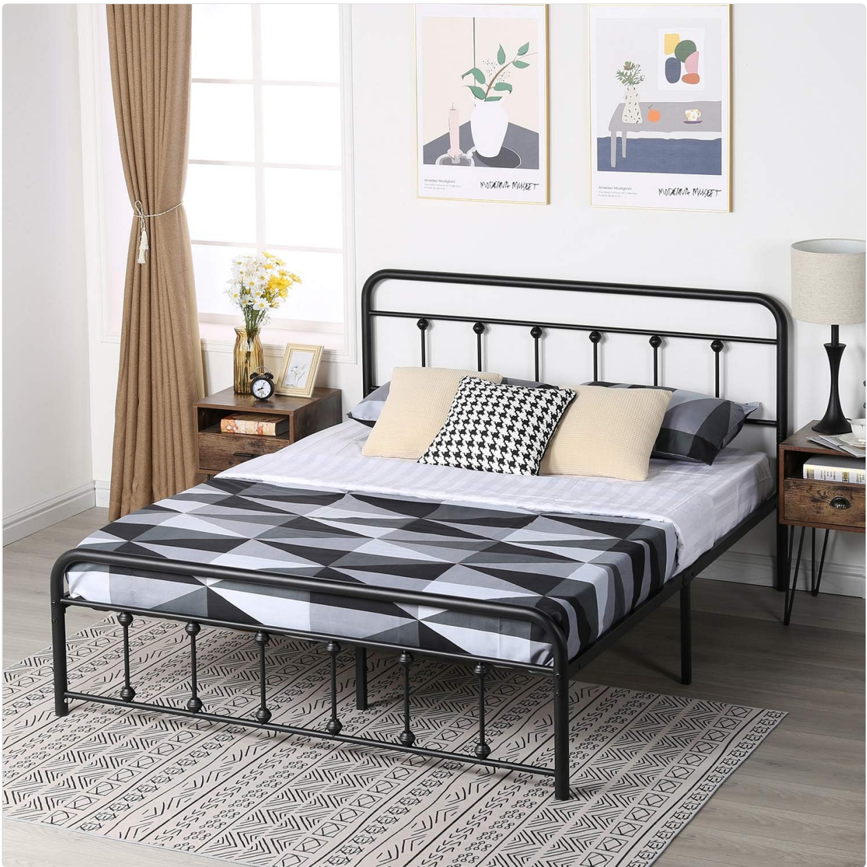
Figure 1: Fully assembled VECELO Full Size Victorian Style Metal Bed Frame.