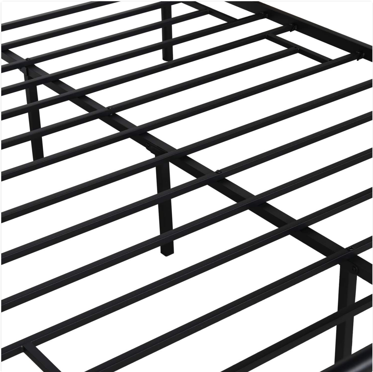
Figure 4: Detail of the metal slat support system.