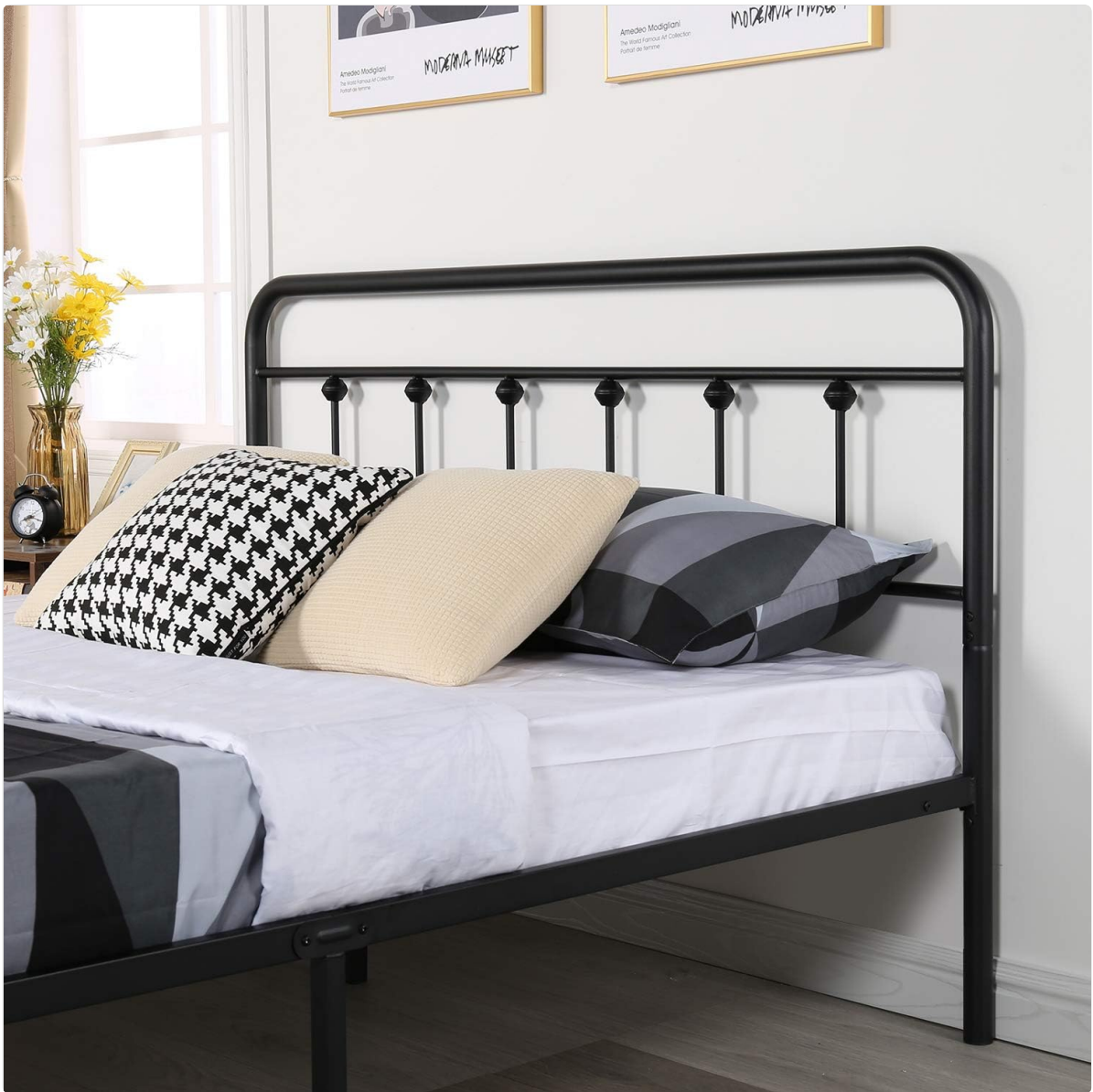
Figure 3: Detail of the headboard design.