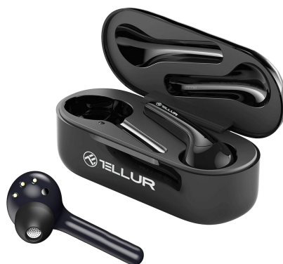
Figure 1: TELLUR Ambia headphones in their open charging case, showcasing both earbuds and the case interior.

The TELLUR Ambia headphones are designed for a seamless audio experience, featuring true wireless connectivity, smart wear detection, and intuitive controls.