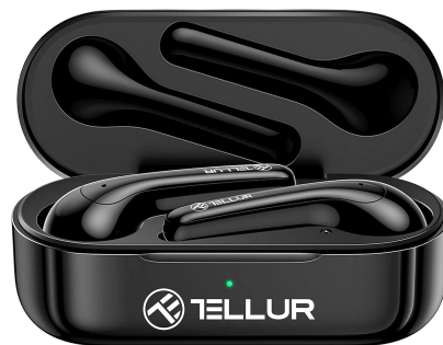
Figure 3: TELLUR Ambia headphones inside the charging case, showing the green indicator light, signifying charging or full charge.