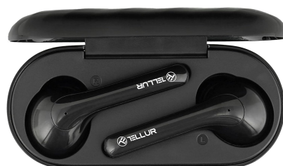
Figure 2: Top-down view of the TELLUR Ambia earbuds resting inside their charging case, with the lid open.