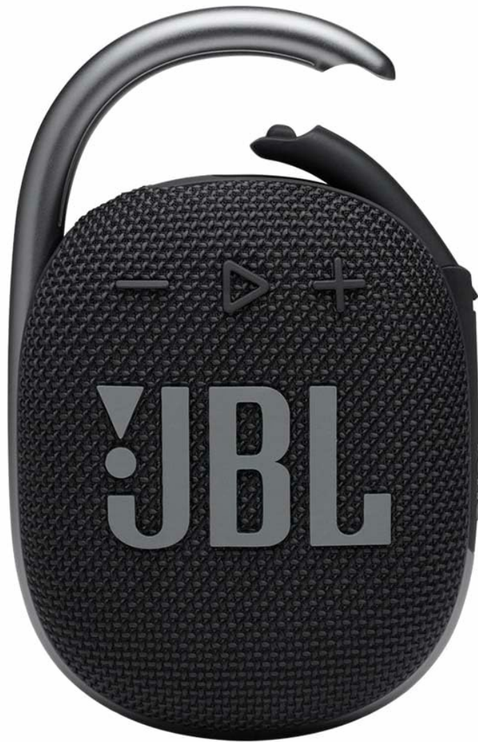
Image: Front view of the JBL CLIP 4 Portable Bluetooth Speaker in black, showcasing its compact design and integrated carabiner.