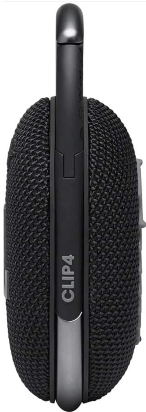
Image: Side view of the JBL CLIP 4 speaker, highlighting the USB-C charging port and the "CLIP4" branding.