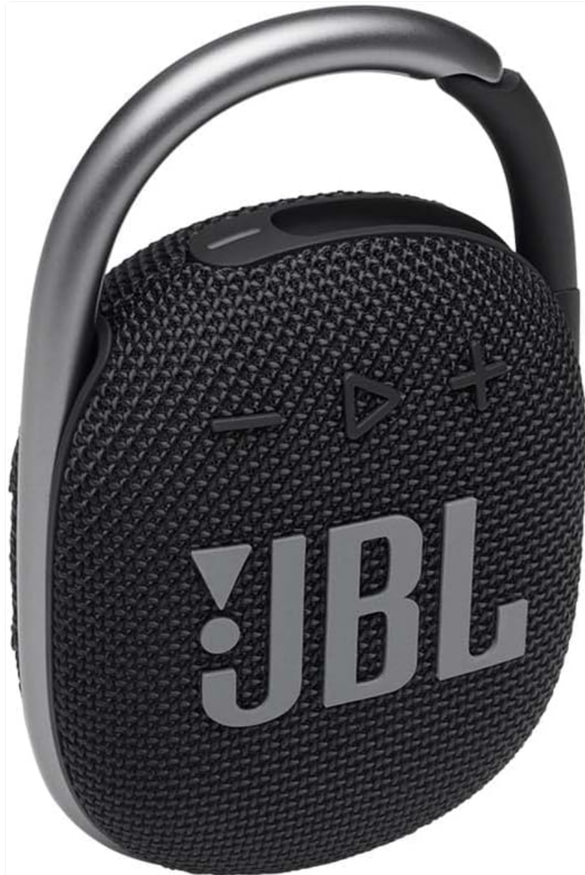
Image: Close-up of the JBL CLIP 4 showing the power and Bluetooth buttons on the side.