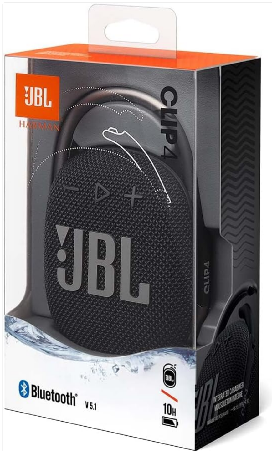
Image: The JBL CLIP 4 speaker in its retail packaging, indicating the included accessories.