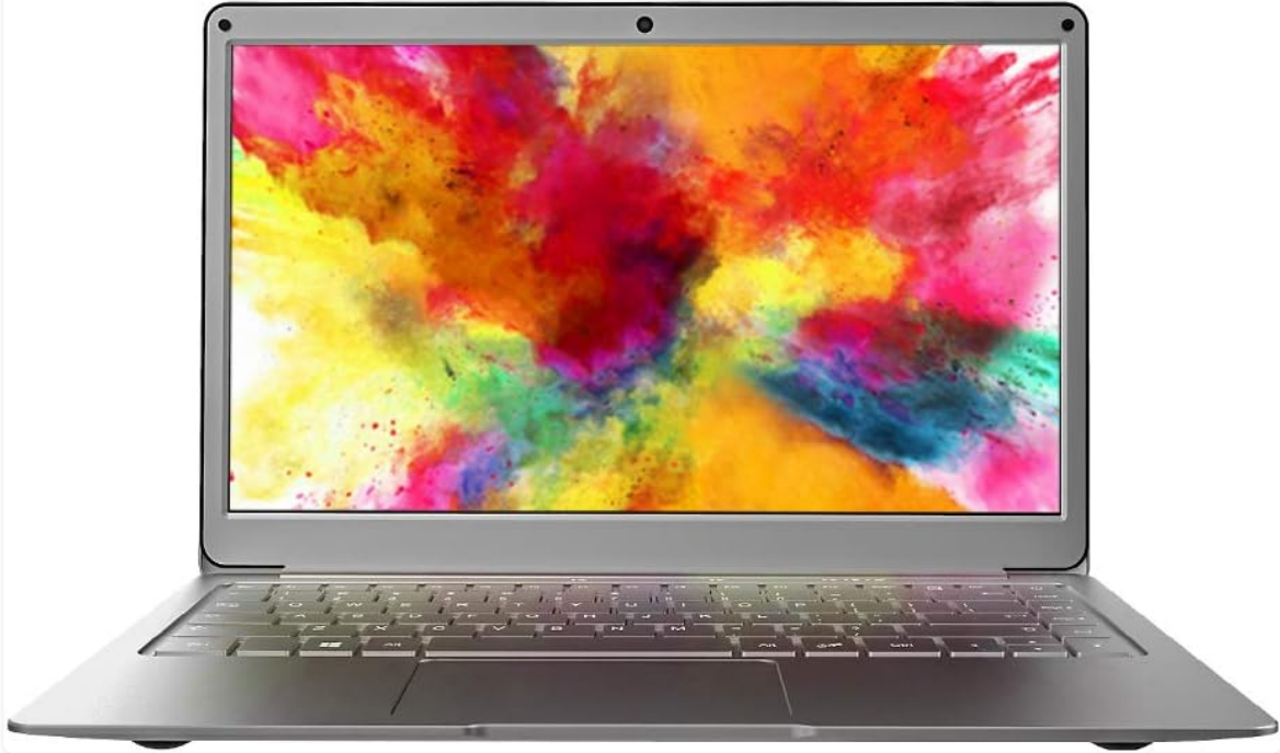
Figure 5: Display features of the Jumper EZbook X3.