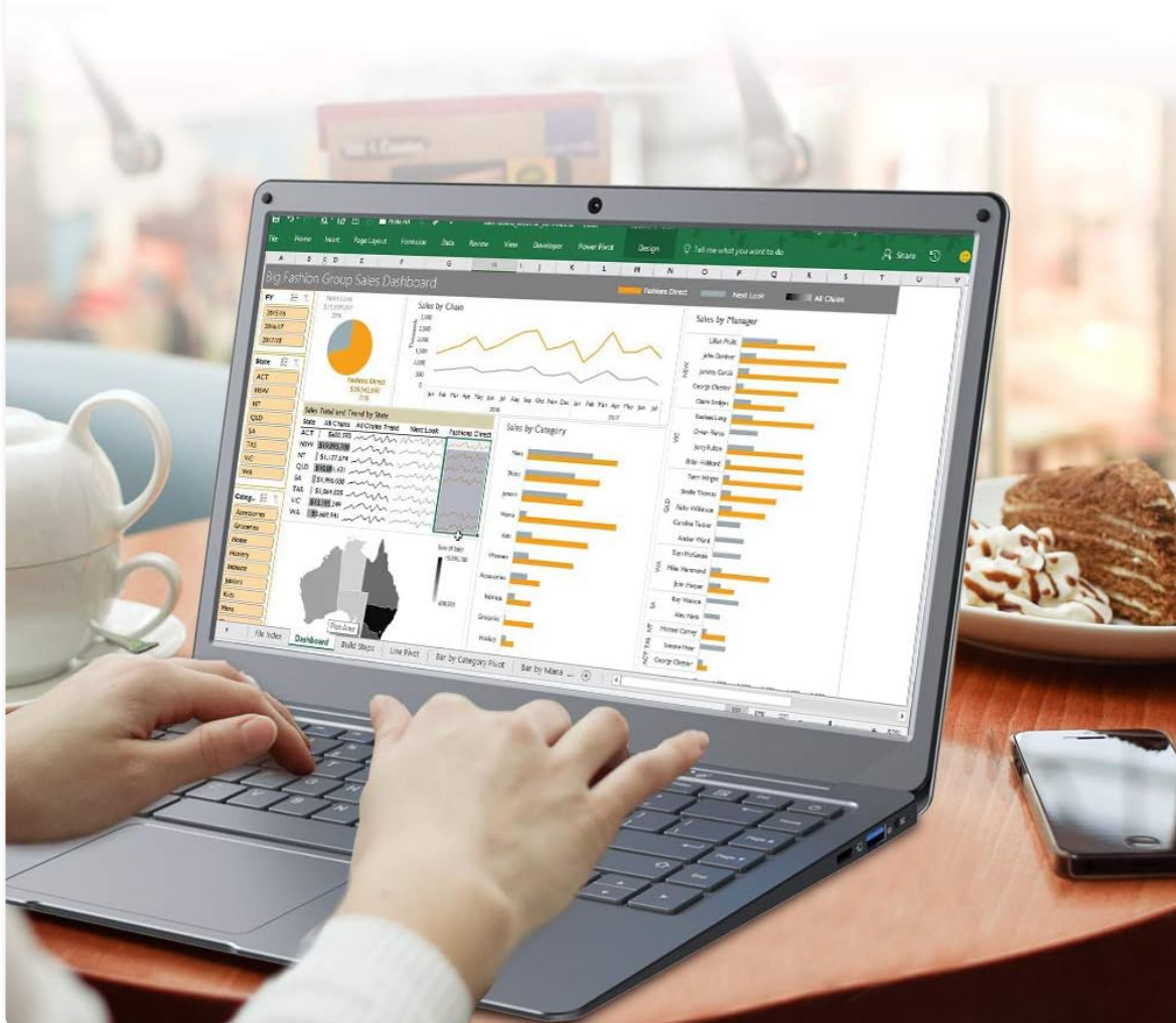
Figure 6: Jumper EZbook X3 with Microsoft Office 365 on screen.