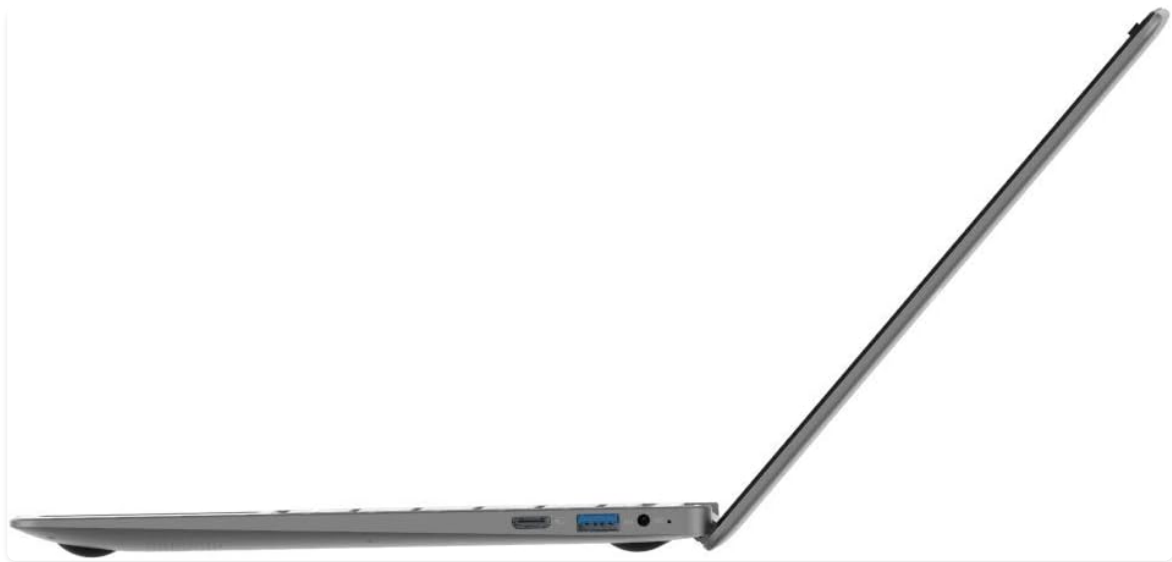
Figure 4: Side view of the Jumper EZbook X3 highlighting available ports.

Your browser does not support the video tag.