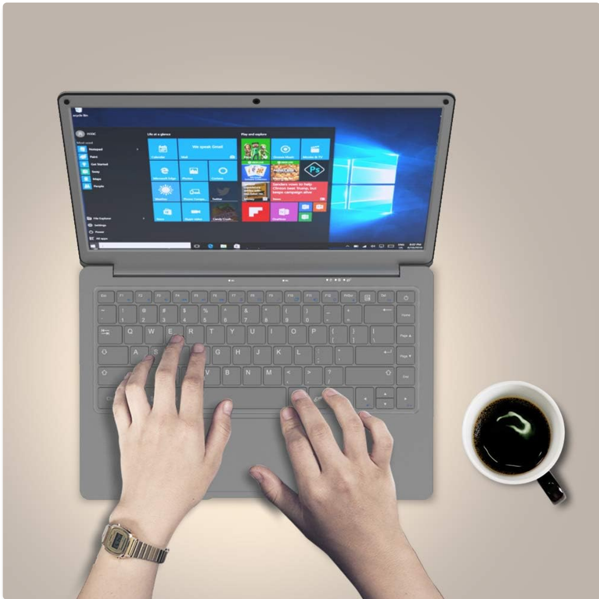
Figure 3: User interacting with the keyboard and trackpad of the Jumper EZbook X3.