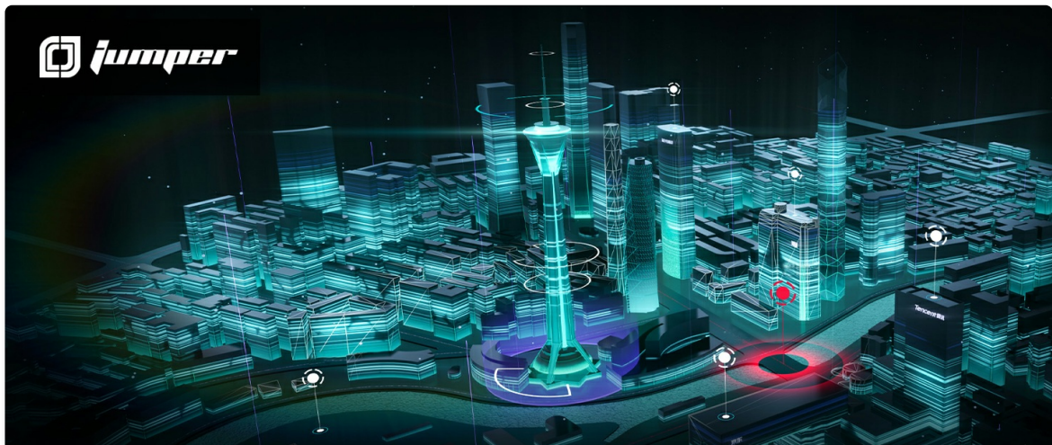
Figure 2: Jumper Tech brand illustration.