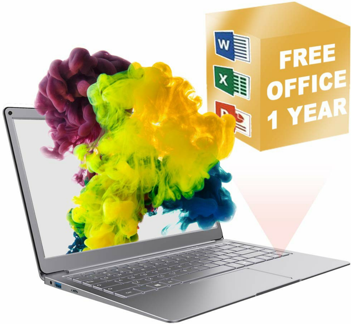
Figure 1: Jumper EZbook X3 laptop with Windows desktop.