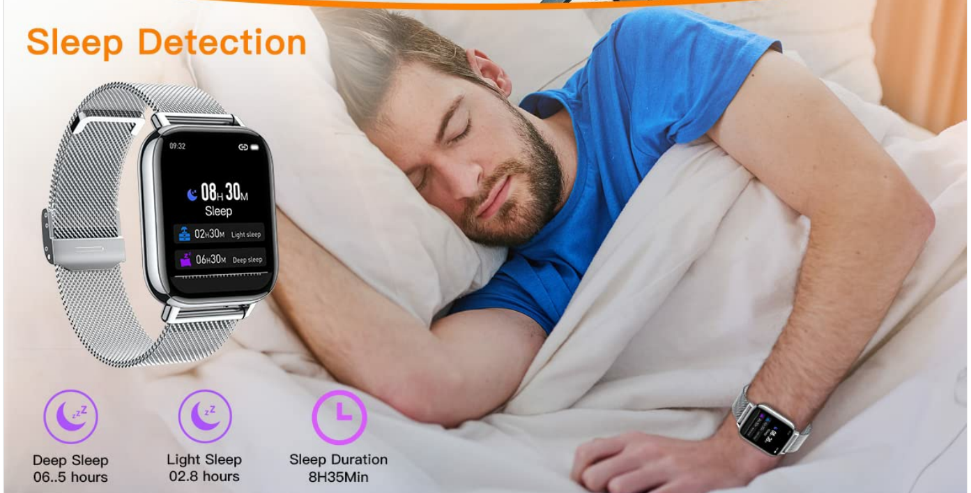
Figure 5: The watch provides sleep detection, analyzing deep sleep, light sleep, and total sleep duration. It also displays incoming call and message notifications from various social media applications when connected to a smartphone.