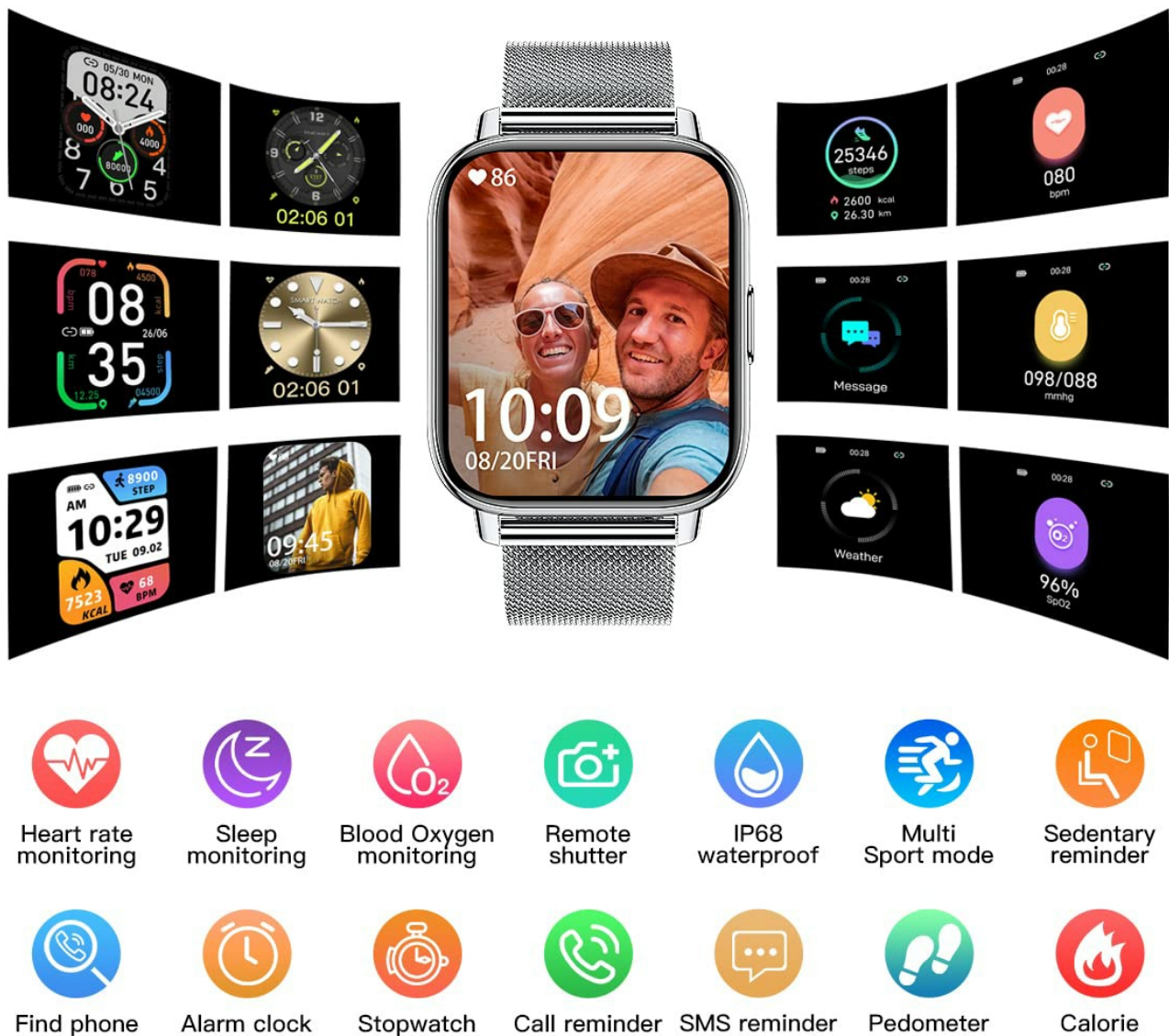
Figure 2: Overview of the 1.69-inch large screen and customizable watch dials. This image highlights features such as heart rate monitoring, sleep monitoring, blood oxygen monitoring, remote shutter, IP68 waterproof rating, multi-sport modes, sedentary reminder, find phone, alarm clock, stopwatch, call reminder, SMS reminder, pedometer, and calorie tracking.