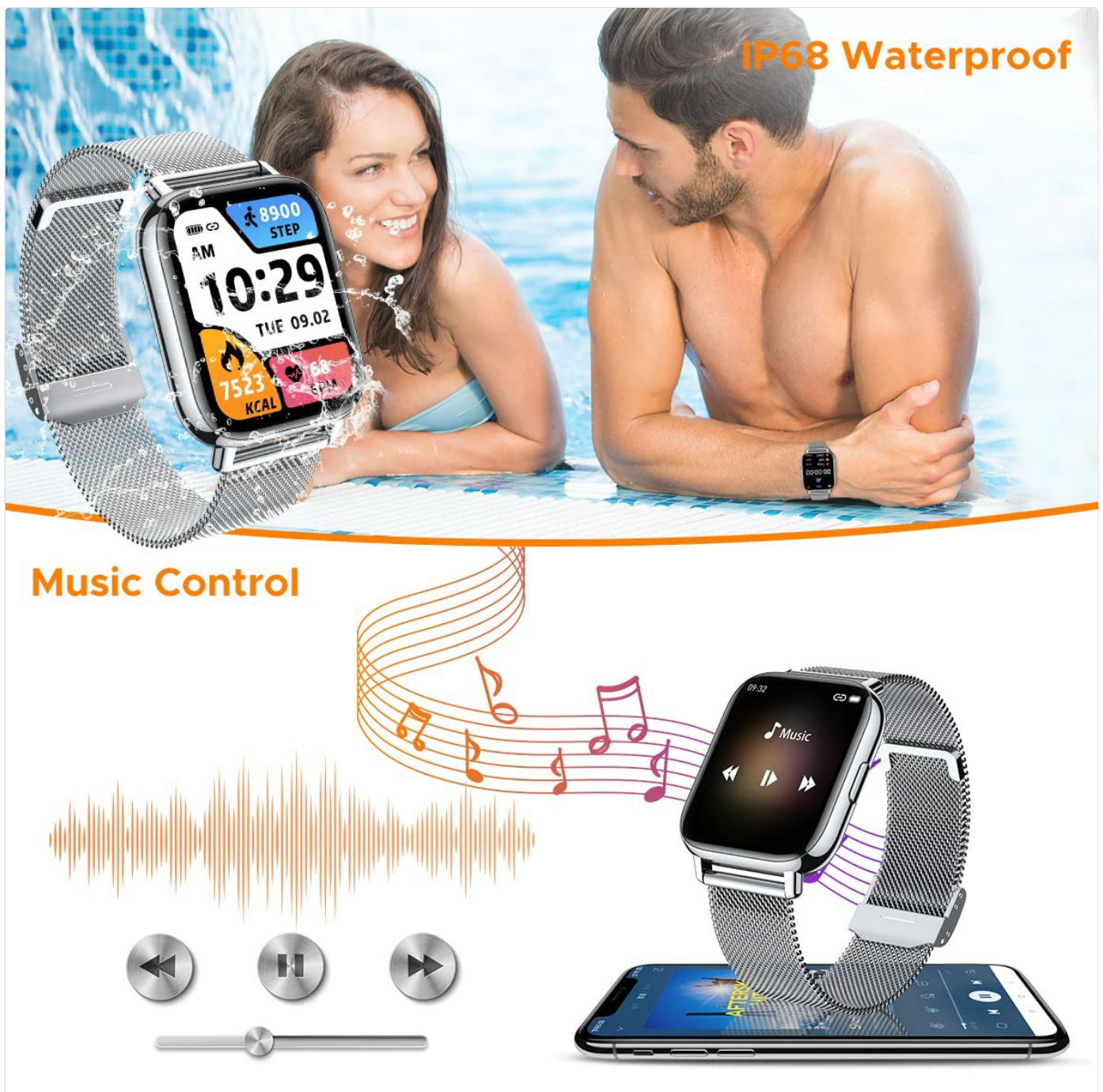
Figure 6: The watch is IP68 waterproof, allowing it to be worn during swimming. It also features music control, enabling users to manage their smartphone's music playback directly from the watch.