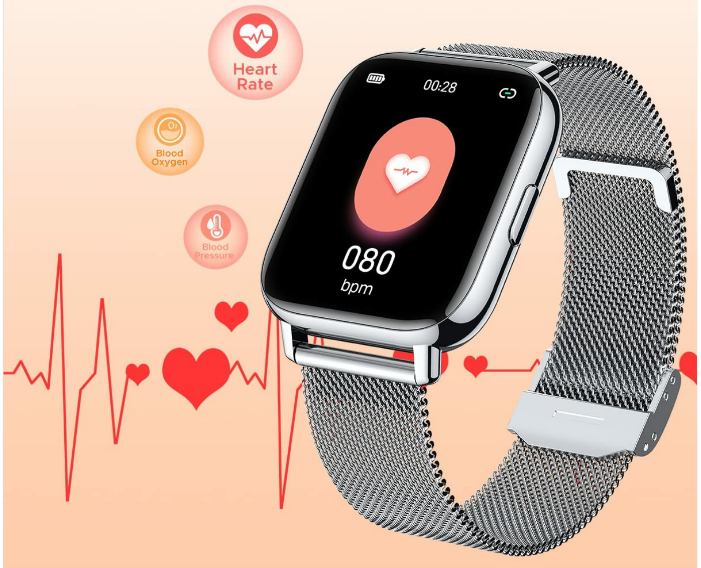
Figure 4: The smart watch automatically monitors heart rate, blood pressure, and blood oxygen levels using its built-in optical sensor. This feature helps users understand their health status.

Heart rate、 Blood Pressure 、 Blood Oxygen