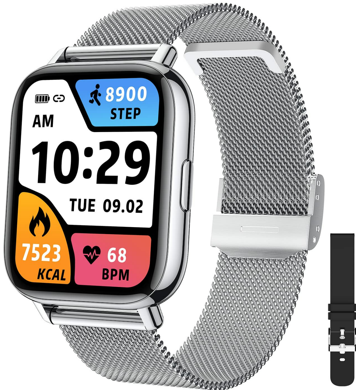
Figure 1: CanMixs Smart Watch with its included silver mesh strap and an additional black silicone strap. The watch face displays time, date, steps, calories, and heart rate.