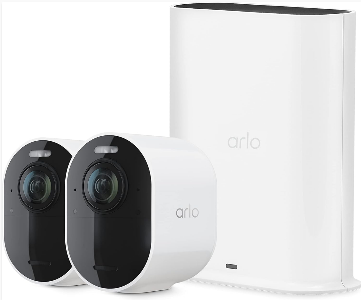
Image: The Arlo Ultra 2 Spotlight Camera system, showing two white cameras and the SmartHub.

The Arlo Ultra 2 Spotlight Camera system provides advanced wireless home security with 4K HDR video quality. This system includes two cameras and a SmartHub, essential for operation. Key features include color night vision, motion detection, a 180-degree field of view, and two-way audio communication. Designed for both indoor and outdoor environments, the cameras are battery-powered and connect via dual-band Wi-Fi.