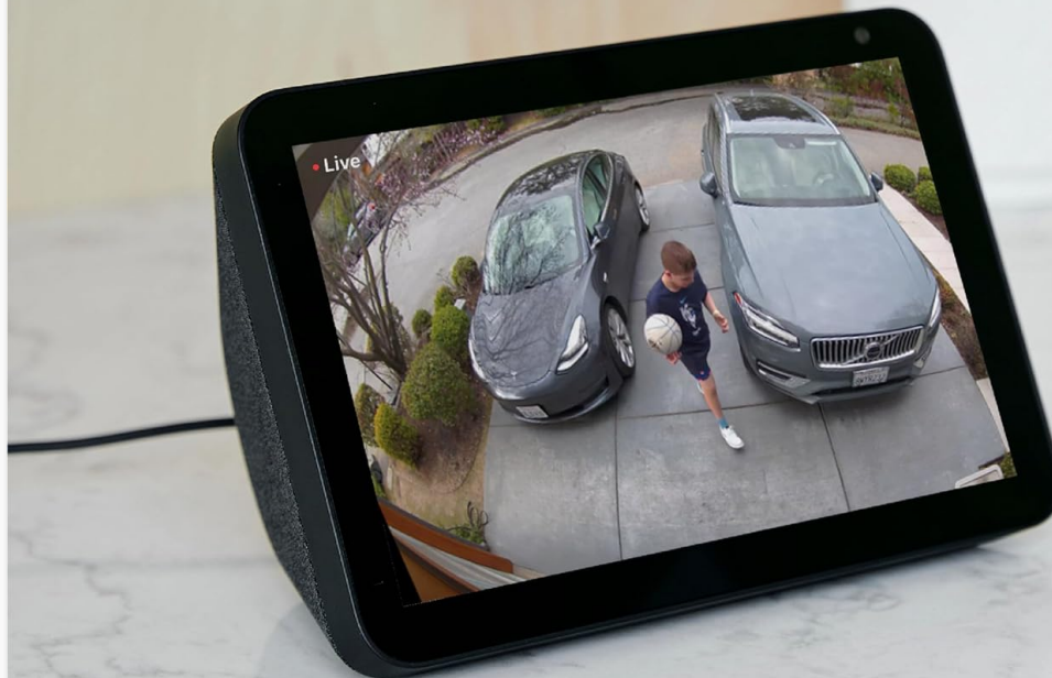
Image: An Arlo camera feed displayed on a smart home assistant's screen, showing compatibility.