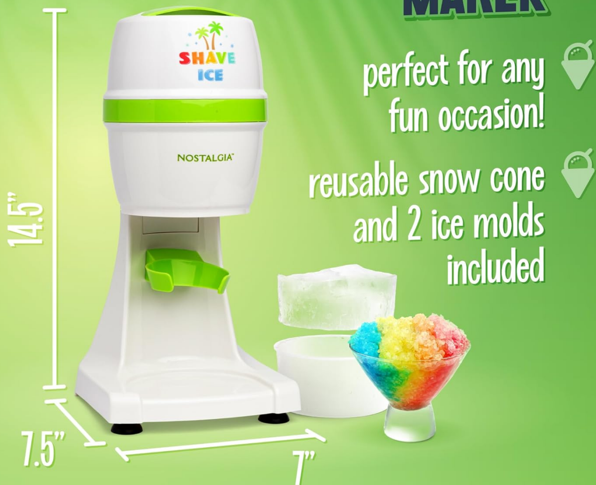
Figure 2: Product dimensions showing the machine is approximately 14.5 inches tall, 7.5 inches deep, and 7 inches wide.