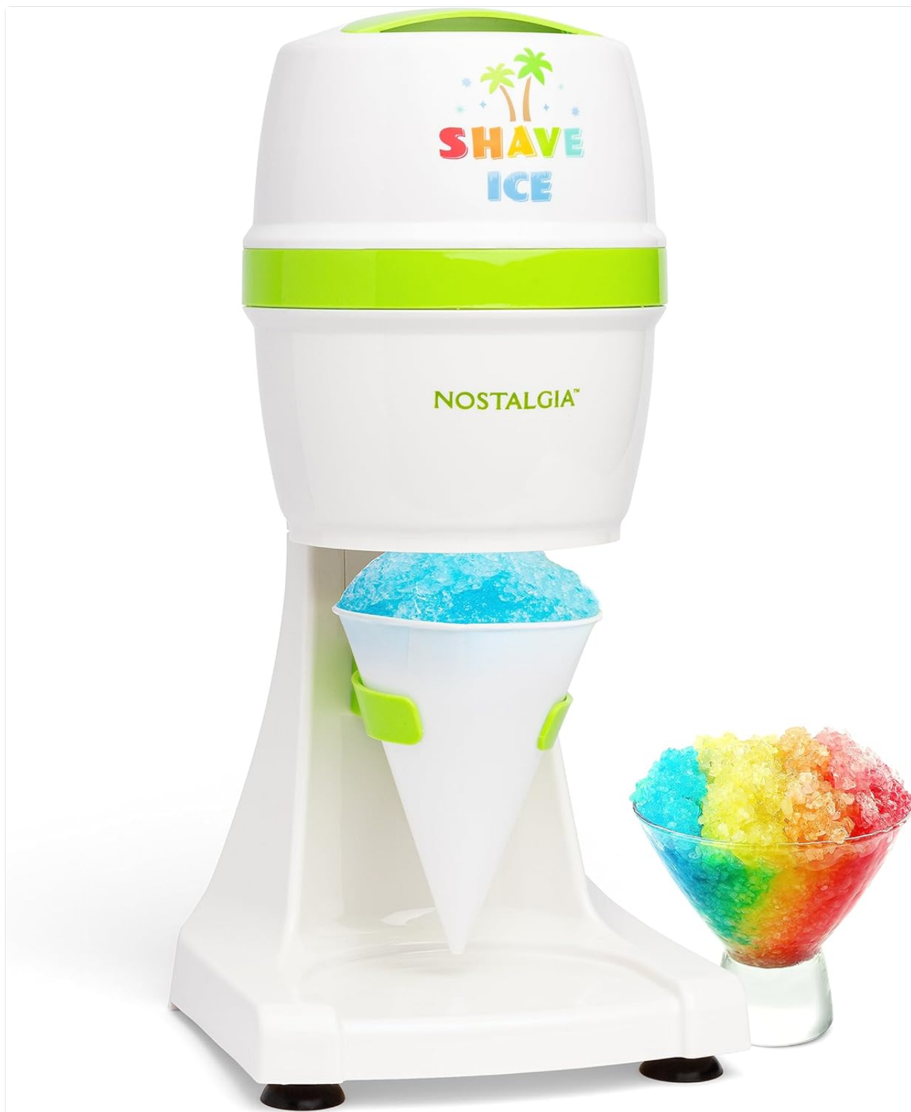
Figure 1: Nostalgia Electric Shave Ice Maker with a freshly made blue shaved ice cone and a bowl of rainbow shaved ice.