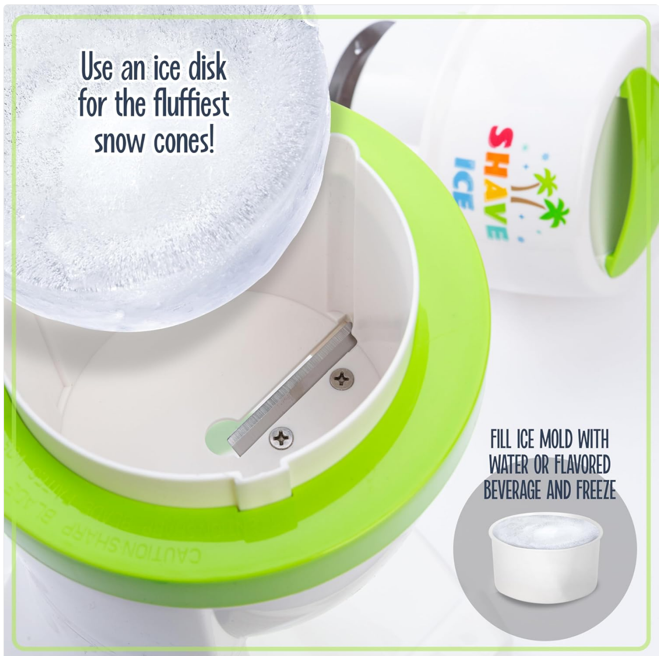
Figure 4: Close-up view of an ice disk being placed into the shaving chamber, highlighting the stainless steel blade.

Your browser does not support the video tag.