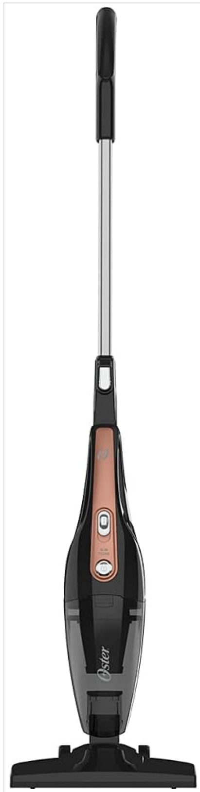
Image: The Oster OASP601 vacuum cleaner in its vertical configuration, showing the main unit, extension handle, and floor nozzle.