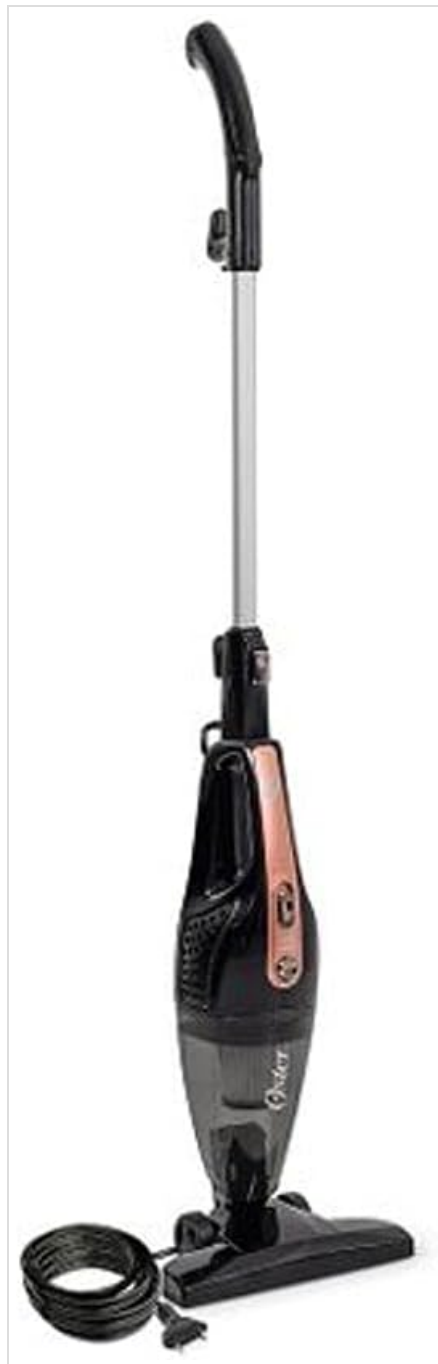
Image: The Oster OASP601 fully assembled in its vertical configuration, ready for use, with the power cord coiled.