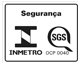
Image: INMETRO and SGS safety certification logo, indicating compliance with safety standards.