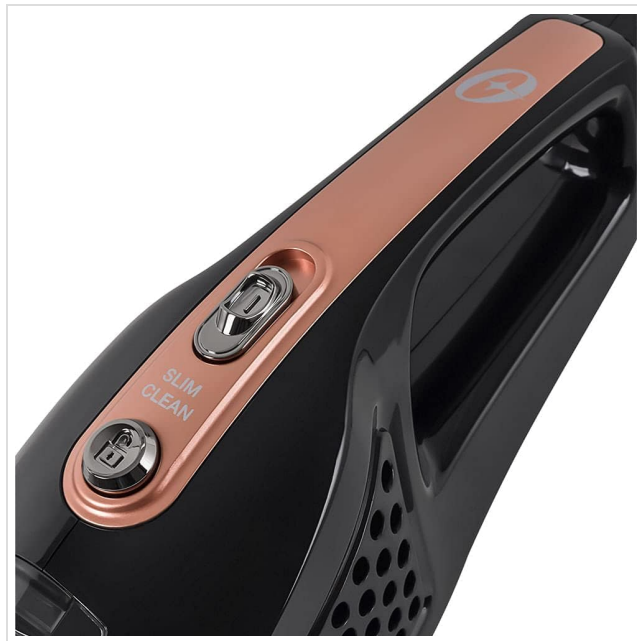
Image: Close-up view of the control buttons on the main unit, including the power switch and the 'Slim Clean' indicator.