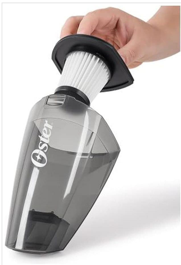
Image: A hand demonstrating the removal of the HEPA filter from the transparent dust cup of the Oster OASP601 vacuum cleaner.