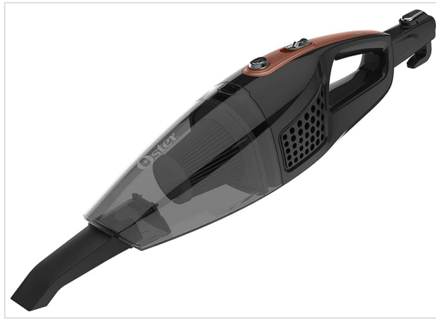
Image: The Oster OASP601 in handheld mode with the crevice tool attached, demonstrating its compact form for detailed cleaning.