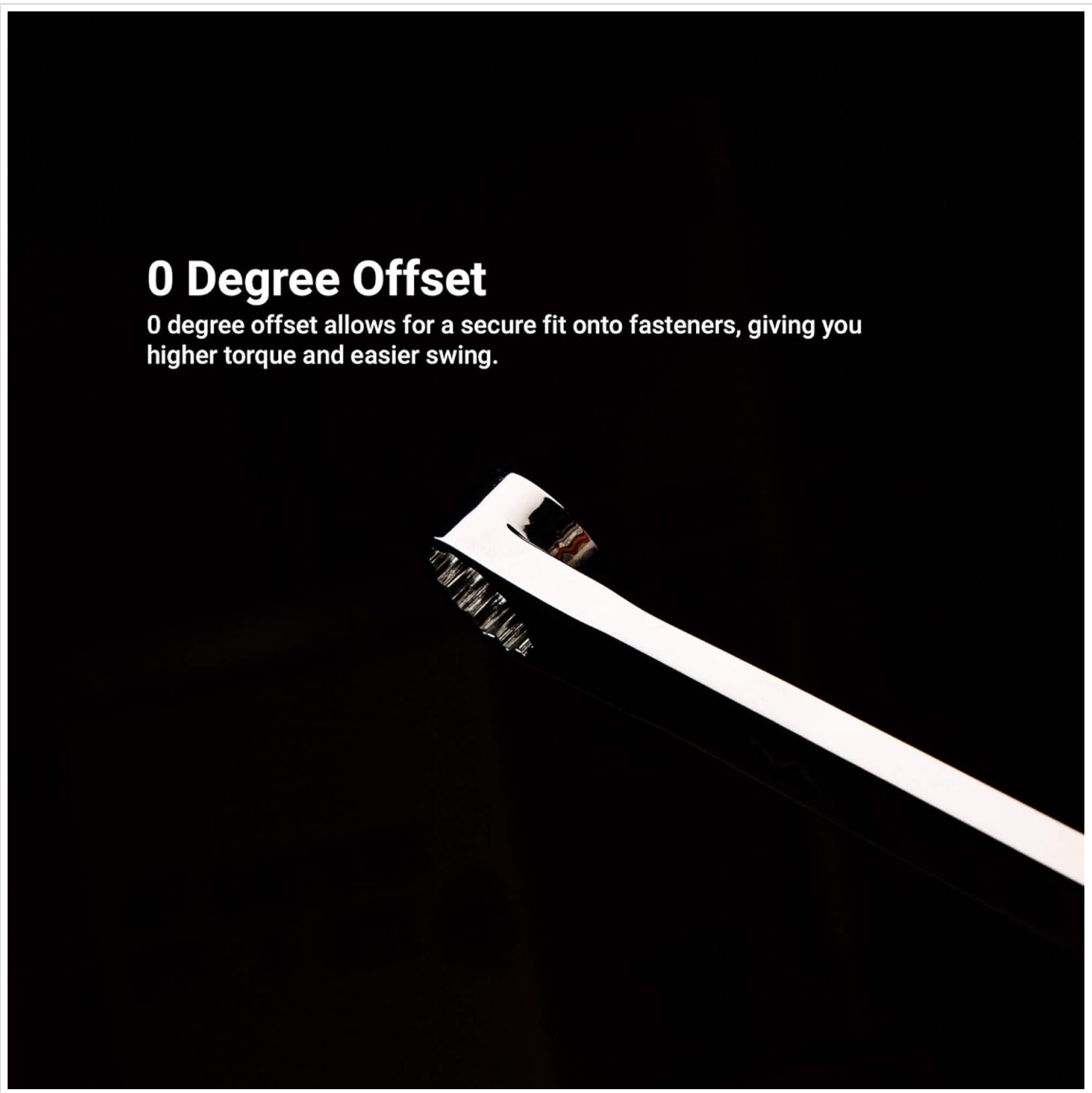
Image: Detail of the 0-degree offset box end, designed for secure fit and easier swing.

0 degree offset allows for a secure fit onto fasteners, giving you higher torque and easier swing.