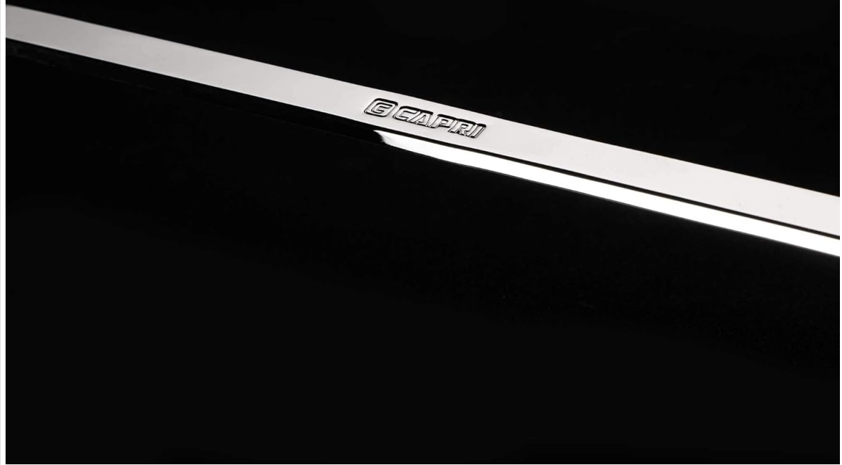
Image: The flawless chrome finish of a Capri Tools wrench, indicating its durable construction.

Achieve by thorough polishing and careful application of chrome protective plating, ensures durability and corrosion resistance.