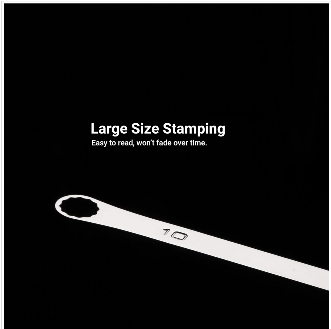
Image: Large, clearly stamped size '10' on a Capri Tools wrench for easy identification.