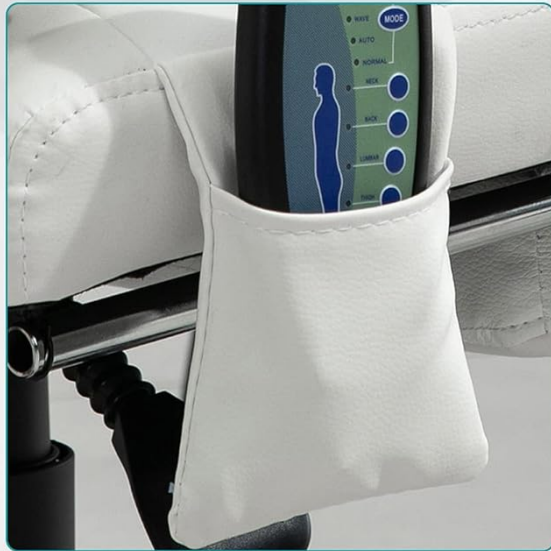
• Side Pocket