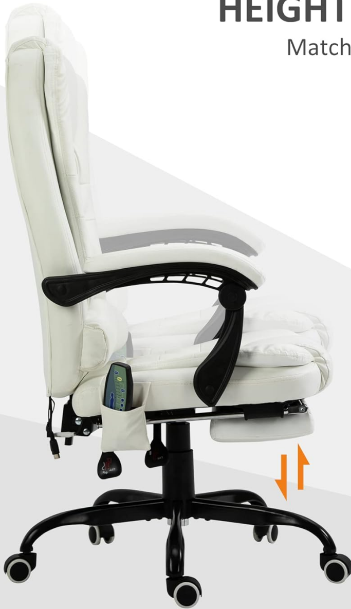
Image: Visual guide for adjusting the chair's height, showing the lever and the adjustable range.