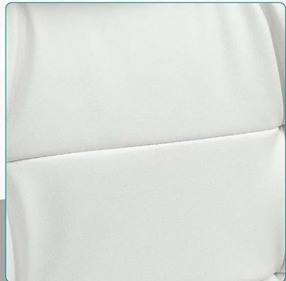
• Durable PU leather

Image: Detailed views of key chair features: the remote control, its storage pocket, the full swivel casters, and the texture of the durable PU leather upholstery.