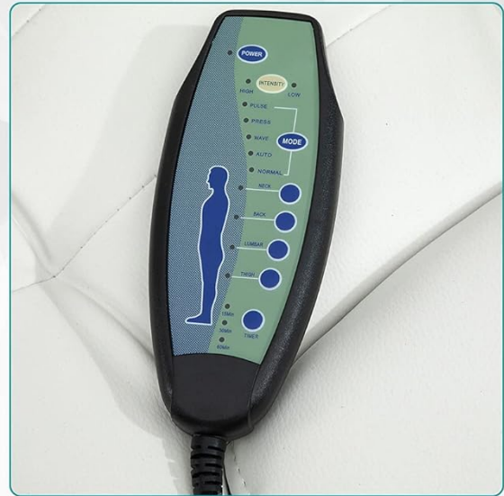
• Remote Control