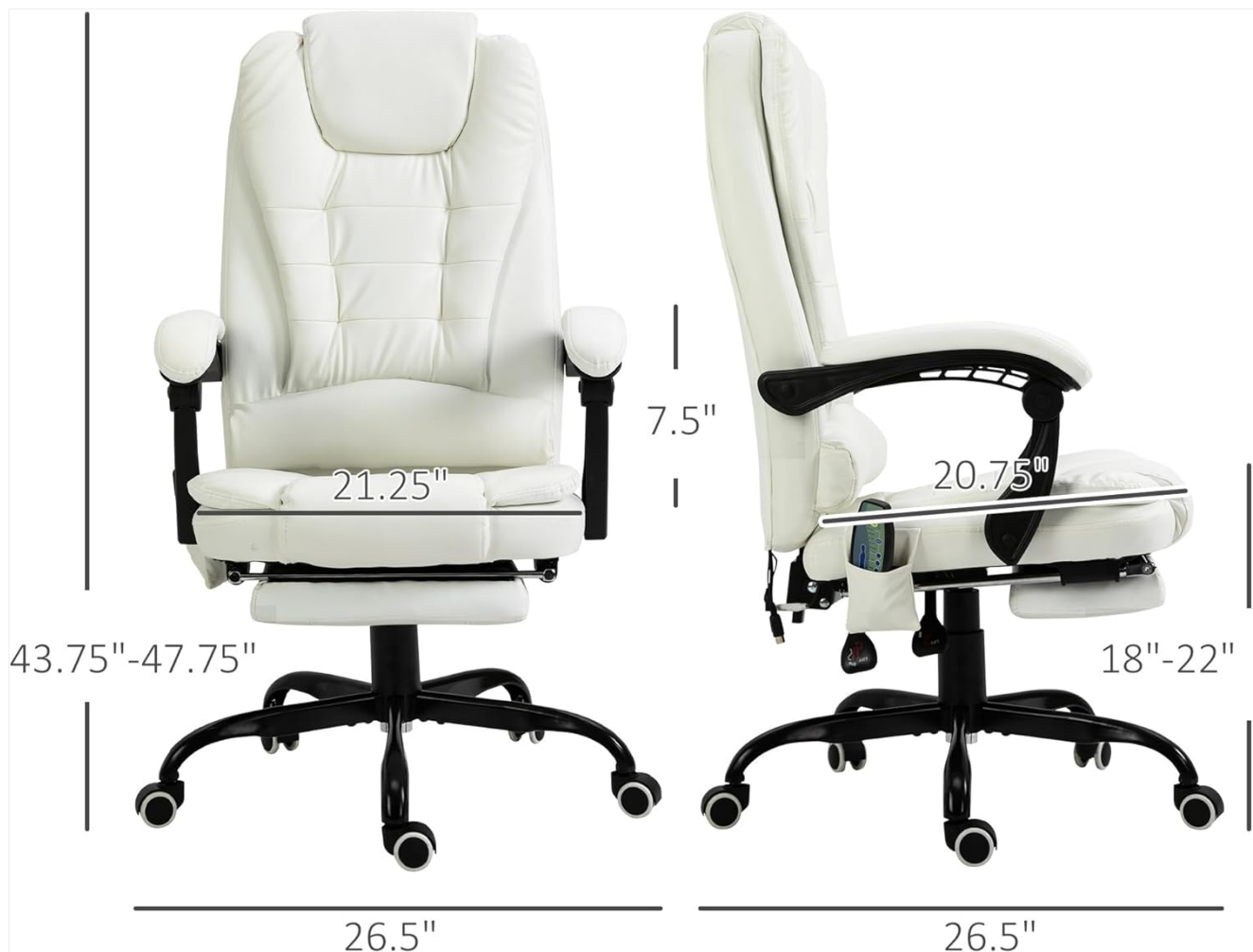
Image: Technical drawing illustrating the key dimensions of the office chair, including height, width, and depth measurements.