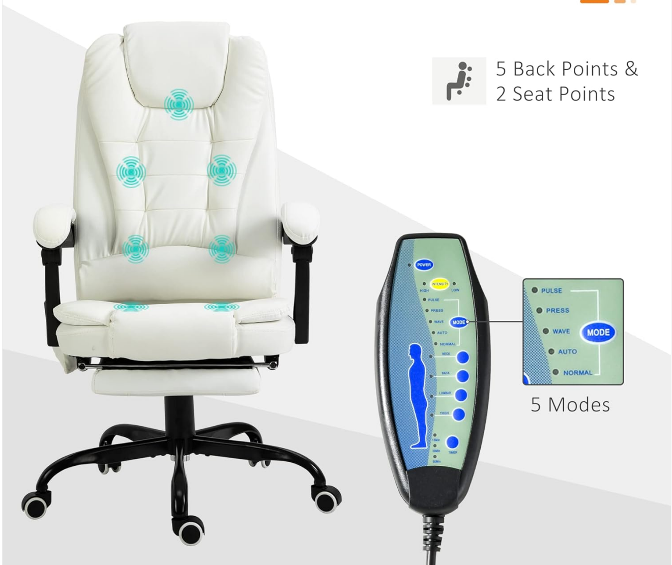
Image: Visual representation of the 7 vibration points within the chair and the remote control interface for selecting modes and intensity.

Your browser does not support the video tag.