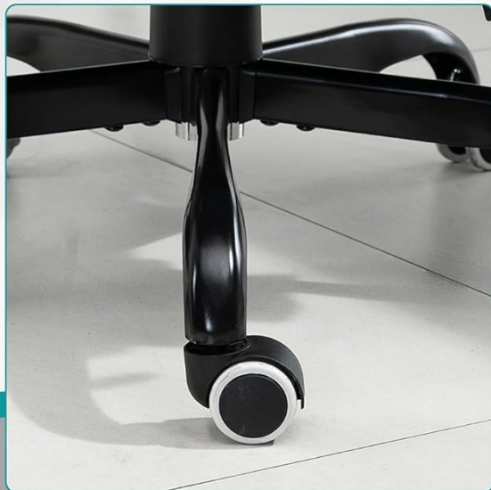
• Full Swivel Caster