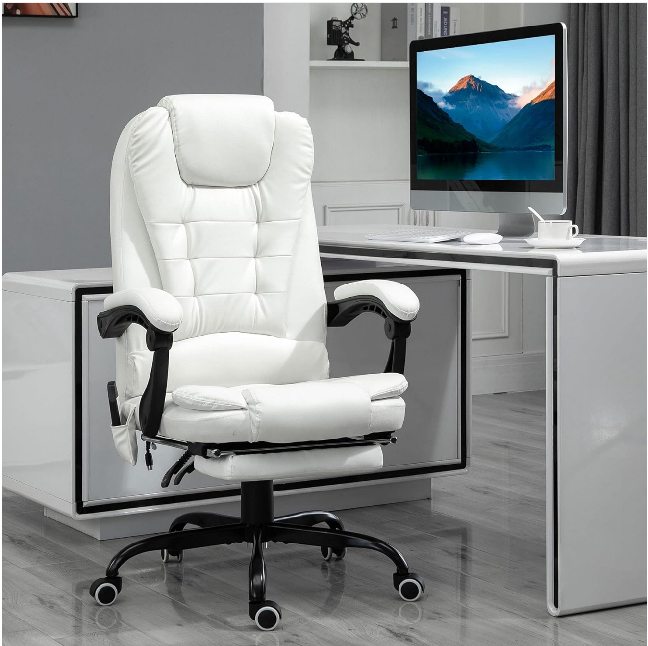
Image: The Vinsetto 7-Point Vibrating Massage Office Chair in white, positioned in an office setting.