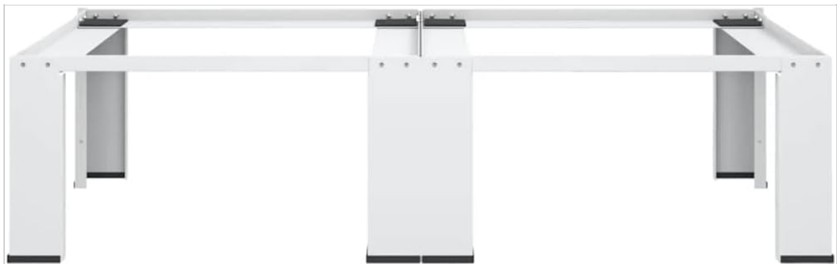
Image: All components of the vidaXL Double Washing Machine and Dryer Stand laid out.