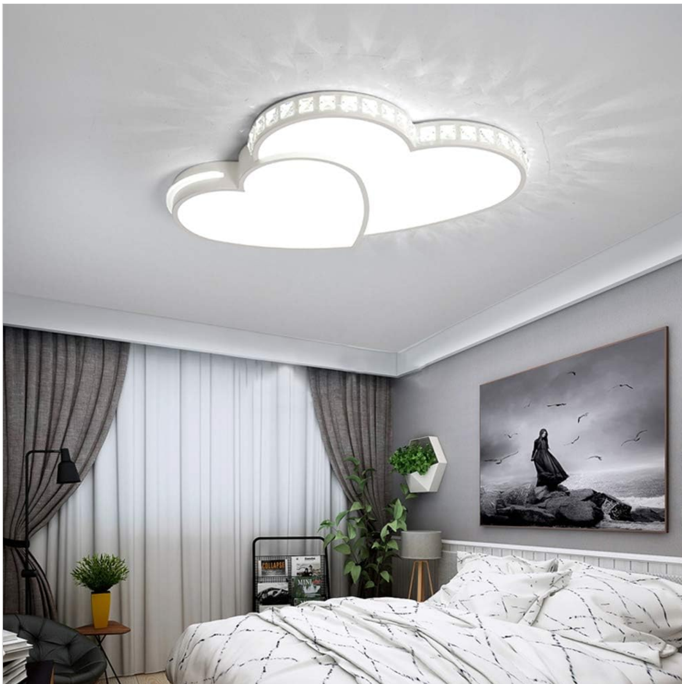
Figure 3: Fixture in Bedroom Setting. This image shows the ceiling light installed in a bedroom, demonstrating its appearance and light distribution in a typical residential environment.