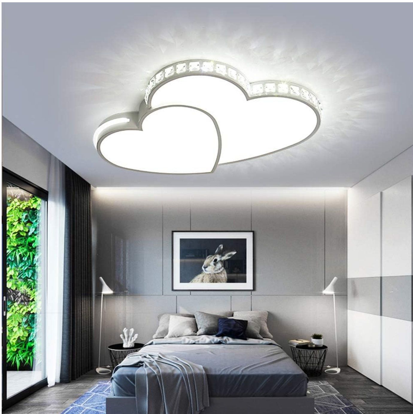
Figure 2: Close-up of Crystal Details. This image provides a detailed view of the crystal embellishments and the overall construction of the light fixture, useful for understanding assembly or aesthetic details.