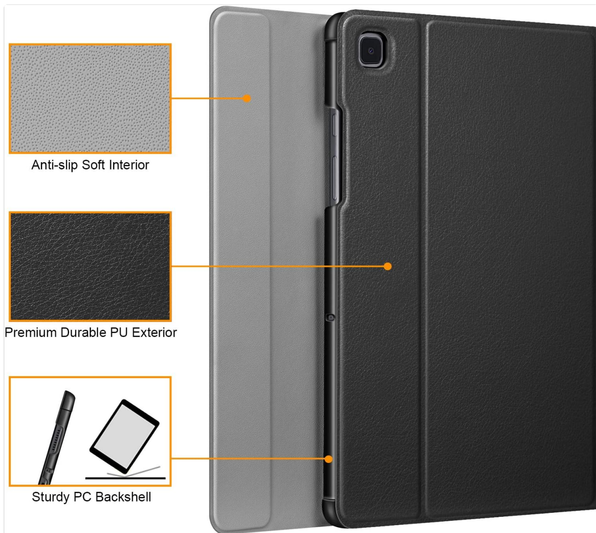
Image: Construction details of the case, showing its multi-layered protective design.