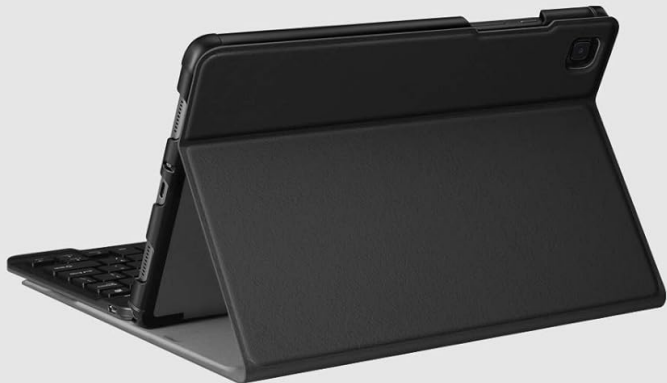
Image: Comparison highlighting the precise microphone cutout on the FINTIE case.