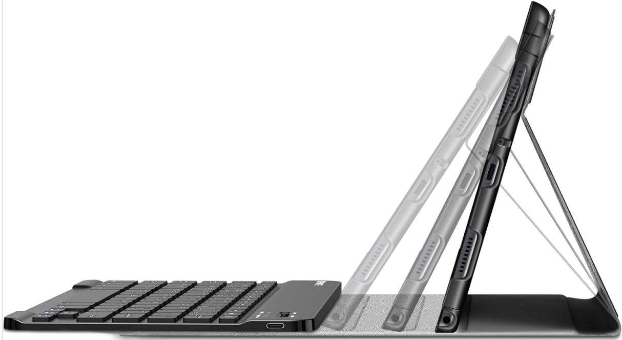
Image: The case supports multiple viewing angles for user comfort.

It turns into a convenient stand, gives you a best viewing angle.