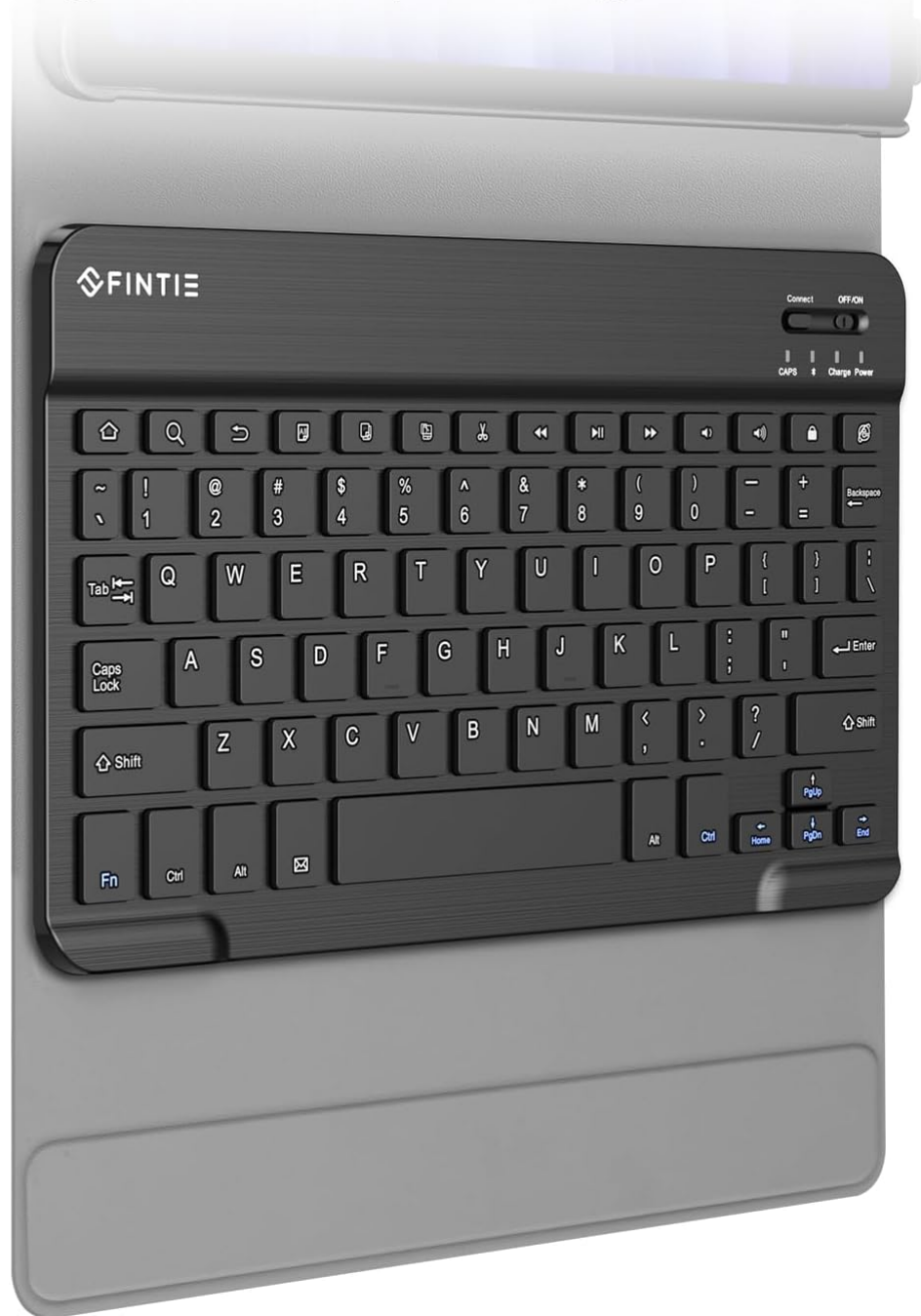
Image: The keyboard features a strong magnetic attachment to the case.