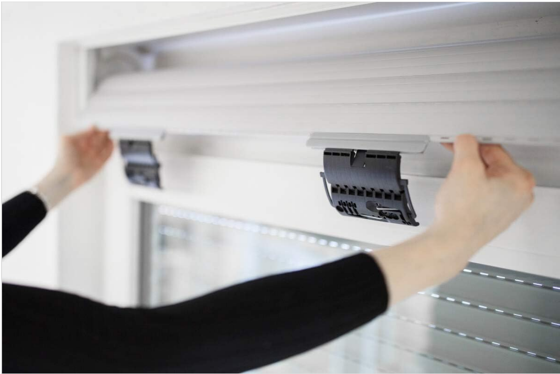
Image: Two anti-lift devices correctly positioned on the top slat of a roller shutter.