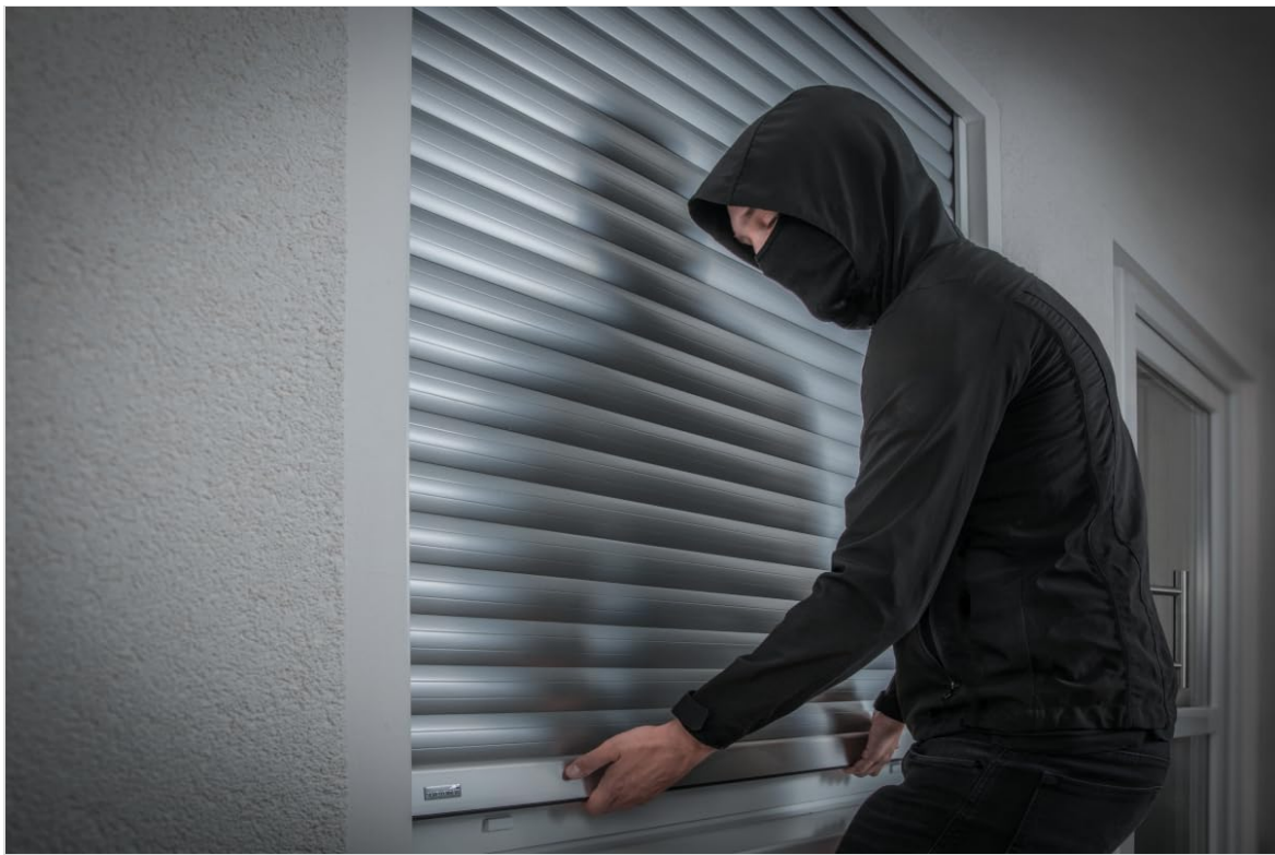
Image: Demonstration of the anti-lift function, showing resistance to forced upward movement.