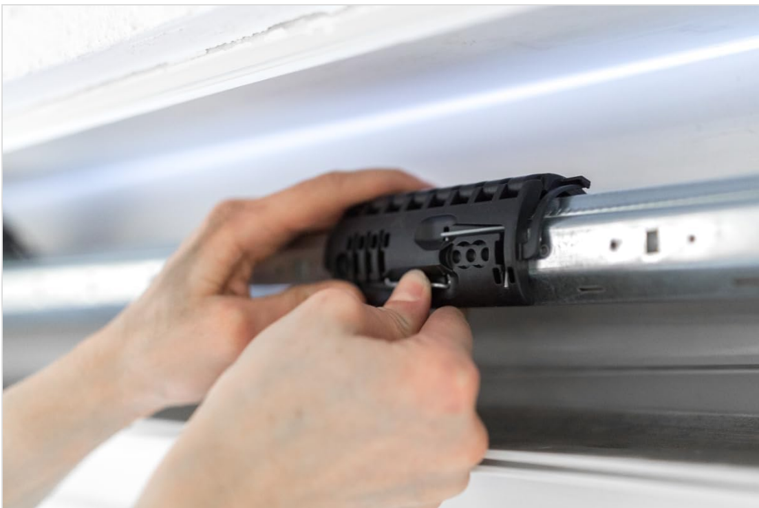
Image: Close-up of hands attaching the security device to the octagonal shaft.