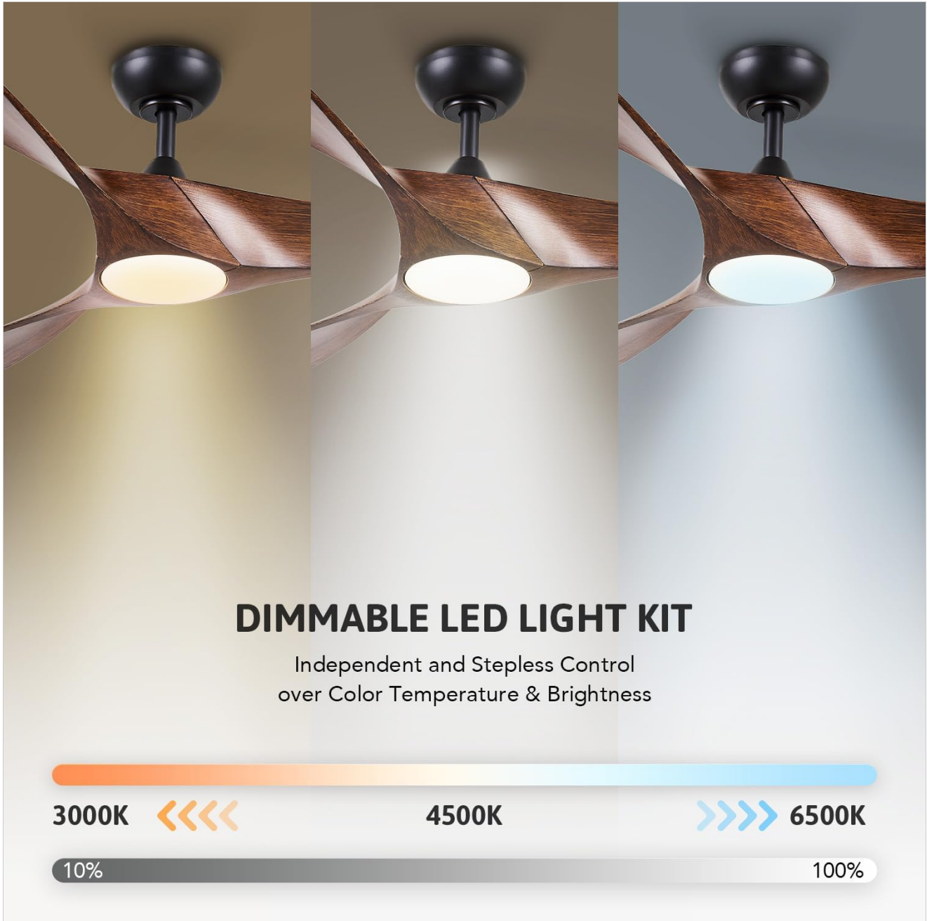
Figure 5: Dimmable LED light kit with adjustable color temperature and brightness.