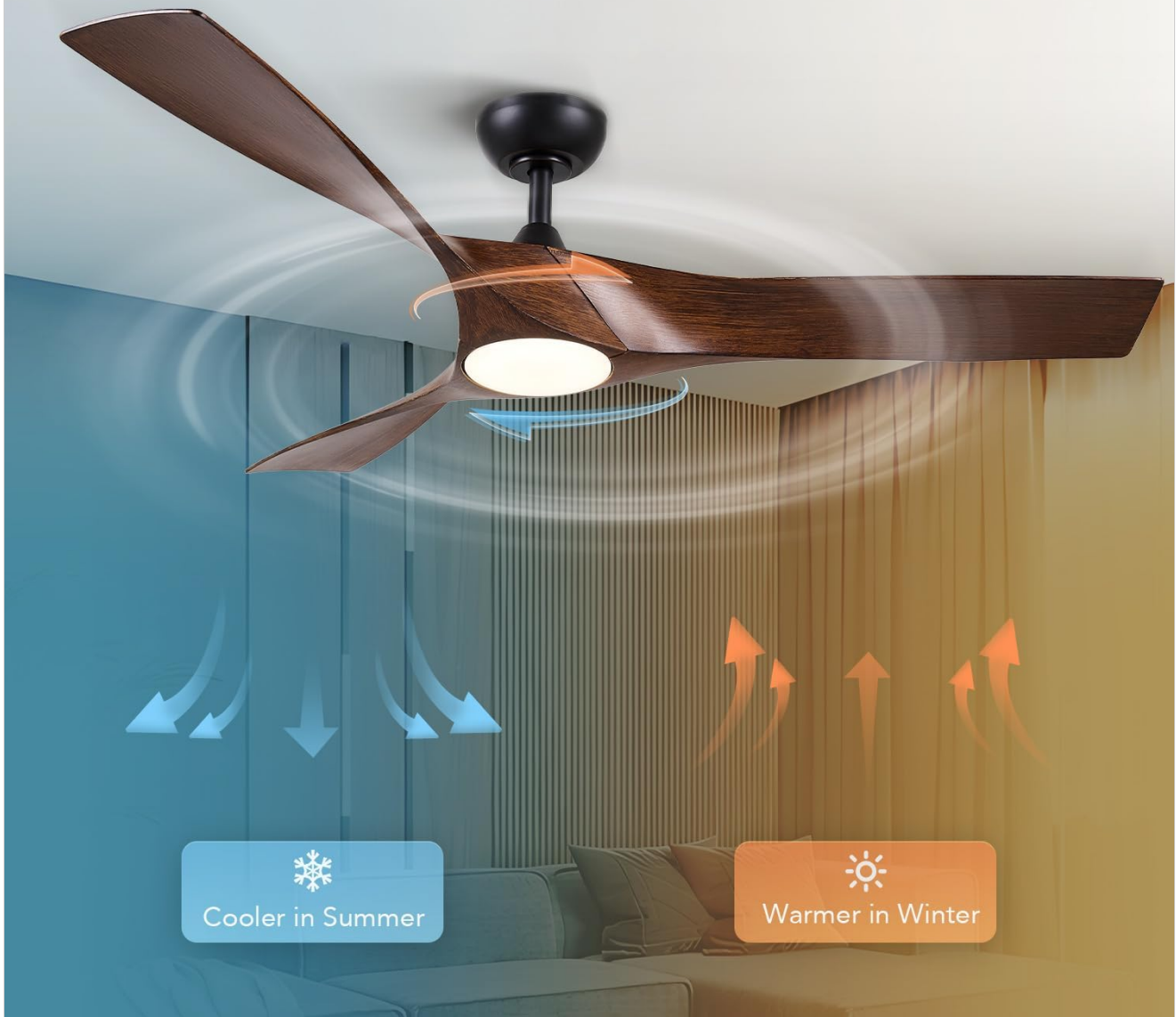
Figure 6: Reversible DC motor for year-round comfort.