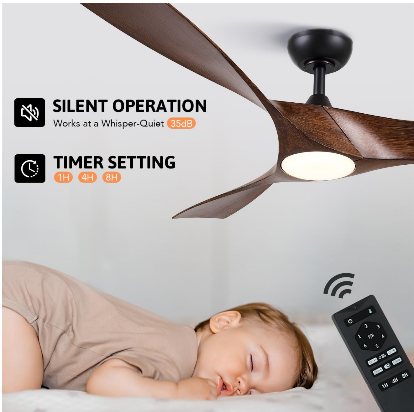
Figure 7: Silent operation and timer settings for undisturbed comfort.