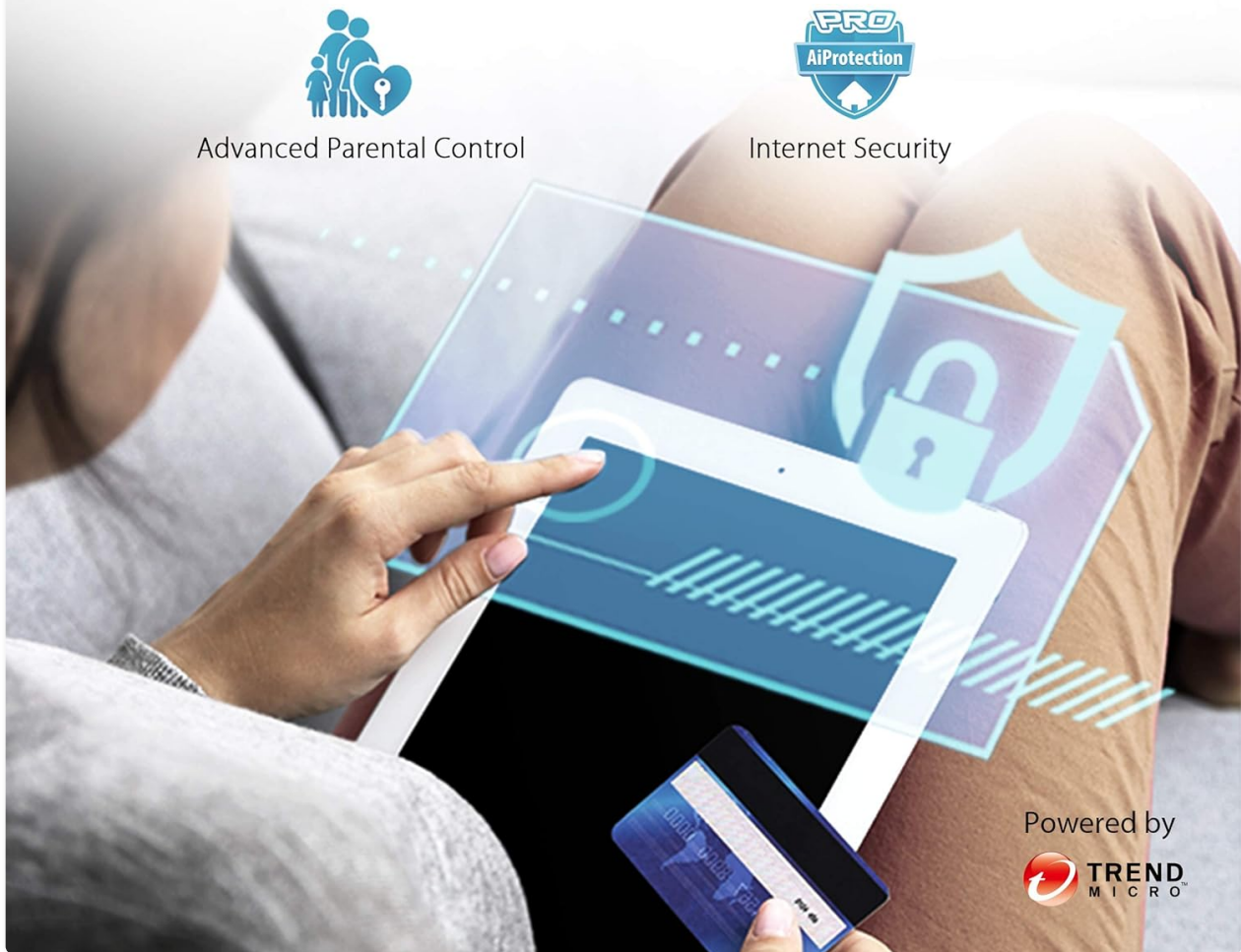
Figure 6: AiProtection Pro Features

Life-time free commercial-grade security for network