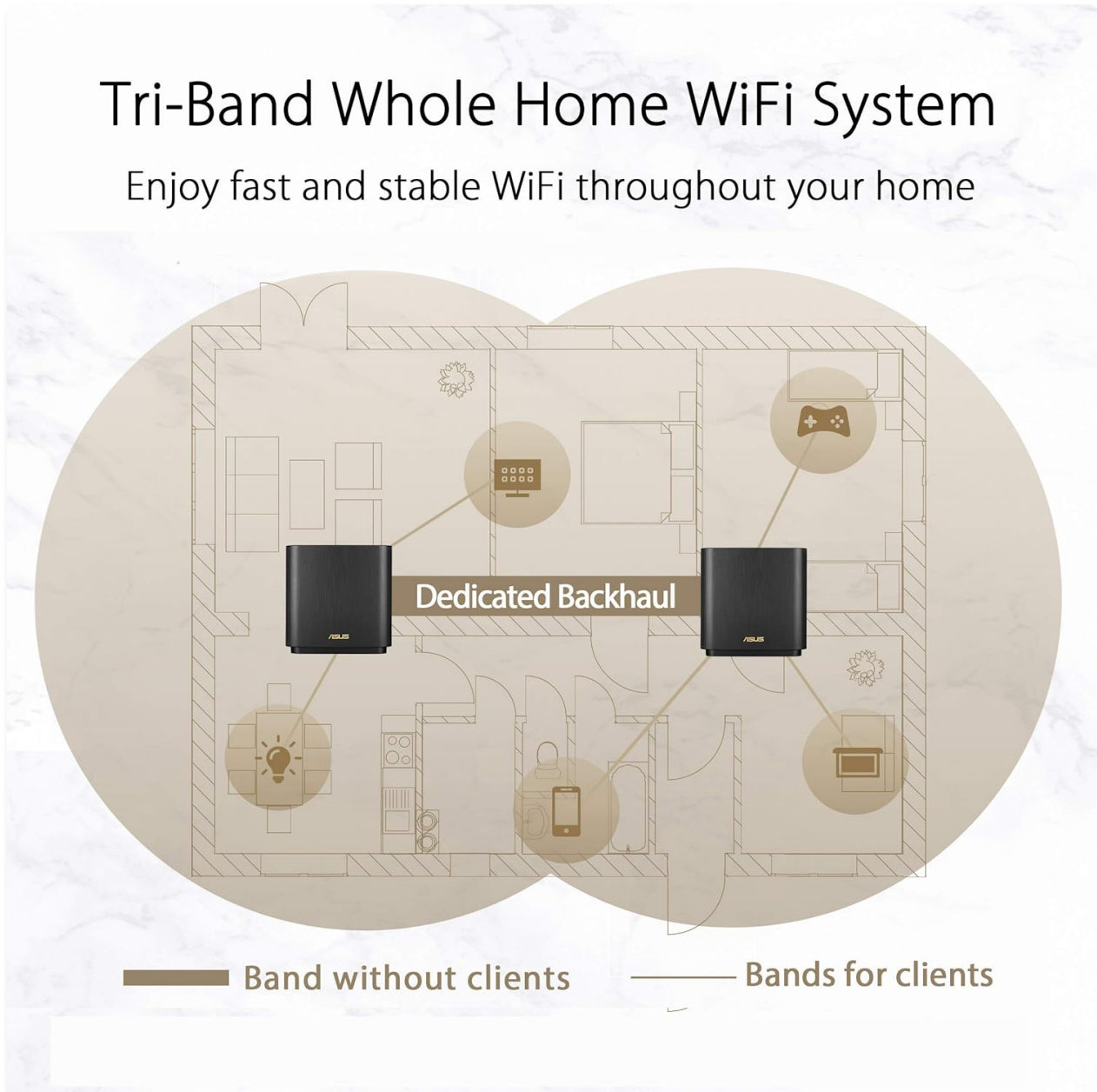
Figure 4: Tri-Band Whole Home WiFi System Coverage

The ZenWiFi AX XT8 operates on three frequency bands (one 2.4 GHz and two 5 GHz bands) to provide a dedicated backhaul for mesh communication, ensuring stable and fast connections across your entire home. This Tri-Band design, combined with WiFi 6 (802.11ax) technology, delivers higher capacity and faster speeds compared to previous WiFi standards.