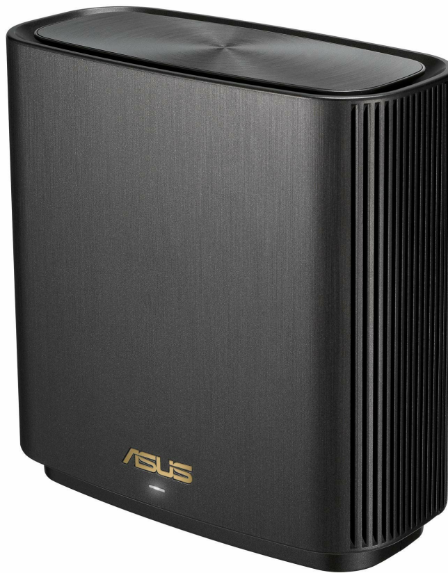
Figure 1: ASUS ZenWiFi AX XT8 Router (Charcoal)