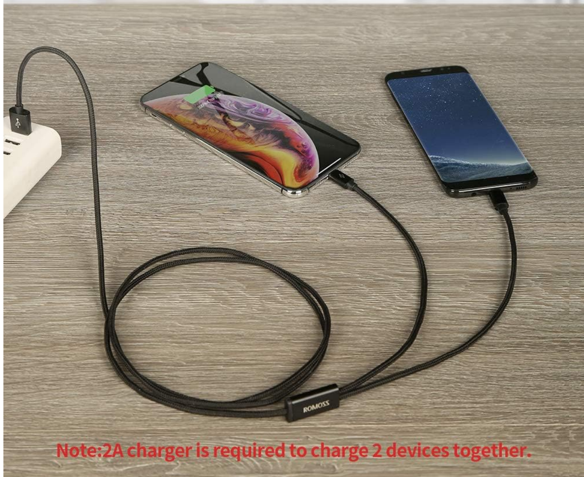
Image 5.4: A setup showing how one multi-USB cable can charge two different devices simultaneously from the power bank. Note: A 2A charger is required to charge 2 devices together.