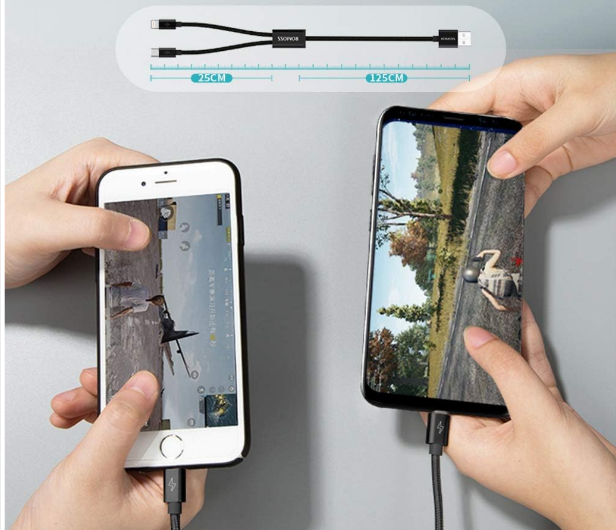
Image 5.3: An illustration demonstrating the practical length of the charging cable, allowing comfortable use of a smartphone while charging.