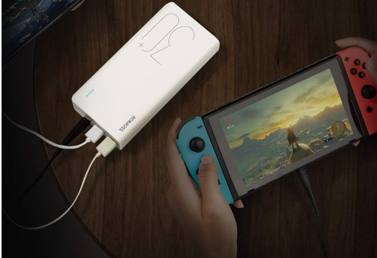
Image 5.1: The power bank actively charging a smartphone and a Nintendo Switch, demonstrating its multi-device charging capability.